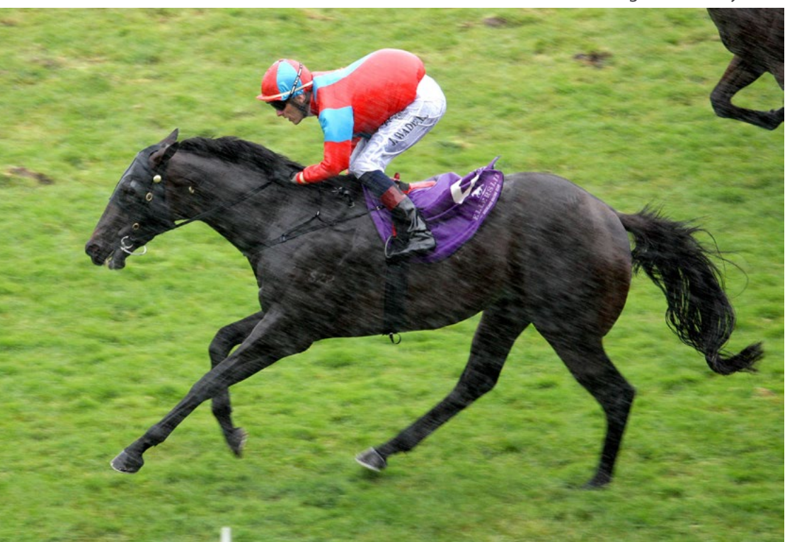
A potential Gr. 1 Vodafone New Zealand Derby attempt lies ahead for impressive Ellerslie winner Demonetization