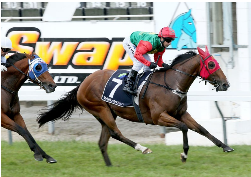
Bold front runner Smashing cruises home at Matamata

"It was a red hot field but she's not far off the best so with everything in her favour they were going to know she was there."