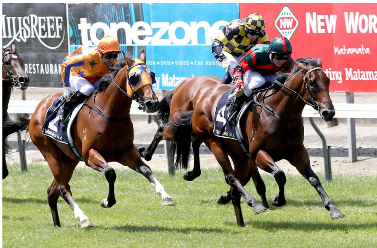
Summer Passage (green and red colours) holds on grimly to deny Summer Monsoon and complete an all-the-way win over the male juveniles at Matamata.