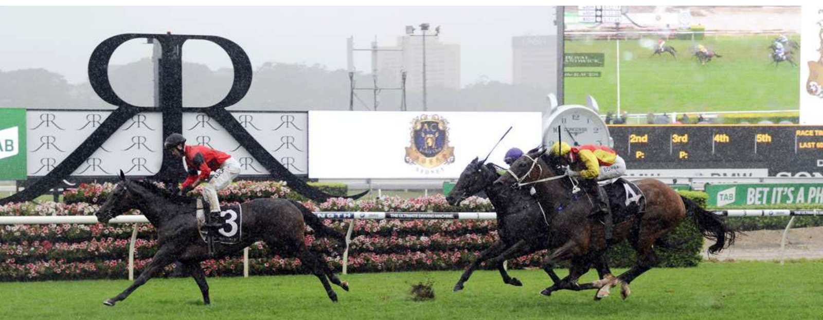
La Bella Diosa easily accounts for Omei Sword (#4) and Global Glamour in the Surround Stakes at yesterday's Randwick meeting.