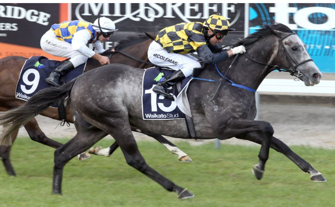
Coming staying star Von Tunzelman is too strong for Fanatic in Matamata's Kaimai Stakes.

The Waverley visitor Cruiser (NZ) (Captain Rio) enjoyed a good run behind the pace and boxed on bravely for third.