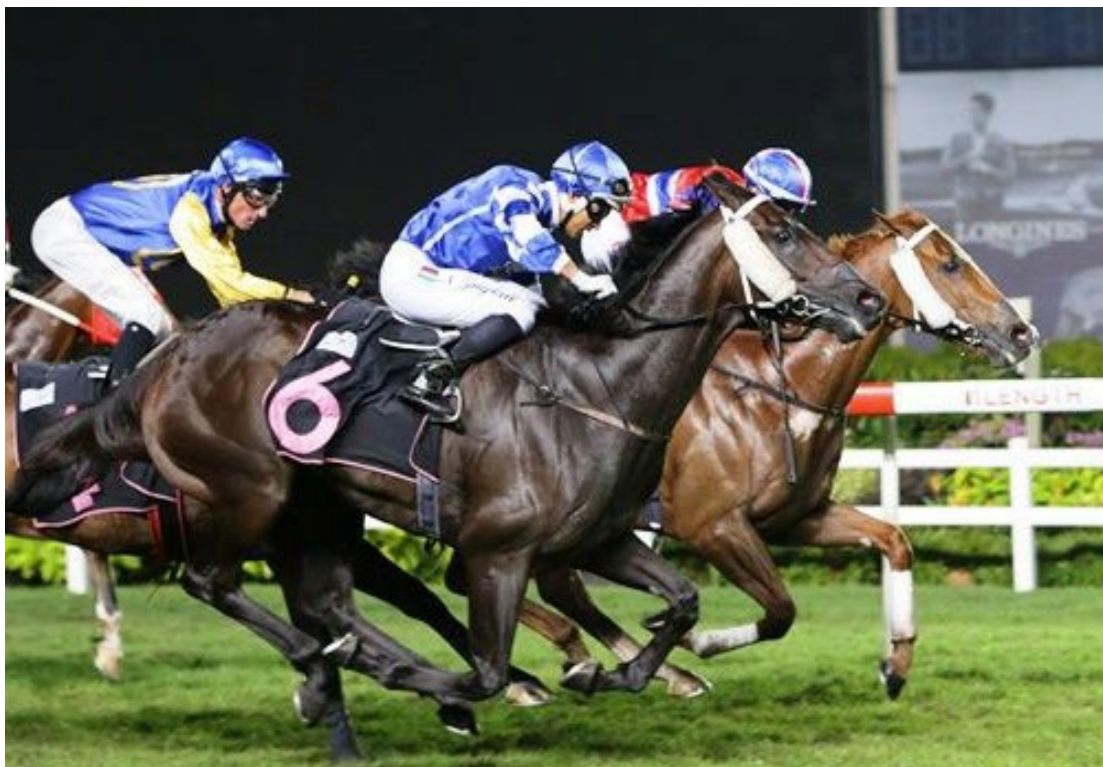
Song To The Moon (#6) does best in a tight finish with stablemate Perfect P in the main event on Kranji's Friday night card.

"I'm very surprised he won tonight. He was badly taken out and I thought I had lost the race," said the Mauritian.