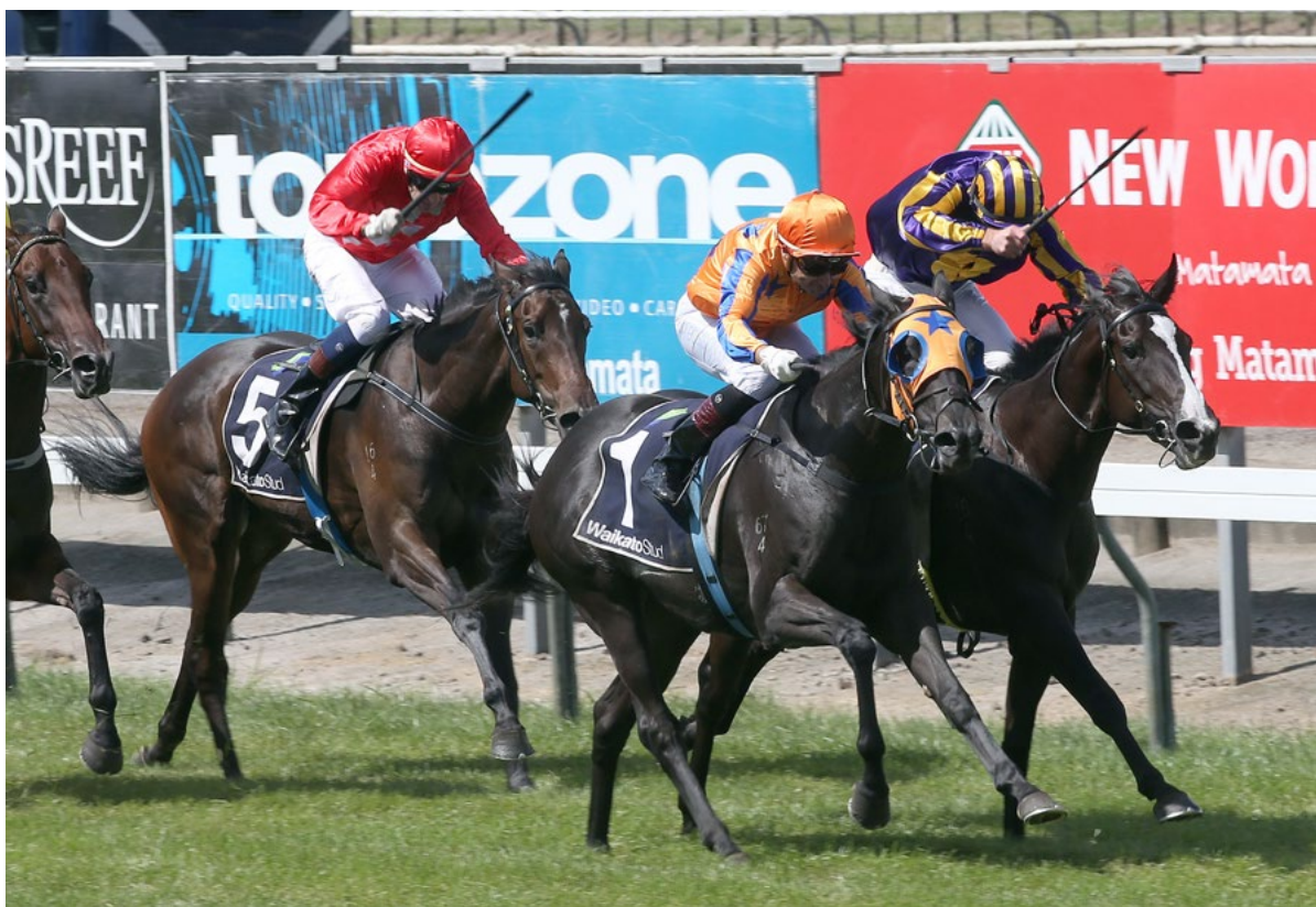
Gold Fever (nearest camera) narrowly fights off Joyfully to take the Matamata Breeders' Stakes.

"She travelled nicely and the fast pace helped," he said. "She's a tough little filly, not the easiest to ride, and all credit