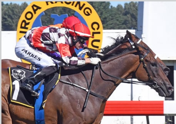
Wait A Sec (NZ)

Topweight and race favourite Wait A Sec (NZ) (Postponed) had been expected to prevail for the Hastings based duo as he concluded his Auckland Cup preparation with the Wairoa contest. Nobody told stablemate Saint Kitt (NZ) (Keeper) however, as he bolted to the