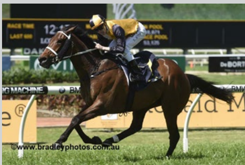
Antonio Giuseppe (NZ)