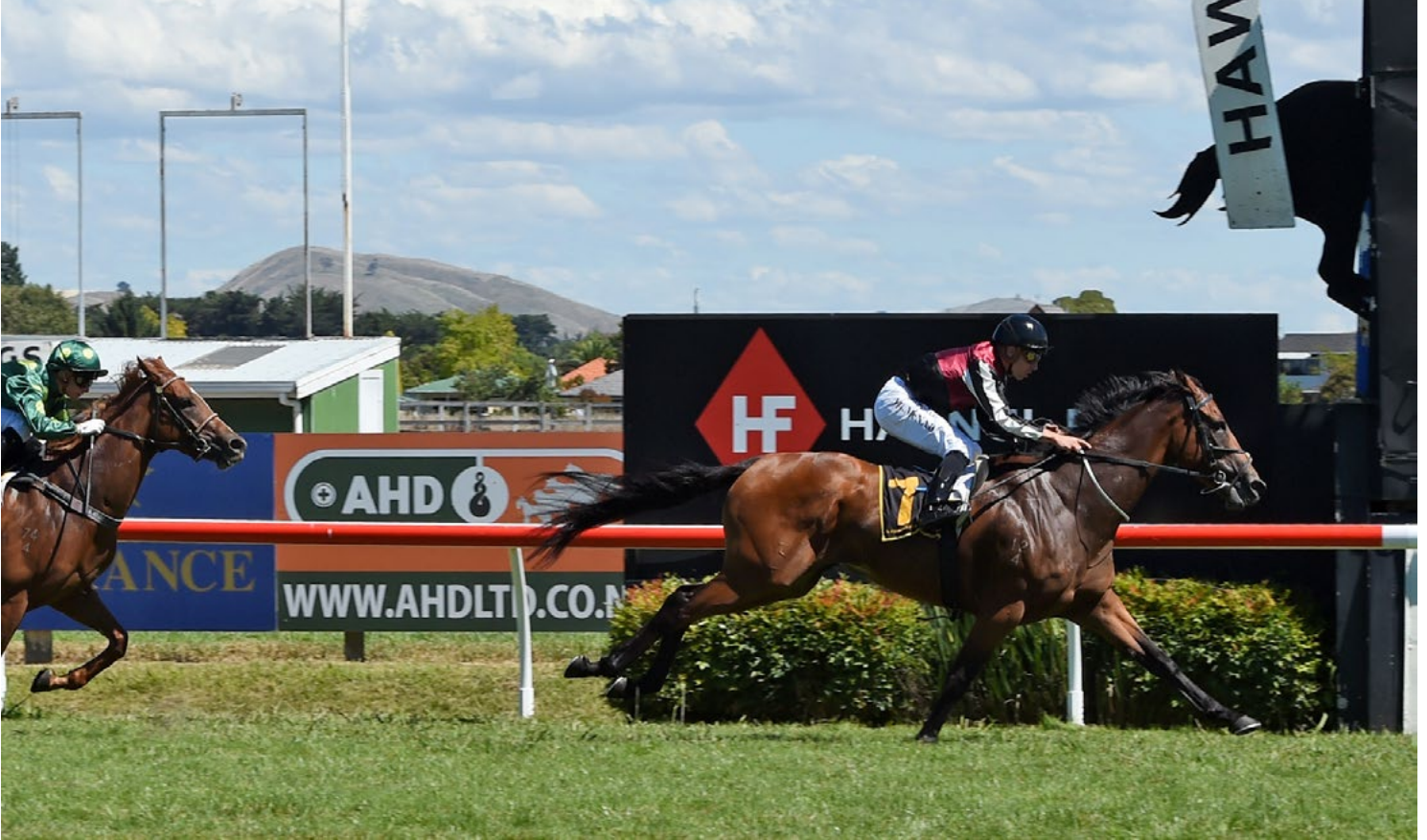
Dama Zorro storms home at Hastings

Promising three-year-old filly Dama Zorro (Husson) gave a further glimpse of her undoubted potential when she raced home to score a decisive win over 1200m at Hastings on Saturday.