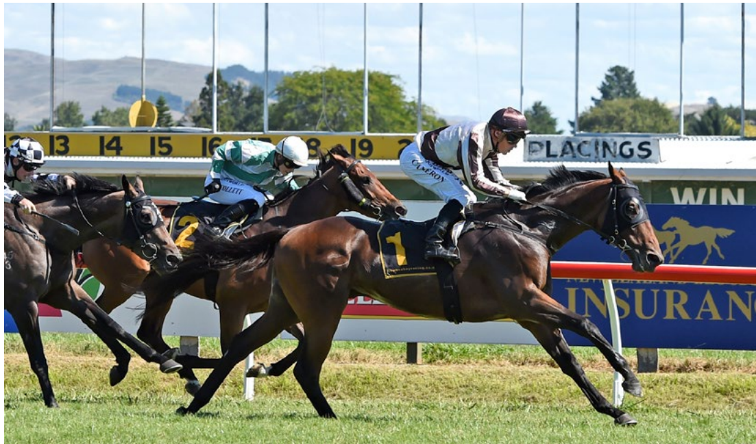
Excalibur races home at Hastings to cement his claim for the Gr.1 Barfoot & Thompson Auckland Cup at his next start