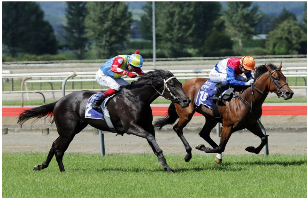
Contessa Vanessa continues her impressive three-year-old record with victory at Matamata