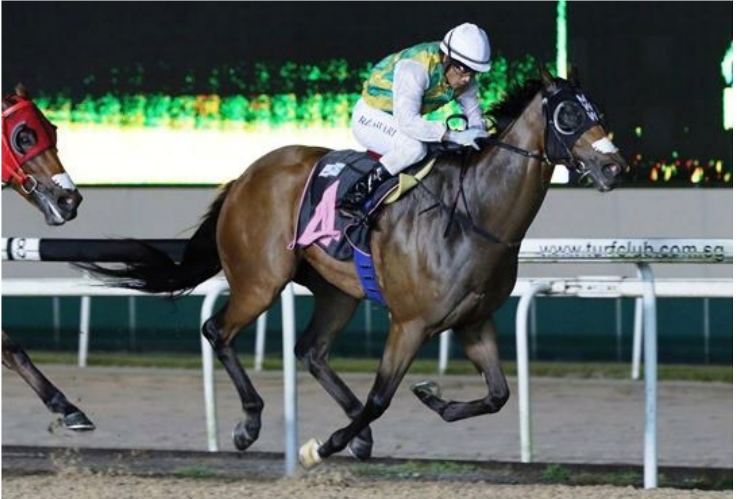
The addition of blinker-pacifiers saw Distinctive Darci return to form at the Singapore Turf Club on Friday night