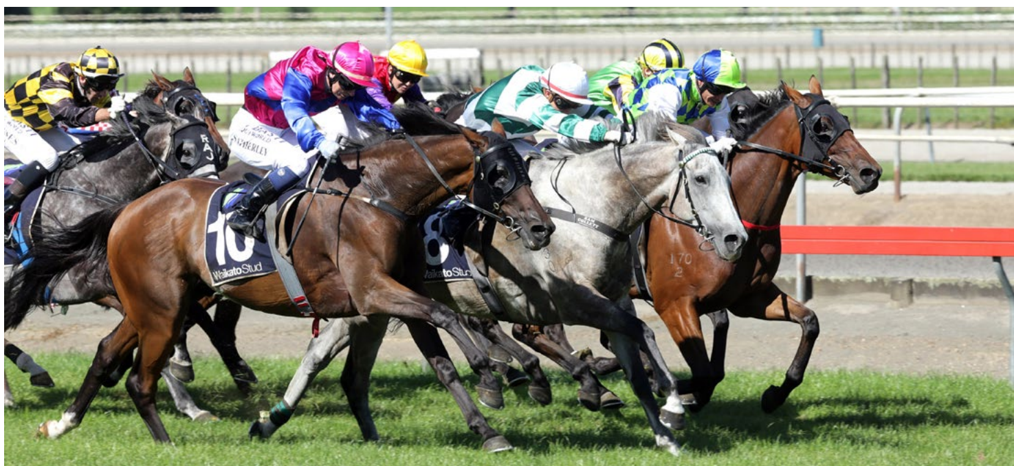
Show The World (outer) heads to the Gr.1 Auckland Cup off the back of his Listed Marks Ewen & Associates Kaimai Stakes win