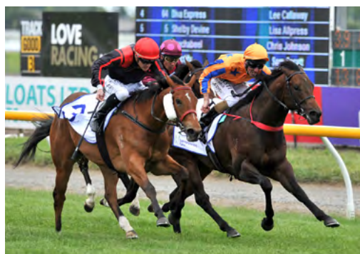
Miss Federer (NZ) (Swiss Ace)

"I think the travel has helped the horse and he has really grown up and improved."