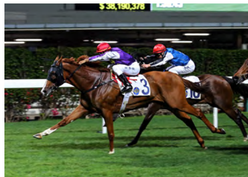
Merrygowin (NZ) (Castledale)

Pleased to have runners in both two-year-old features, Marsh is even more thrilled with the recovery of Vernanme after a pre-race scare going into last Saturday's Gr.2 Avondale Guineas (2100m). Full story here.