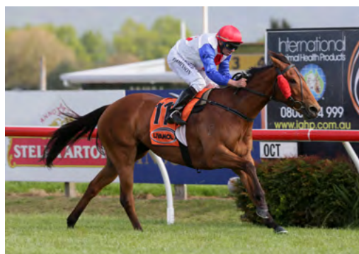
Savvy Coup (NZ) (Savabeel)