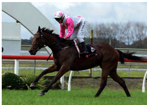
Blue Breeze (NZ) (Bullbars)