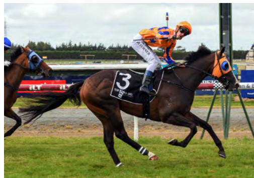
Weaponry (NZ) (Declaration Of War)