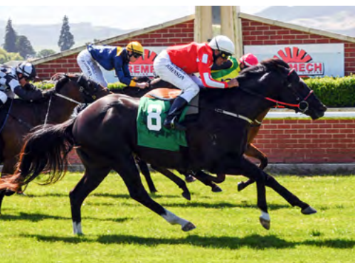
Sensei (Dream Ahead)