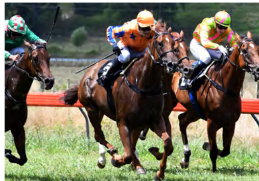
Griffin (NZ) (Iffraaj)