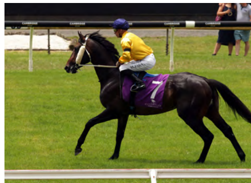
Vernanme (NZ) (O'Reilly)