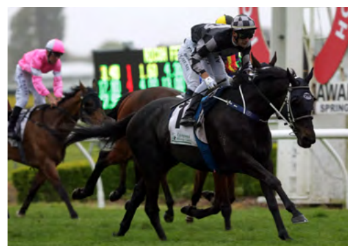
Five To Midnight (NZ) (Domesday)