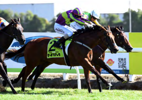
Start Wondering (NZ) (Eighth Wonder)

three races in Sydney before joining the Rayners after a bleed.