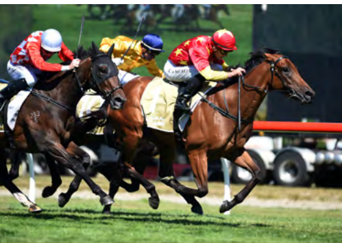
Madison County (NZ) (Pins)