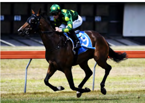
Spring Delight (NZ) (Tavistock)