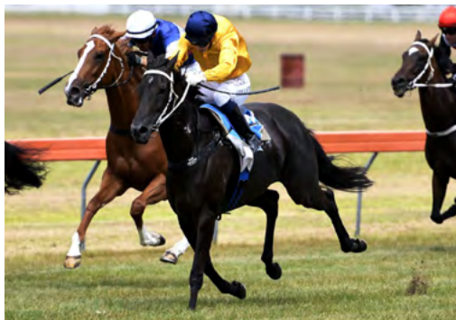
Tantalising (NZ) (Savabeel)