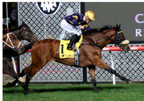
Vengeur Masque (Monsun)

"She has been in really good form. She just hit the front a couple of times and just knocked off the job and I think the blinkers really helped."