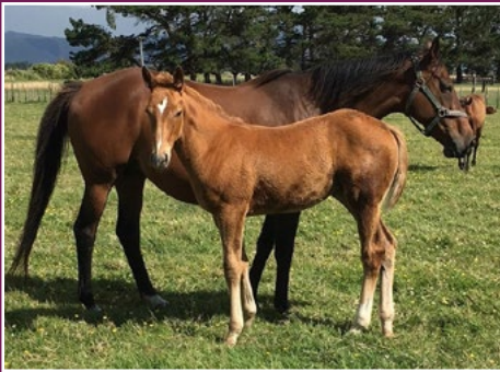
MARE WITH FOAL AT FOOT