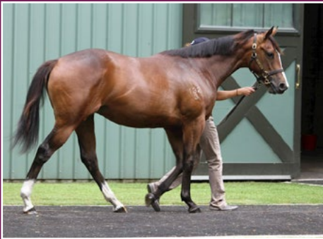
WELL-RELATED RACE FILLY