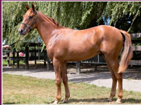
UNRESERVED PER INCANTO COLT