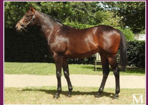
WELL-RELATED TAVISTOCK COLT