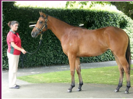
YEARLING FILLY BY JIMMY CHOUX