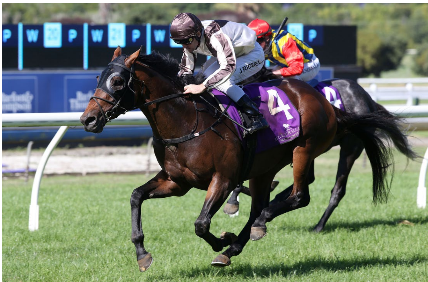
Excalibur strides clear at Ellerslie to establish his Gr. 1 Vodafone New Zealand Derby credentials