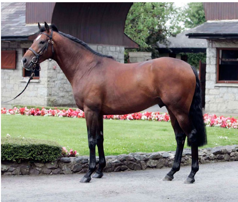
White Robe Lodge stallion Raise The Flag produced Listed Tasmanian Oaks winner Parthesia