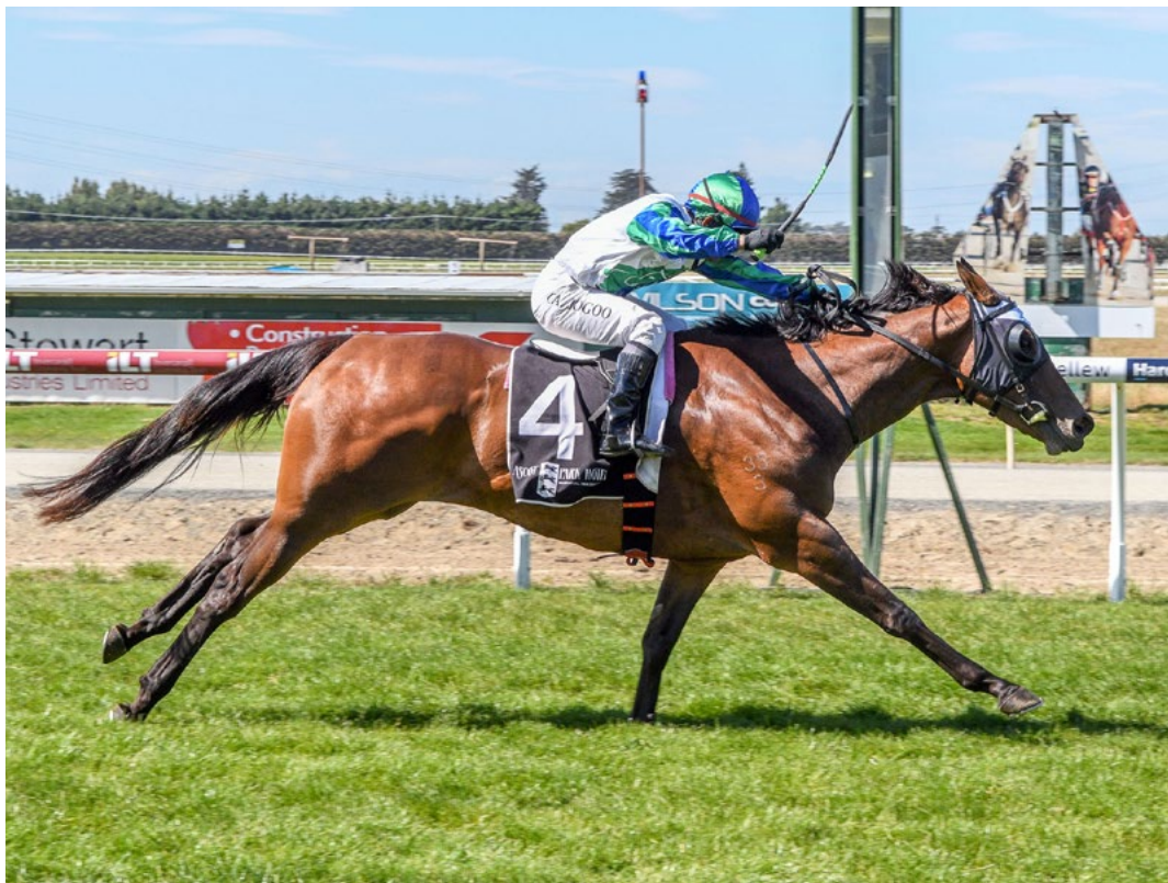
Stylish Southland Guineas winner Residential