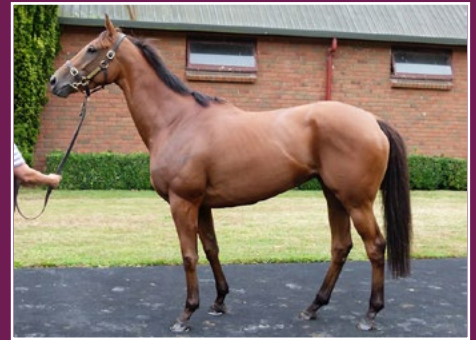
FULL-SISTER TO MULTIVICTORY