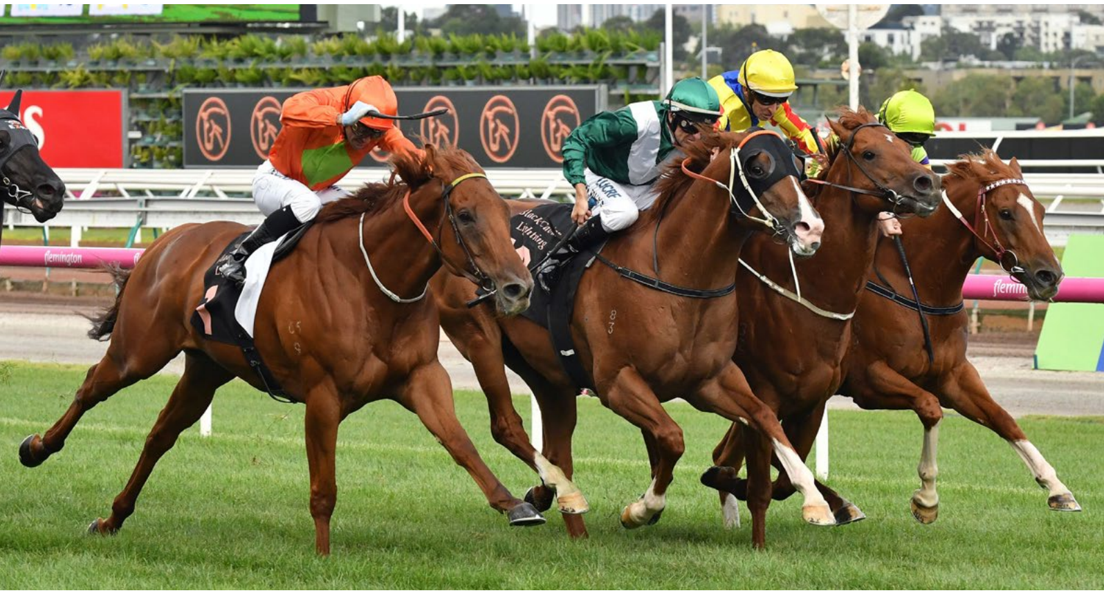
Inside the last thirty metres of yesterday's Lightning at Flemington and eventual winner Terravista (orange colours) has burst through a widening gap. Closer to the rail, runner-up Spieth is squeezing between Star Turn (green colours) and Flamberge.

ramatic is one way to describe yesterday's Group One Lightning Stakes at Flemington. There was pre-race drama when three runners were scratched at the gates before $15 shot Terravista (Captain Rio) prevailed in a thrilling finish over the $6 third favourite Spieth (NZ) (Thorn Park) and $4 second choice Star Turn (Star Witness).