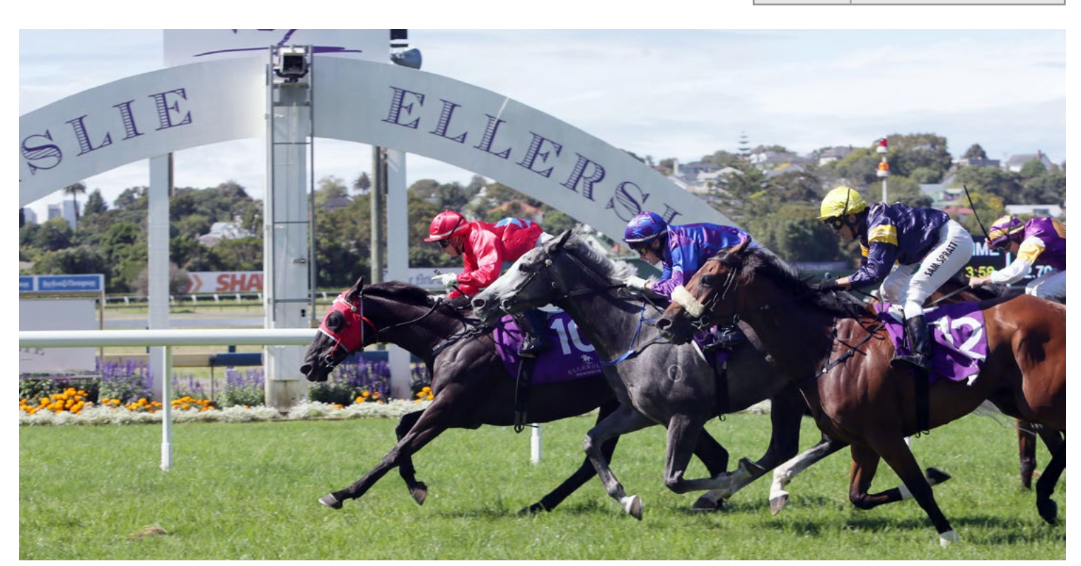
El Soldado again rocks punters as he clings to his lead in yesterday's Avondale Cup. The grey Megablast gets closest with last year's Wellington Cup winner Mister Impatience continuing his improvement by running third.