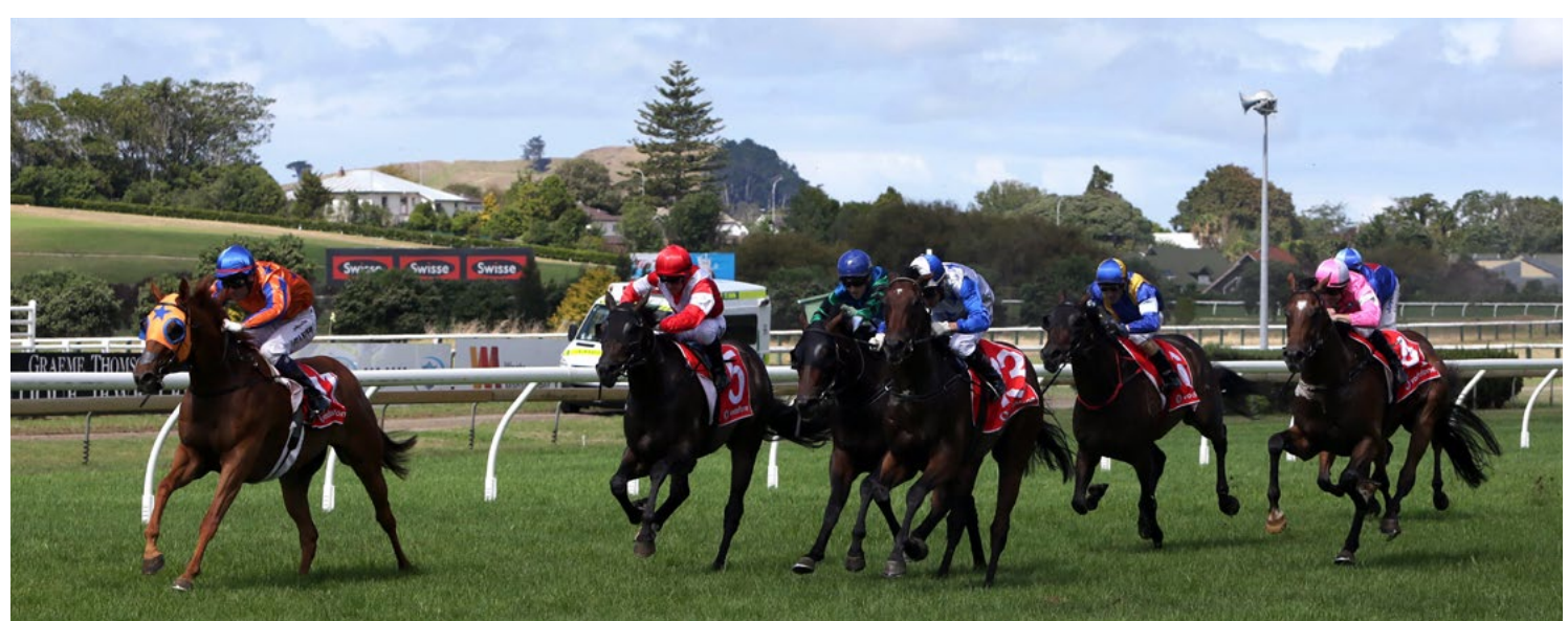
A lap of the track earlier, Gingernuts had muffed the getaway and given his Avondale Guineas rivals a start of around five lengths. As the field nears the finish, he's slipped through on the inner and is racing away to a 1¼-length win from Charles Road (grey and blue colours) and Mongolian Wolf (#5).

he connections of Gingernuts (NZ) are going to have to speculate to accumulate if they are to fully cash in on the three-year-old's form, the son of Iffraaj not currently among the entries for the Group One New Zealand Derby but yesterday at Ellerslie producing a compelling argument for inclusion.