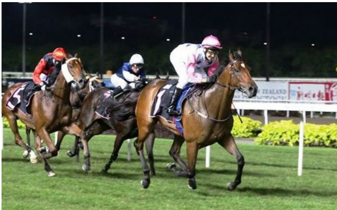
Debt Collector demolishes the opposition in Friday night's feature at Kranji.