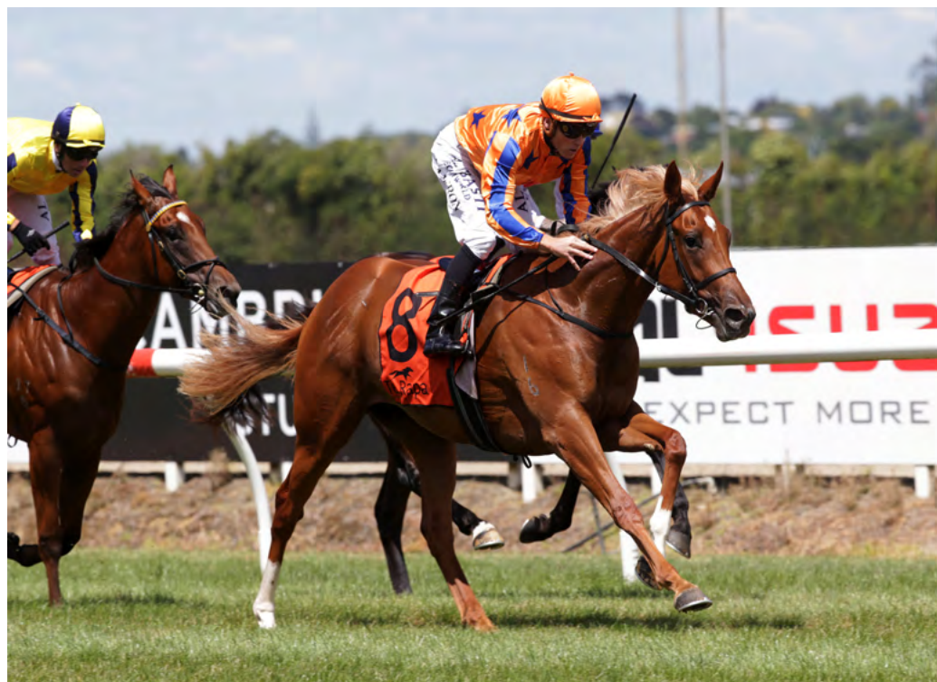
Flashy filly Harlow storms to victory at Te Rapa