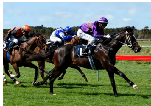
Lincoln Falls (NZ) (Dundeel)

Lincoln Falls will race in blinkers for the first time but faces an awkward draw of