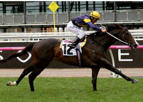
Grunt (NZ) (O'Reilly)