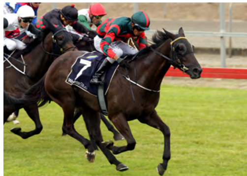
Spring Heat (More Than Ready)