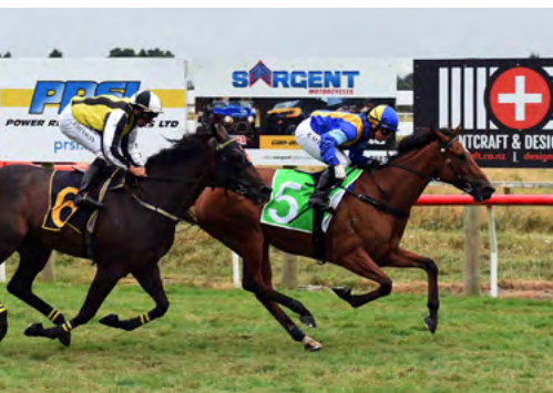
Artiste (NZ) (Mastercraftsman)