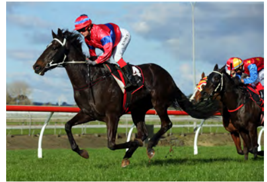
Verry Flash (NZ) (Zed)

progressive four-year-old stayer Verry Flash (NZ) (Zed) will put in a good performance in the Rating 82 Risk Management Group Premier (2100m) at Te Rapa on Saturday as he heads towards loftier targets.