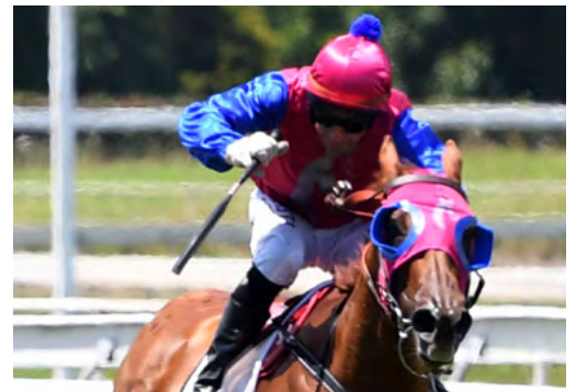
Blondlign (NZ) (Align)