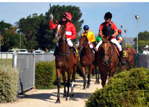
Kinshasa (NZ) (Tavistock)