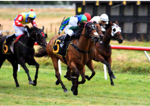
Flamingo (NZ) (Pins)