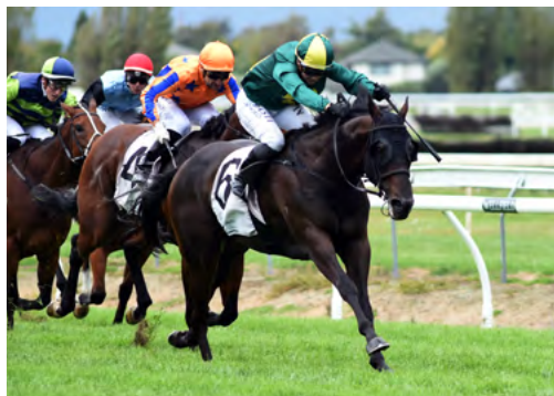
Magnum (NZ) (Per Incanto)