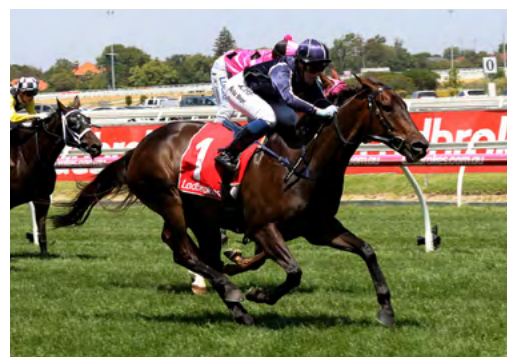
Lamborghini (NZ) (Shinko King)