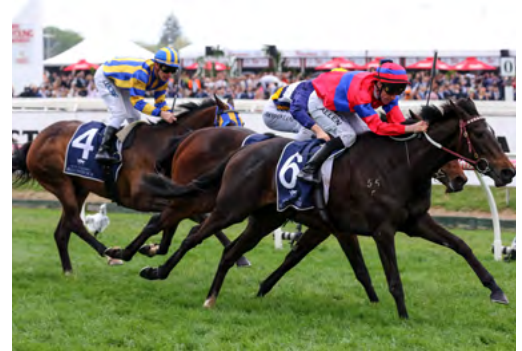
Verry Elleegant (NZ) (Zed)