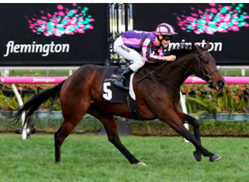
Moss 'n' Dale (NZ) (Castledale)