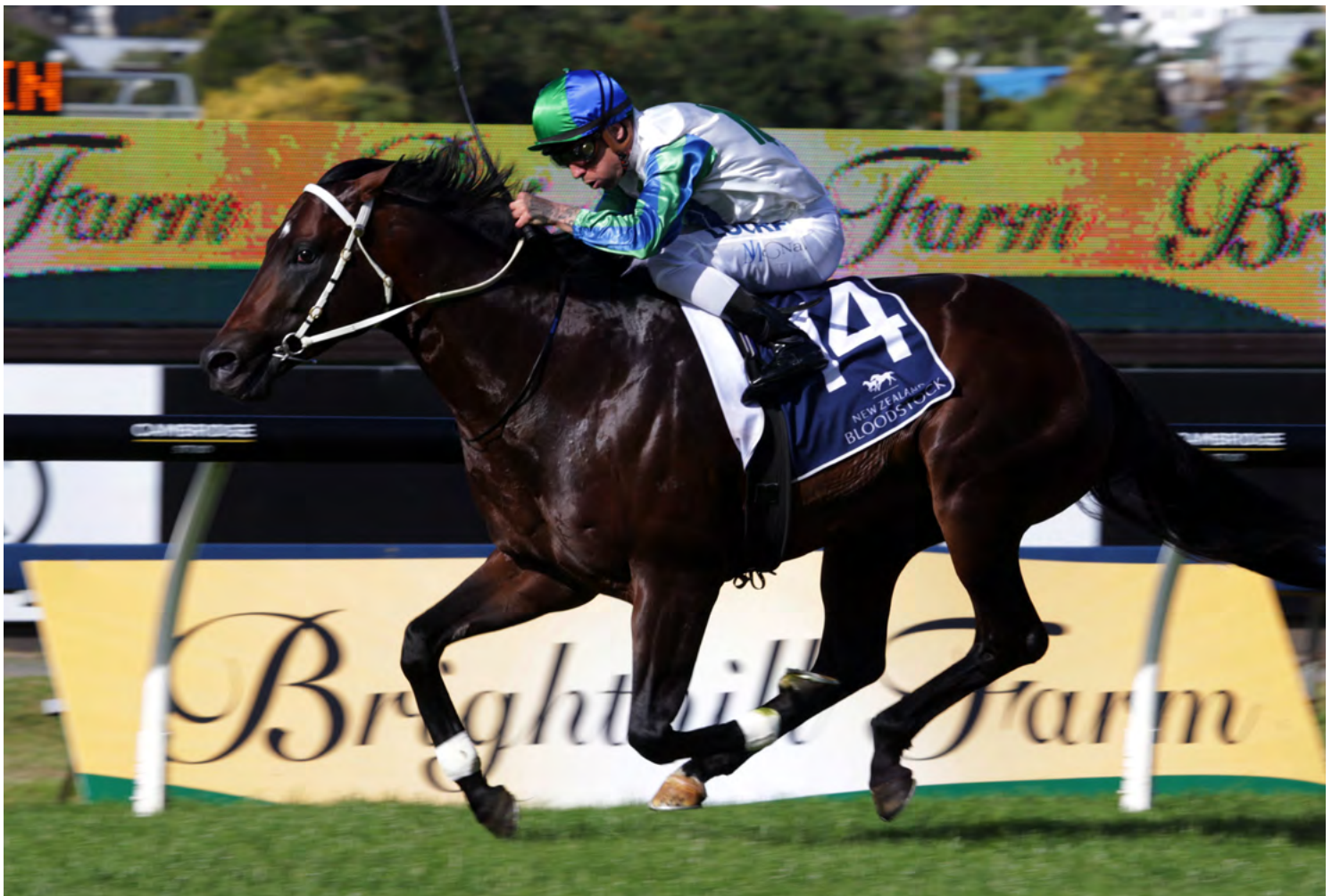
Ardrossan is over his health issues and shooting for a Group One victory at Te Rapa