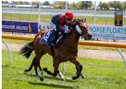
Miss Federer (NZ) (Swiss Ace)