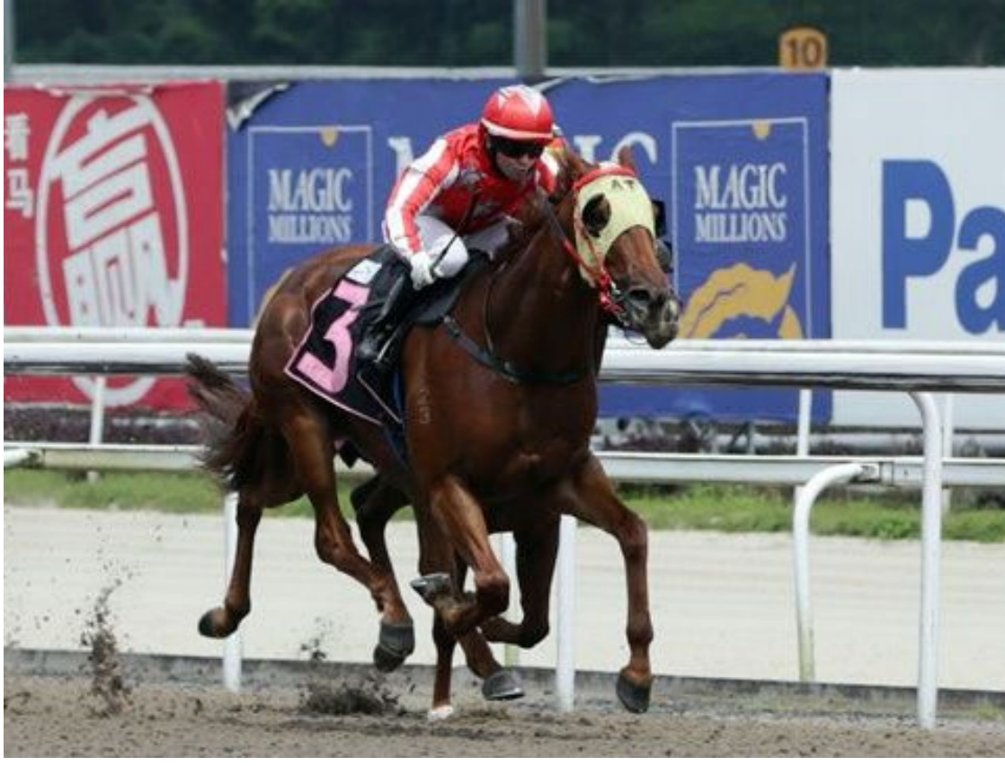
Nova Swiss remains unbeaten after his fifth win at Kranji on Sunday

"I was just a bit surprised when I saw Speedy Dragon was