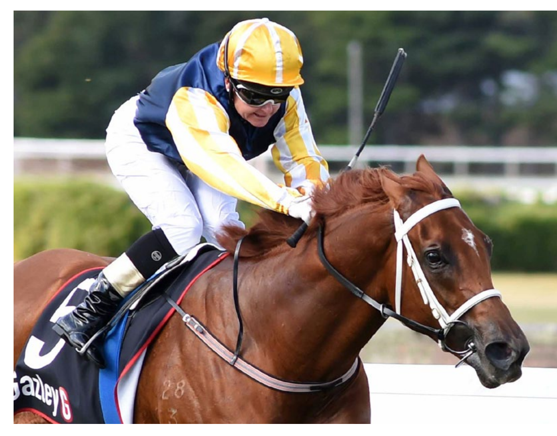
Three-year-old filly McPhoebe tackles the older mares at Tauherenikau today

"This season we've tried to get her to settle in her races and it seems to have worked the oracle. She was