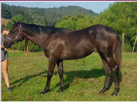
THREE-QUARTER SISTER TO OUR MALAMBO.