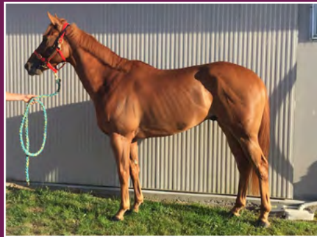
LIGHTLY TRIED SON OF RIP VAN WINKLE.