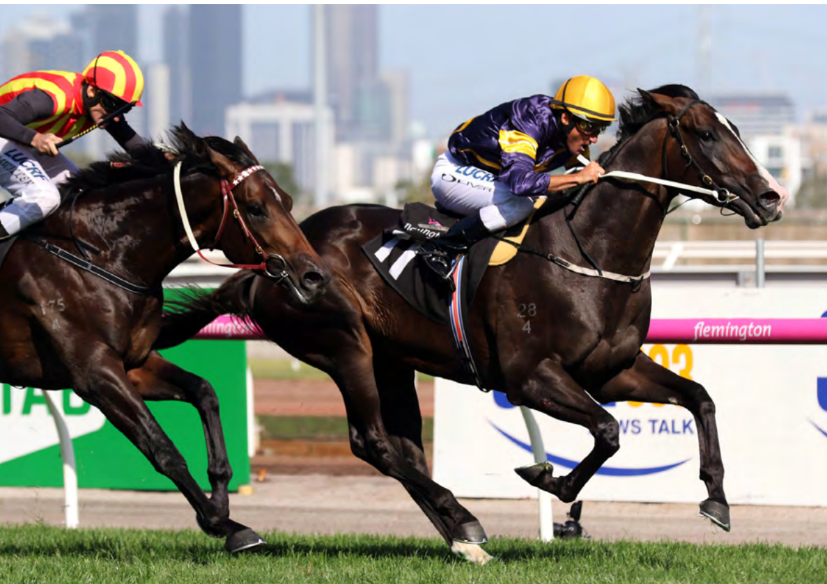
Dual Group One winner Grunt is on target for his All-Star Mile campaign