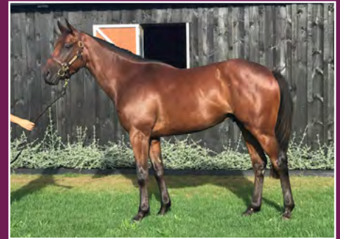
UNRESERVED TRIAL WINNING SON OF BULLBARS.