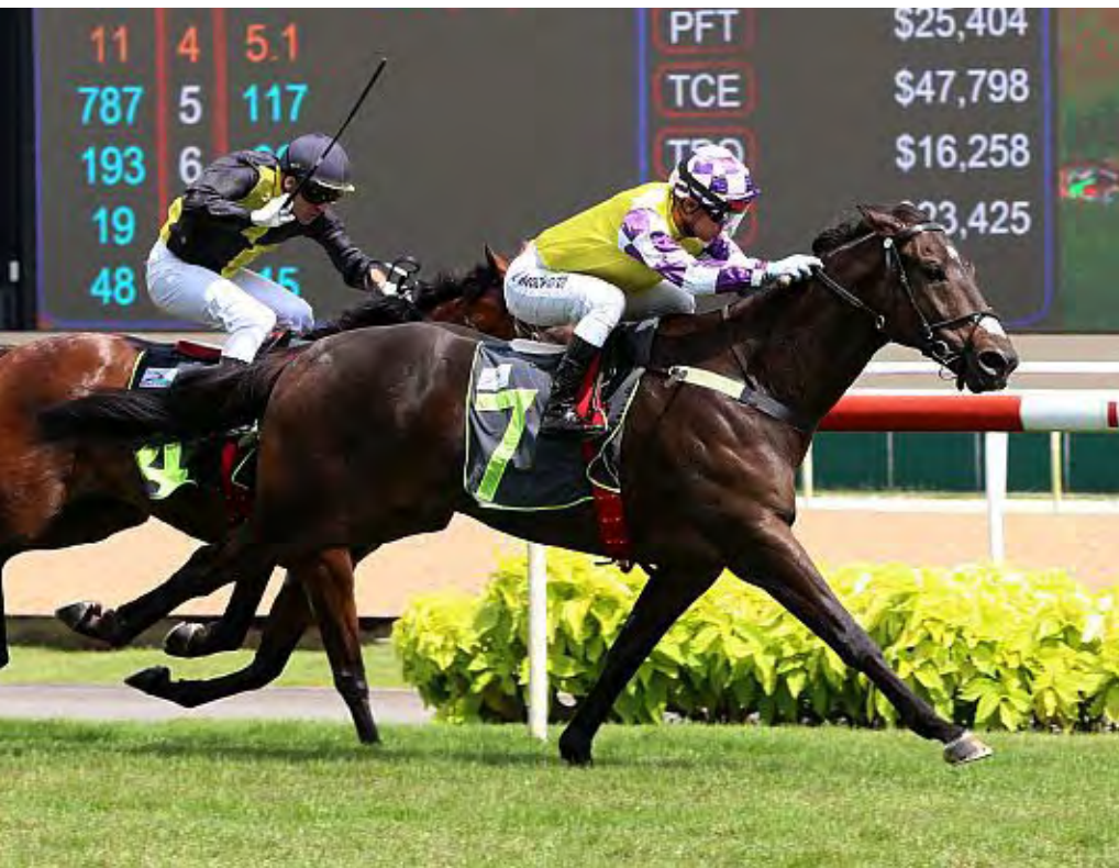
Sacred Croix scores comfortably at Kranji

“On his conformation, he’s a very big horse and the mile will be okay for him.”