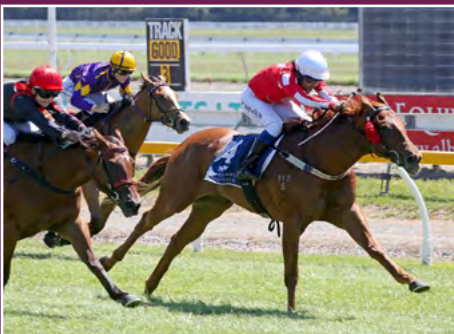
UNRESERVED WINNING FILLY OUT OF A FULL TO RED DAZZLER.