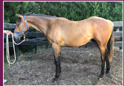
UNRESERVED PROISIR FILLY OUT OF A HIGH CHAPARRAL MARE.