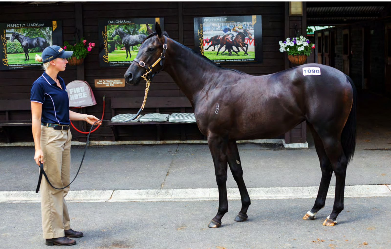
Lot 1090, the Sweynesse filly that topped the Book 3 session at Karaka

North Island-based first season sires were to the fore on Sunday with 179 lots going under the hammer at the Book 3 session of New Zealand Bloodstock's National Yearling Sales Series.