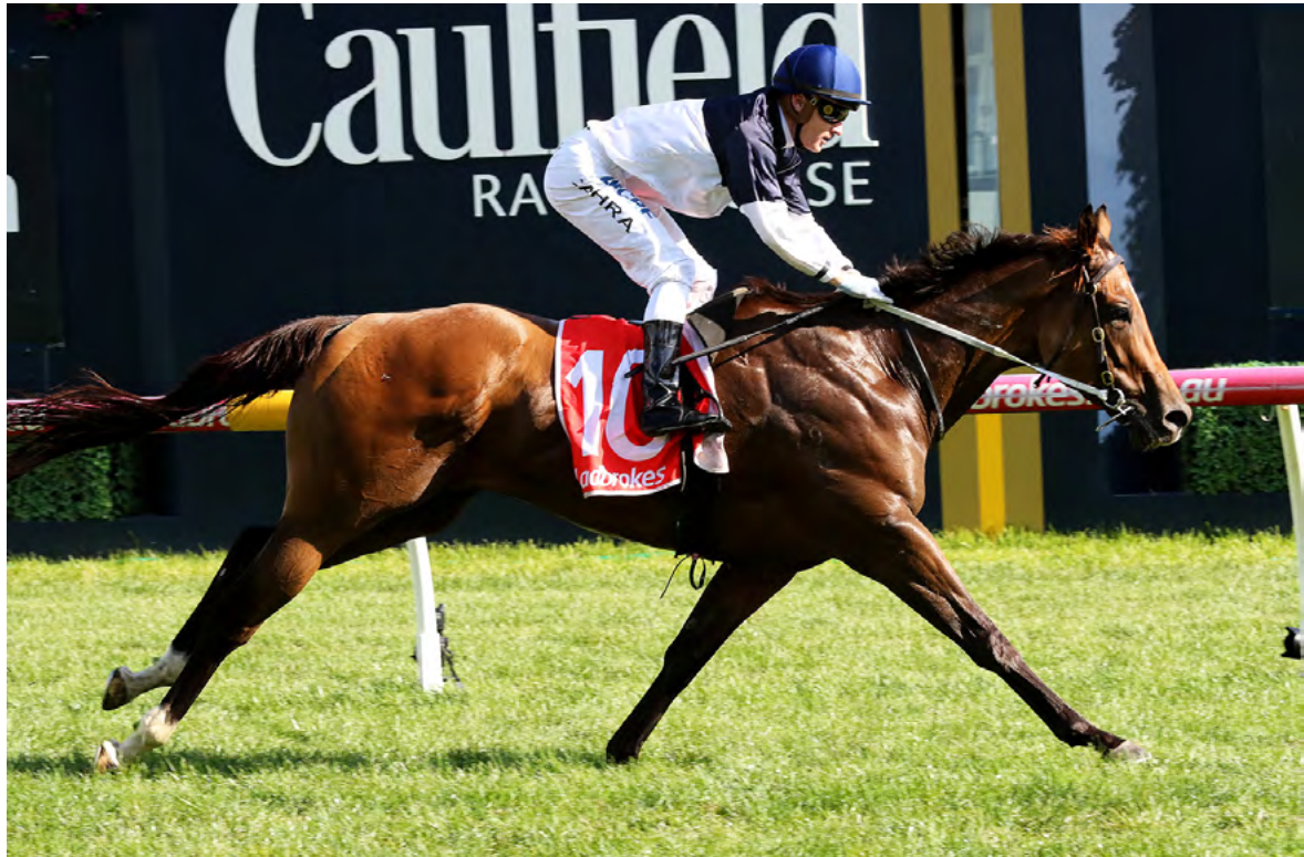
Heptagon scores nicely at Caulfield

"I spoke to them this morning about boxes becoming available. I will keep my 75 boxes here at Caulfield and at the moment there might be 15 or 16 down there, but I wouldn't mind 40