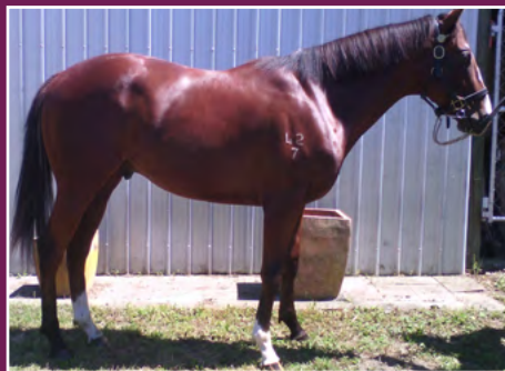
YEARLING COLT BY SUPER EASY.