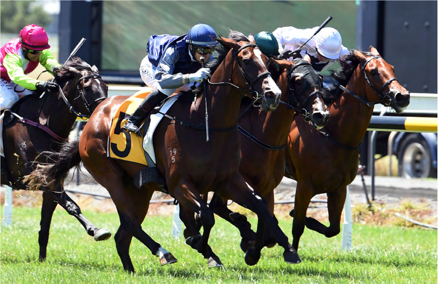
Vigor Winner scores at New Plymouth

Impressive maiden winner Vigor Winner (Declaration Of War) defied a wide barrier to win Saturday's $80,000 Platinum Homes Taranaki Summer Challenge (1400m) at New Plymouth and looks destined for stakes company.