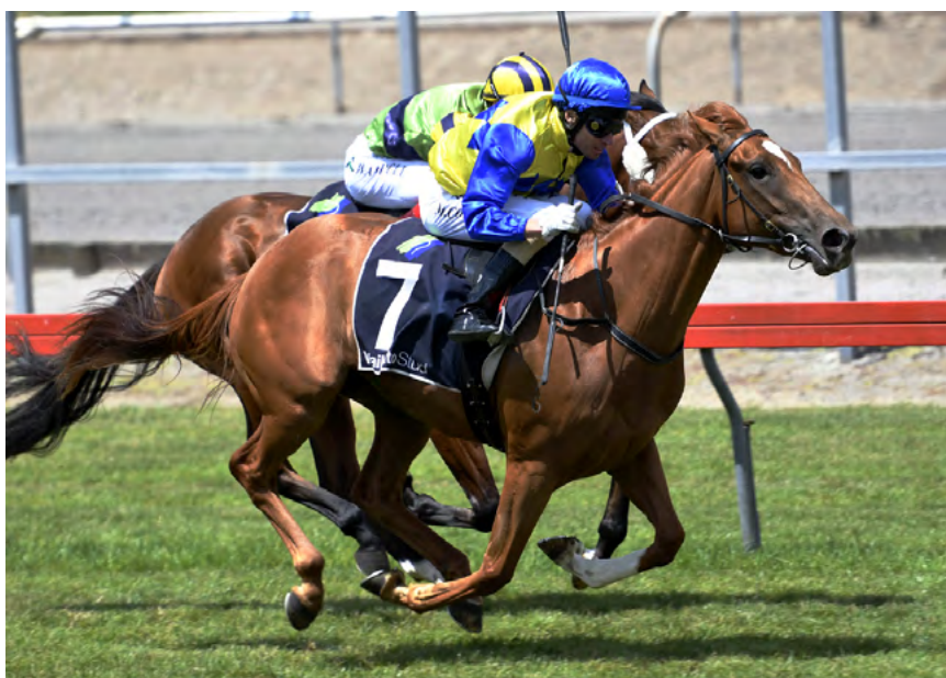
Speedy filly Bella Mente breaks her maiden status at Matamata