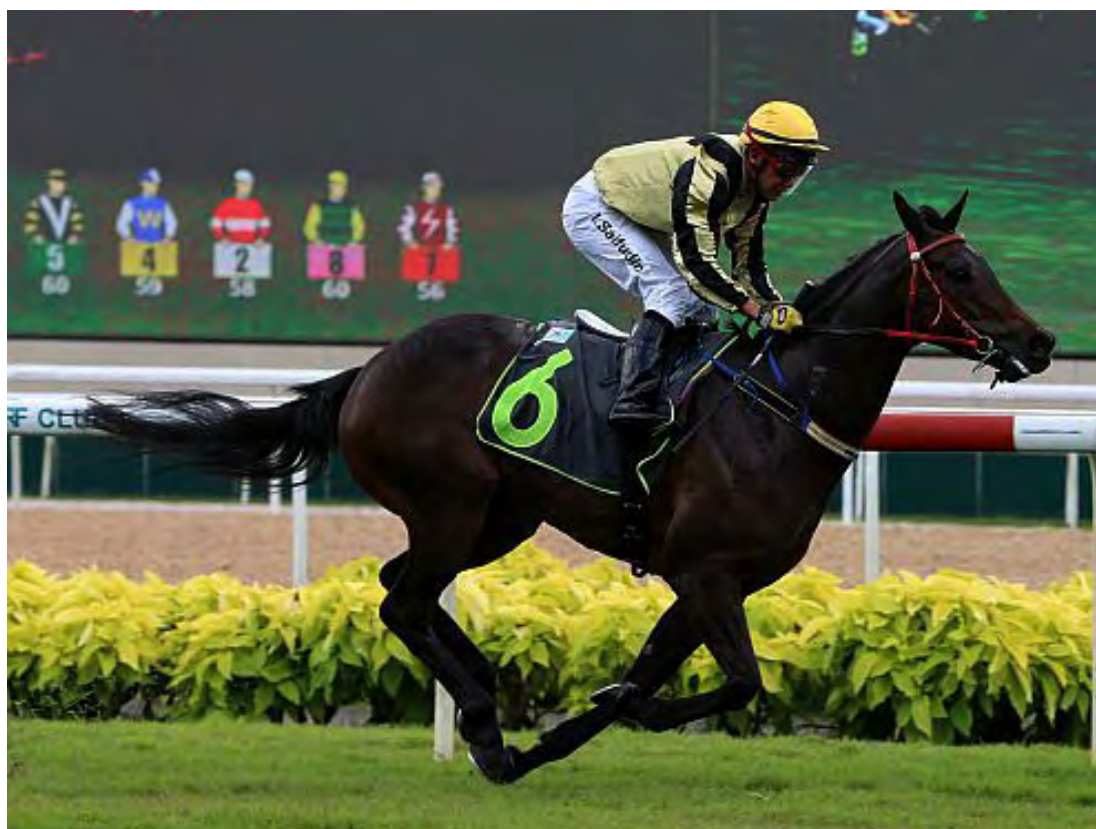
I'm A Conqueror wins on debut at Kranji