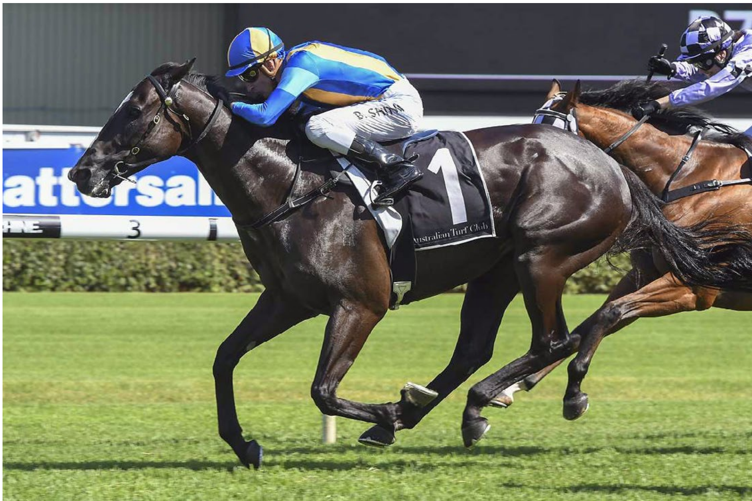
Music Magnate returns to form in the Listed Christmas Classic