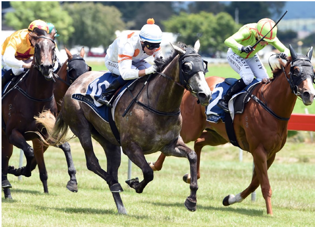
Chill (grey) proves too good for No Doubt A Star

"She hit the line well and it was a really, really good first