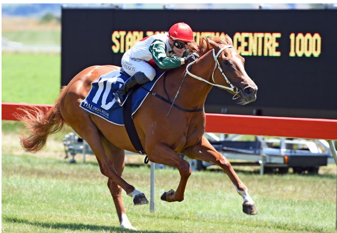
I Am Queen races away to score convincingly at Taupo