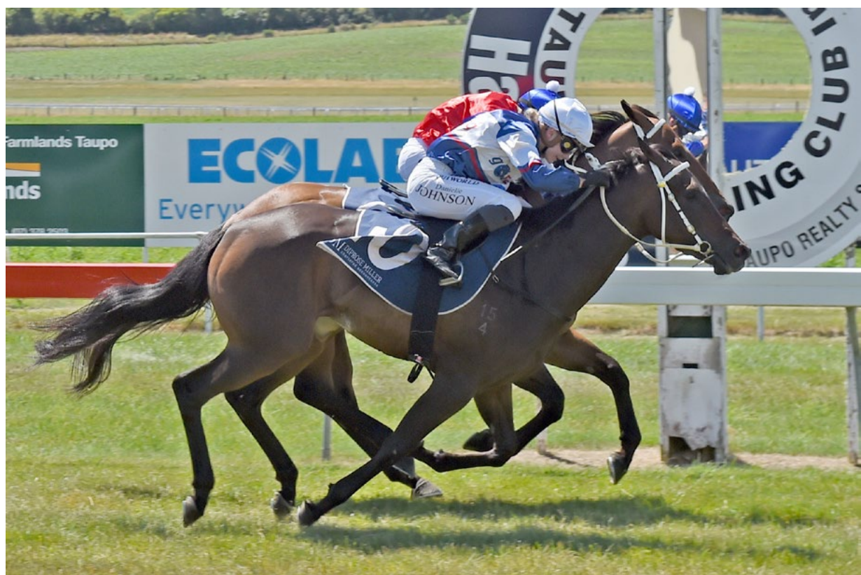
Sophie's Choice produces a tenacious effort to beat the older horses