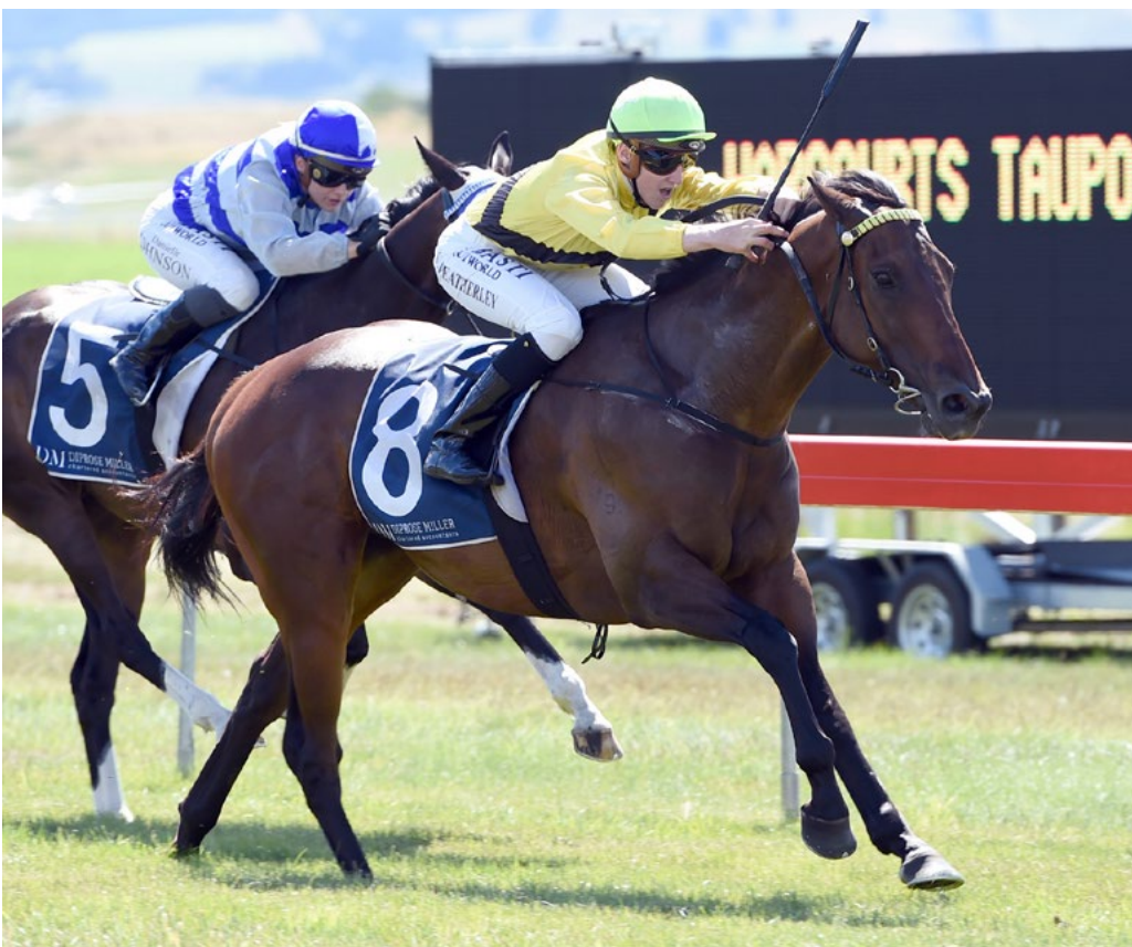
Versatile galloper Nothing Trivial claims the Taupo Cup