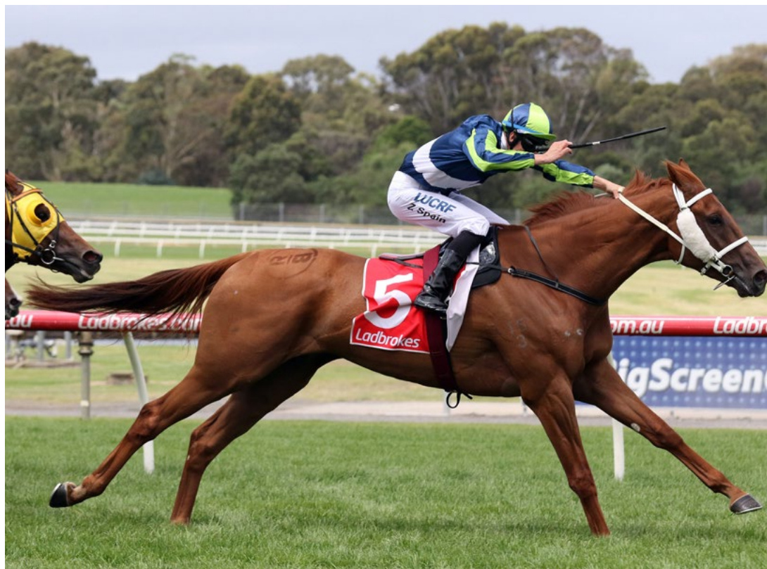
El Sicario scores his first win on turf at Sandown