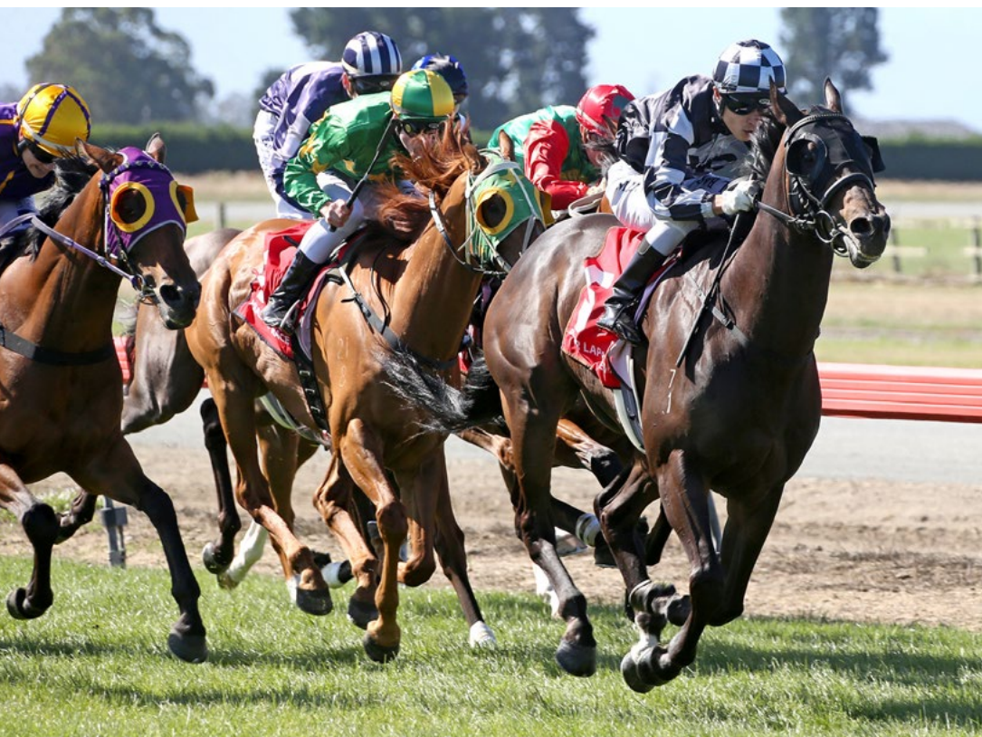
Kolonel Kev claims the Listed The Craigmore Timaru Cup at the expense of Boots 'N' All