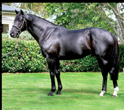
PERFECTLY READY (Aus) More Than Ready - Elle Duccio, Danehill