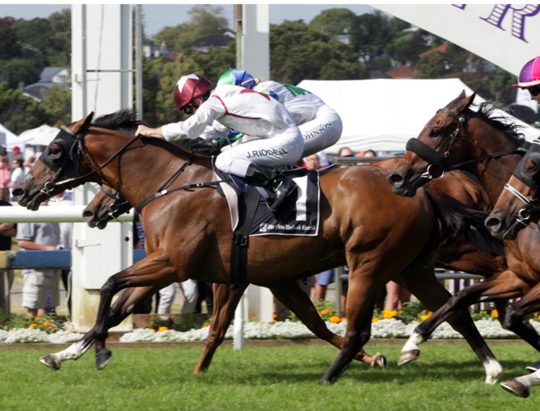
Speech Craft bursts from the pack to nab Snowdrop virtually on the line in the Hallmark Stud Handicap.