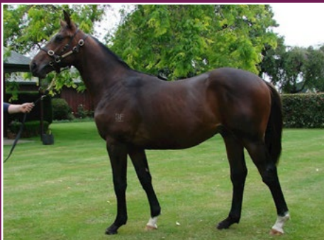
Yearling colt by O'Reilly

Featuring 10 lots including yearlings, broodmares, unraced and raced horses.