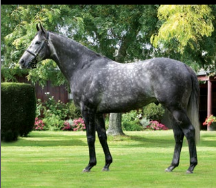
DALGHAR (Fr) Anabaa - Daltawa, Miswaki