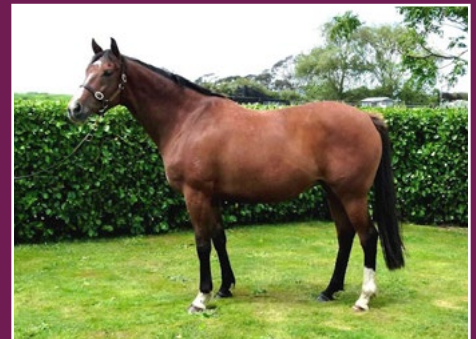
Flying Spur mare in foal to Jimmy Choux

NEXT AUCTION DATES • Accepting listings from Thursday 29 December • Listings close 7pm Wednesday 4 January • Catalogue published online 7pm Thursday 5 January • Bidding from 7pm Thursday 5 January to close of auction on Monday 9 January • Lots close in sequential order from 7pm on Monday 9 January