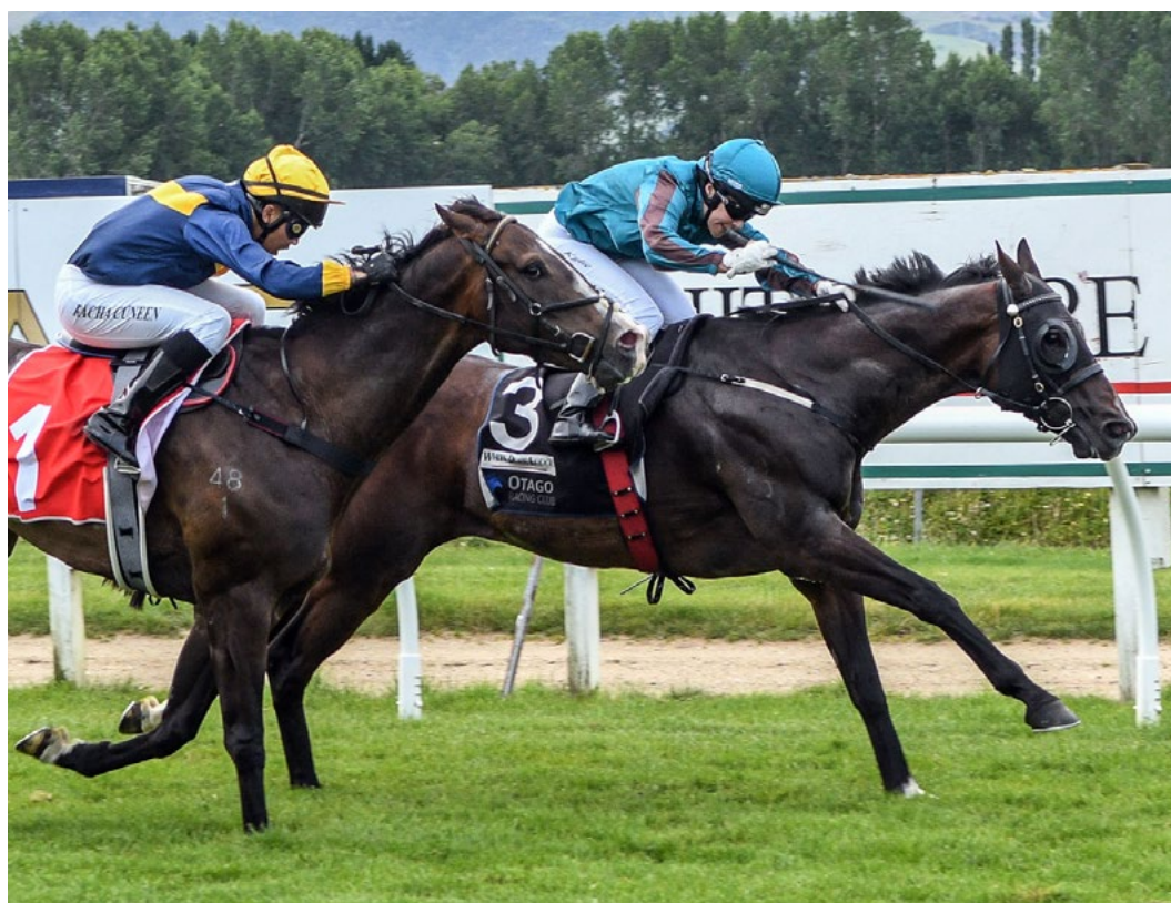
A bold front-running effort pays off as Batman reaches the winning post ahead of his only serious challenger, Signify.