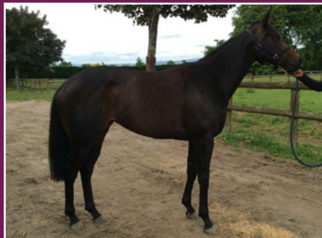
Well-related Encosta de Lago race mare