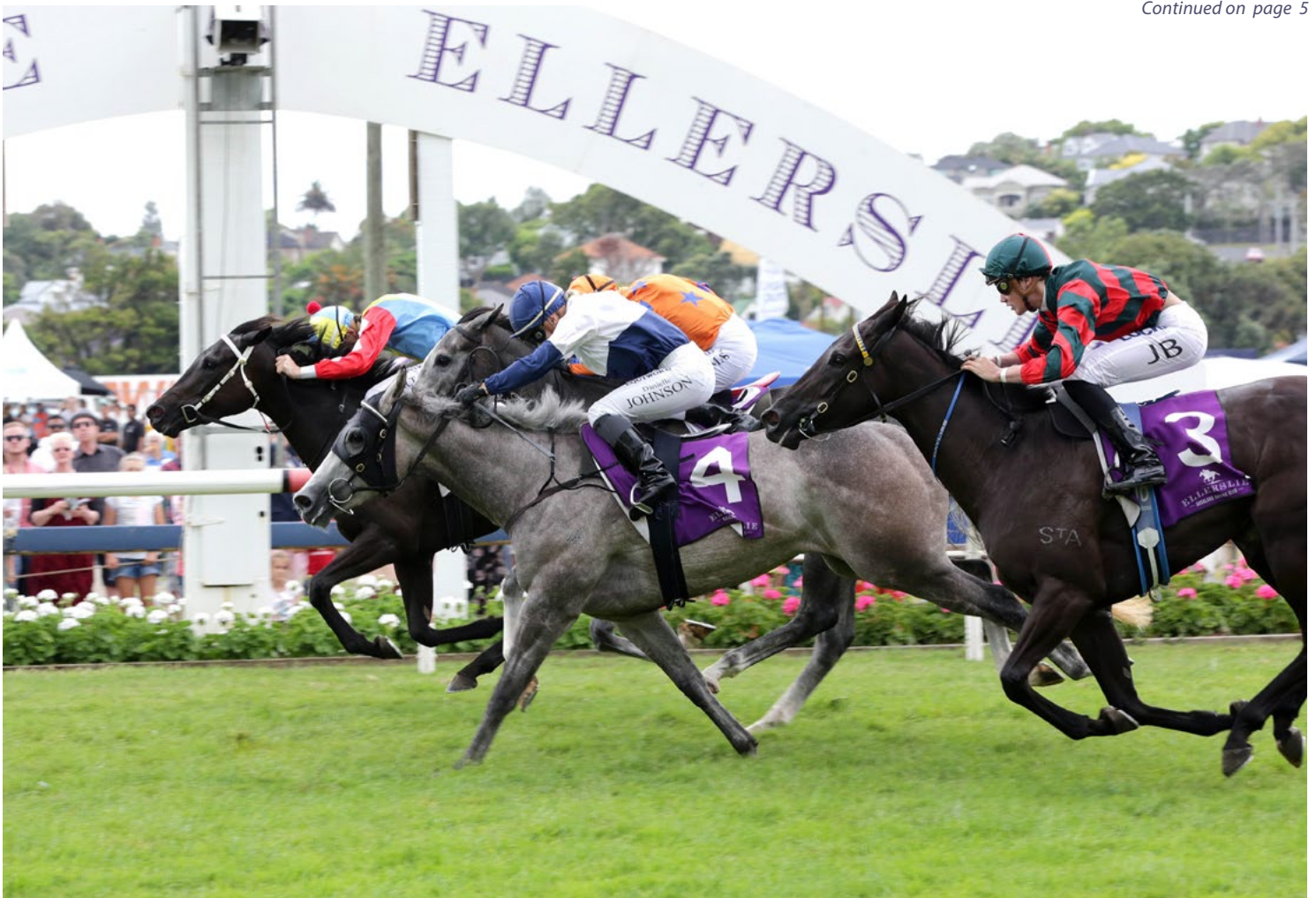
Contessa Vanessa thrusts her head in front at the right time to defeat gallant grey filly Kapoor