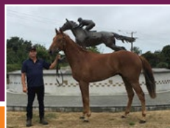
FOR SALE NOW on gavelhouse.com