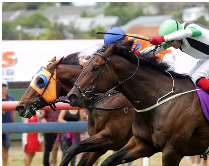
All but obscured, Age Of Fire (tangerine hood) does enough to deny Ever Loyal a win at Ellerslie

"The leader got it soft in front, which was the place to be, so it was a good effort."