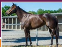
FOR SALE NOW on gavelhouse.com

NZ catalogue online now with 21 Lots on offer - bidding closes 7pm tonight.