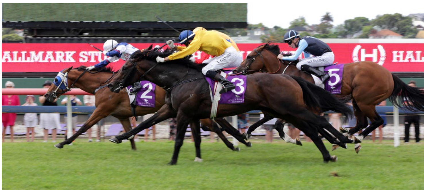
Despite the deceptive angle, Savile Row (yellow colours) arrives in time to deny Passing Shot (inner) victory at Ellerslie

A thrilling finish to the Listed Hallmark Stud Handicap (1200m) saw the Ellerslie judge take an eternity before declaring Savile Row (NZ) (Makfi) the narrowest of winners.