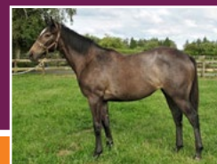
FOR SALE NOW on gavelhouse.com

REGISTER ONLINE NOW TO BID. NEXT NZ SALE ENTRIES DUE 12PM WEDNESDAY 3 JANUARY. FOR ASSISTANCE CONTACT THE TEAM ON: 09 296 4436 | INFO@GAVELHOUSE.COM