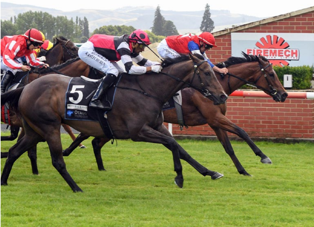
Starvoia (inner) holds out a desperate bid from Timy Tyler to claim stakes success at Wingatui