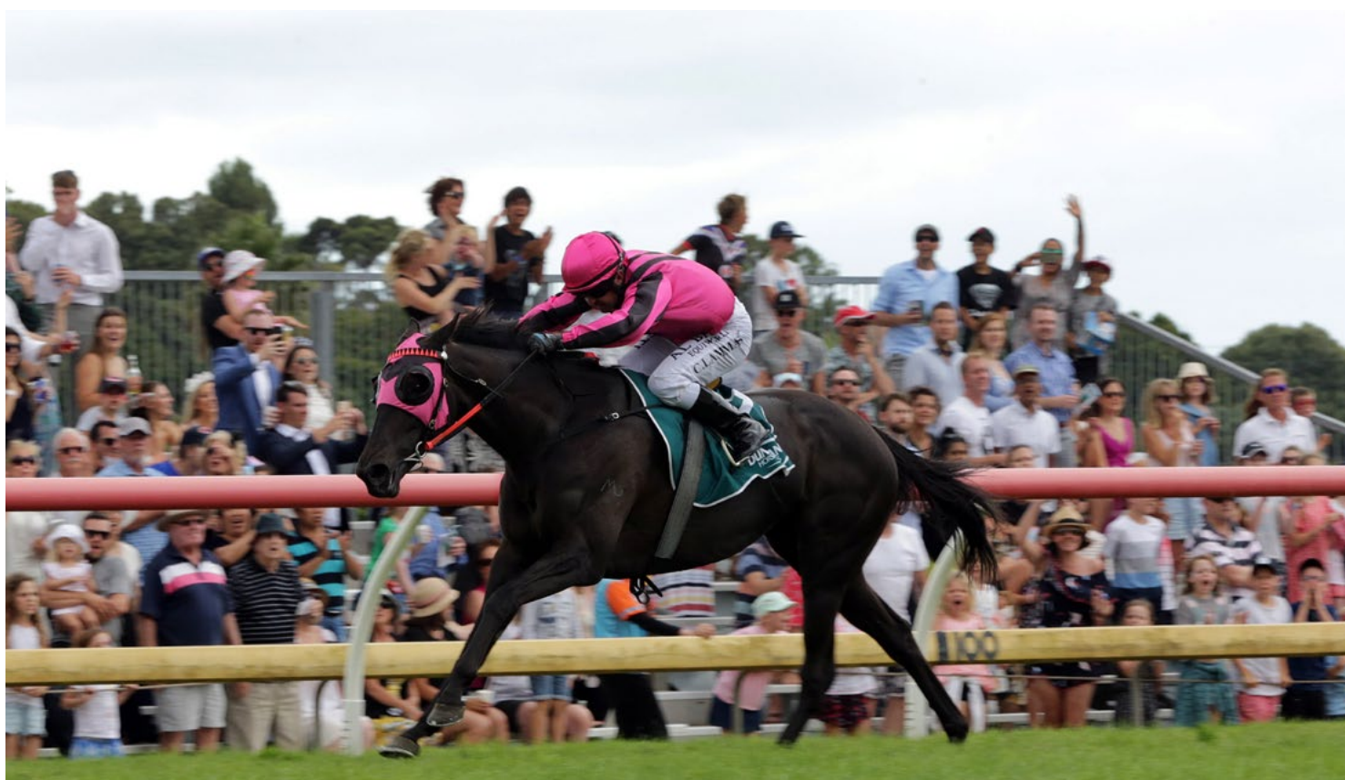
Despite having to endure a wide run throughout, Livin' On A Prayer bolts away at Ellerslie