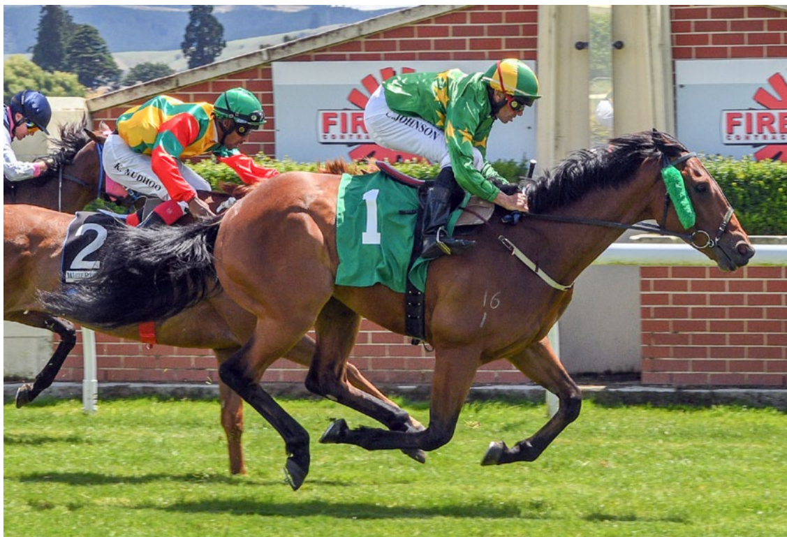
South Island stayer Patrick Erin books a date with the Gr. 3 Wallaceville Estate Wellington Cup (3200m) at Trentham next month