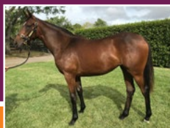
FOR SALE NOW on gavelhouse.com