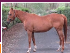
FOR SALE NOW on gavelhouse.com