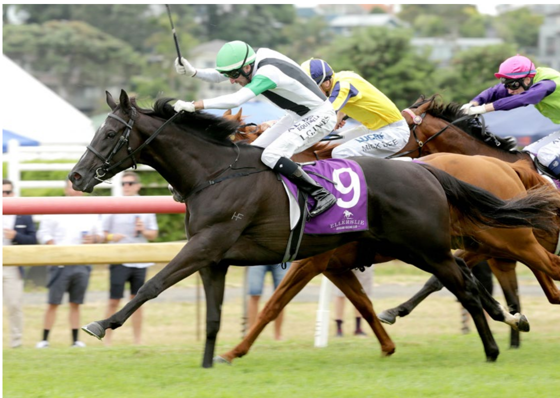
Exciting youngster Stella Noire scores on debut at Ellerslie