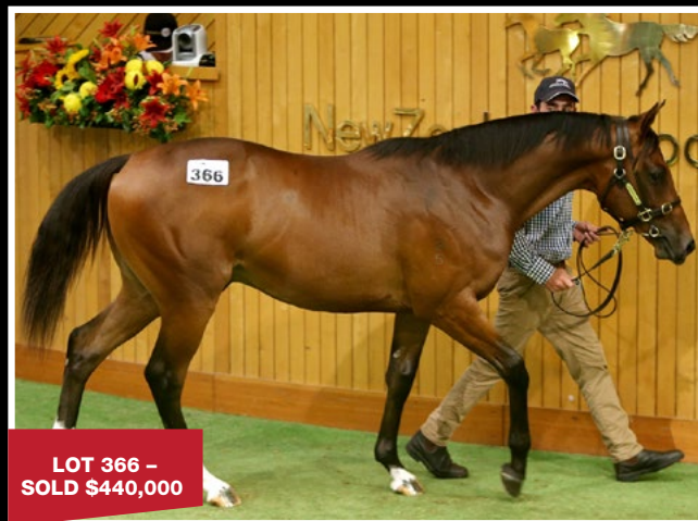
LOT 366 – SOLD $440,000