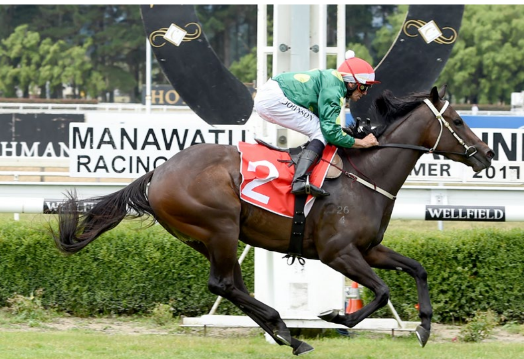
Gift of Power (NZ) (Power) will tackle a Group One assignment after winning at Awapuni