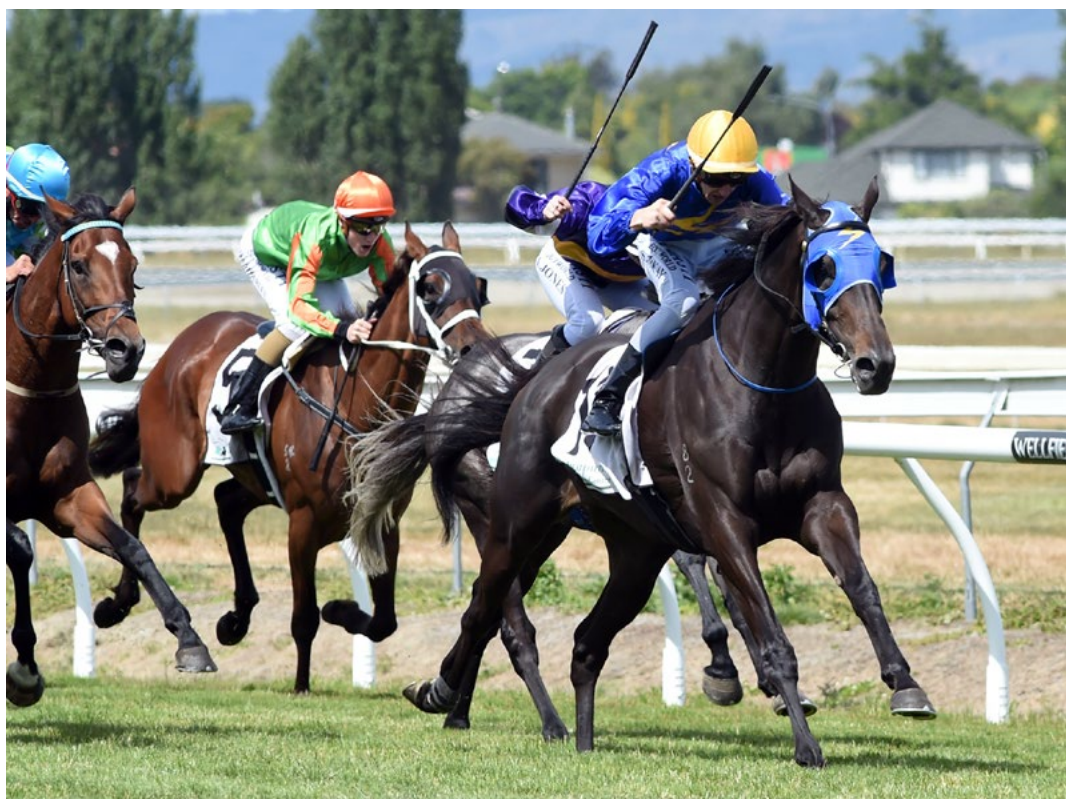
A strong staying performance got Clarify (NZ) (Savabeel) the Gr.3 Hotel Coachman Manawatu Cup