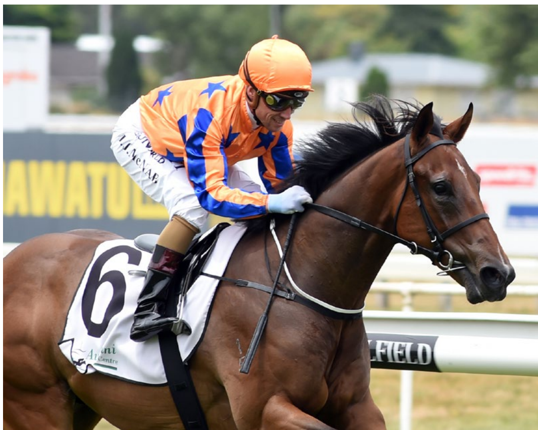
Sword of Osman (NZ) (Savabeel) has put himself in Karaka Million contention with a dominant performance at Awapuni