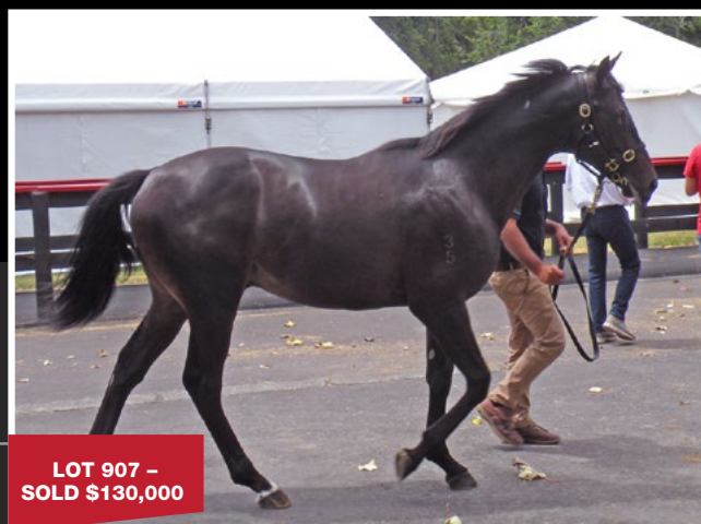
LOT 907 – SOLD $130,000