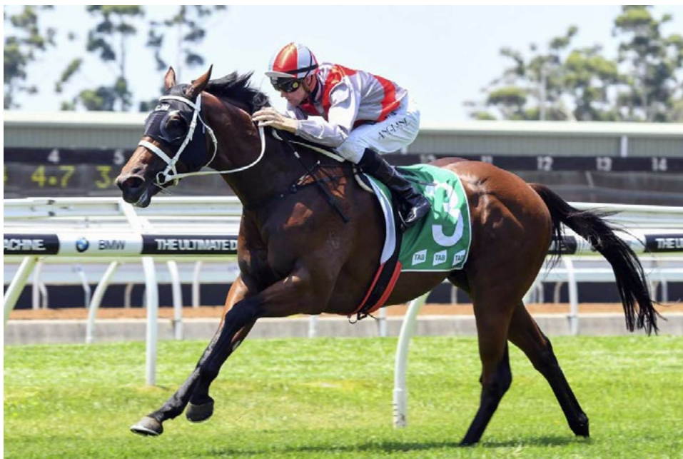
Koru Thoroughbreds NZB draft received a pedigree boost when Scream Park (NZ) (Ocean Park), a half-brother to their Dundee colt entered in the Book 1 sale, won at Warwick Farm

Koru Thoroughbreds will offer a half-brother by Dundee as lot 92 at NZB's Book 1 Sale in January