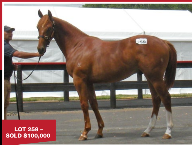
LOT 259 – SOLD $100,000