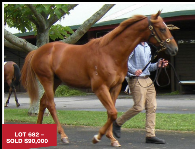
LOT 682 – SOLD $90,000