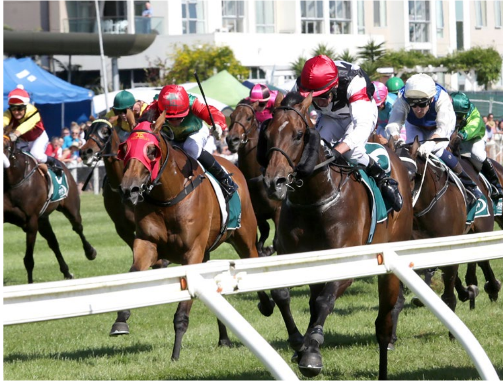
Vinevale (red hood) nabs Ali Baba (inner) at the winning post on Saturday