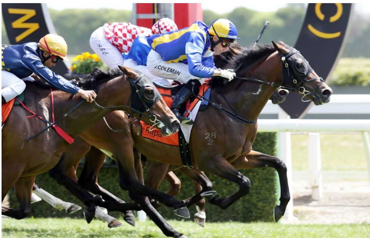
Verdi scores a gritty win at Te Rapa