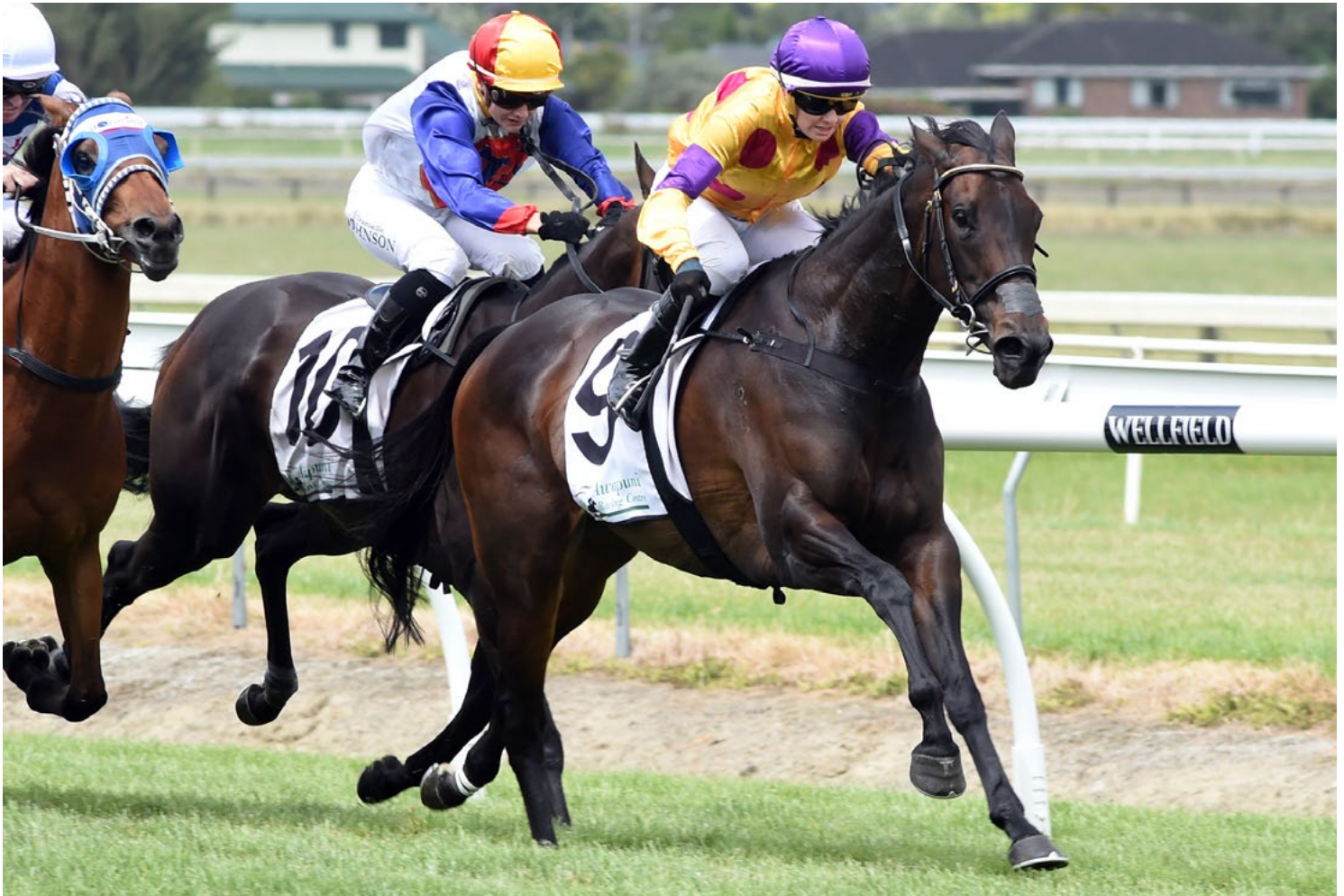
Miss Appleton scores a deserved stakes success at Awapuni