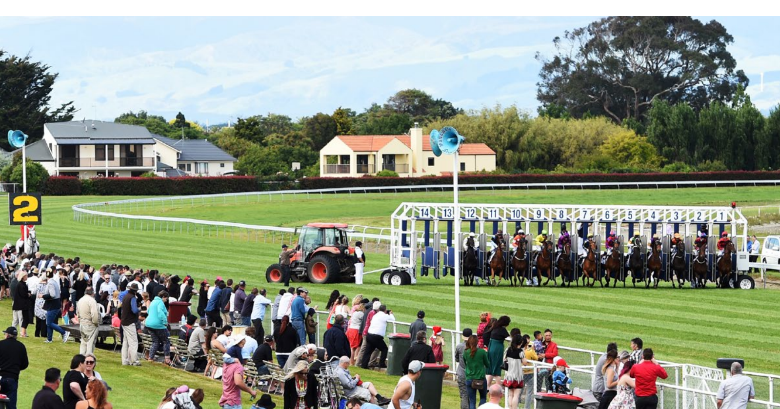
Clear skies, a firm track, competitive fields and a big crowd . . . how Awapuni should look for today's Manawatu Cup meeting.

The running rail at Awapuni will be moved out to the position it was for the opening day of the meeting a week ago.