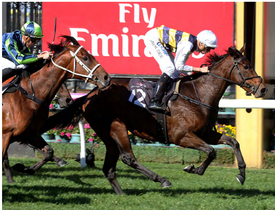
Aloisia in winning form at Flemington during her two-year-old season

“Given the insignificant trace levels found in these oral substances and having regard to advanced testing equipment used by the Australian Racing Forensic Laboratory and the fact that it’s so minuscule it has no effect on the horse’s performance, the Board has introduced the local rule 44A to safeguard the NSW racing industry by allowing fillies and mares to continue to be administered oral altrenogest.”