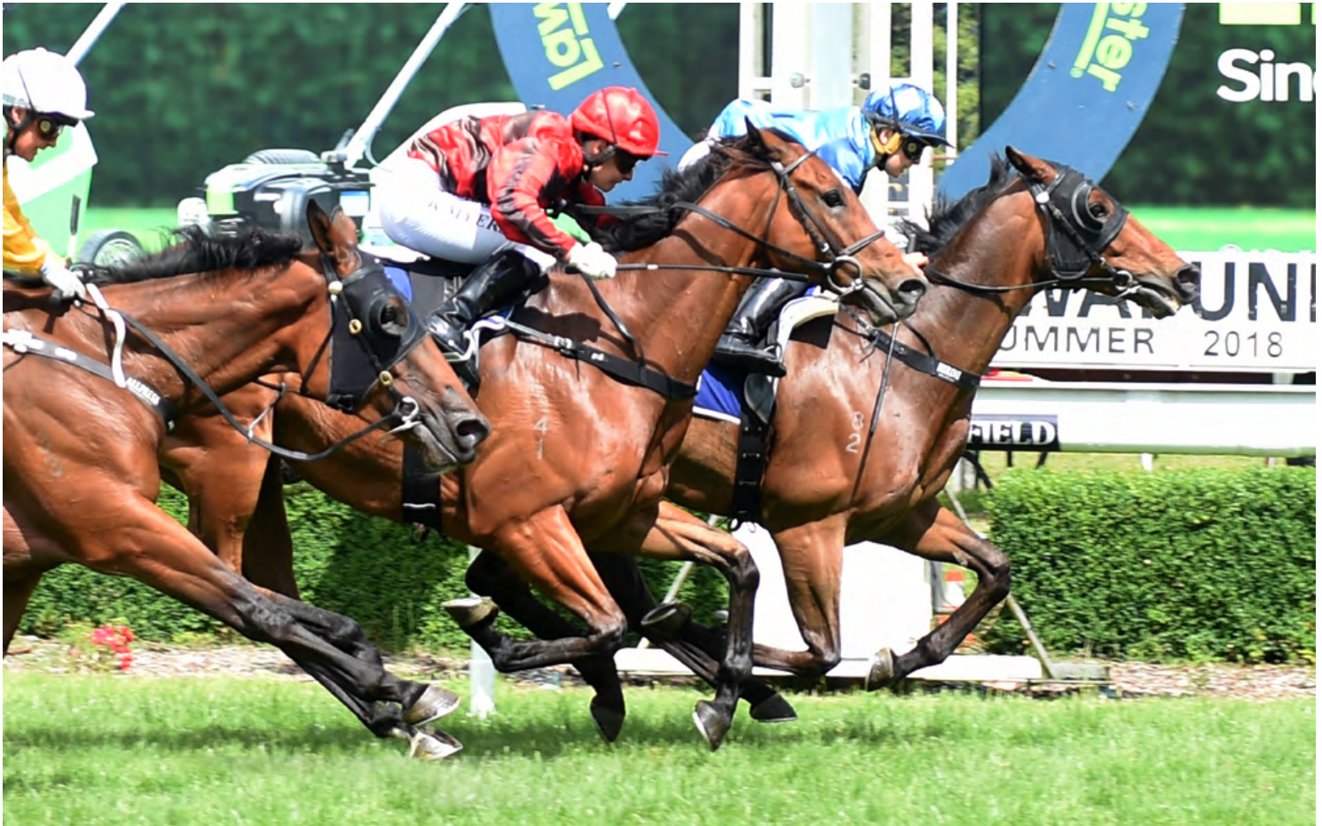
Duplicity (inner) charges to victory at Awapuni

A wapuni trainer Ashley Meadows is looking at the big picture with exciting stayer Duplicity (NZ) (Duporth) which will mean skipping a home track feature this coming weekend.