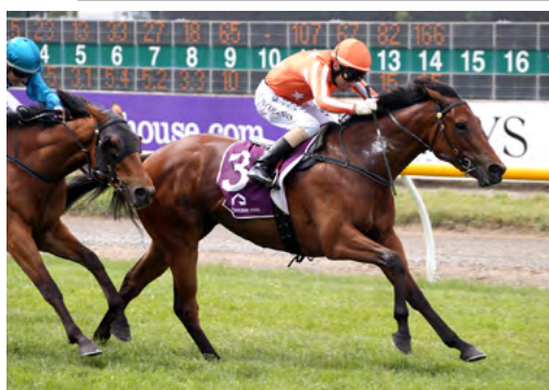
Media Sensation (I Am Invincible)