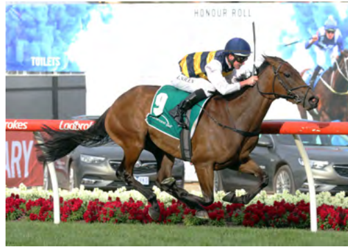
Aloisia (NZ) (Azamour)