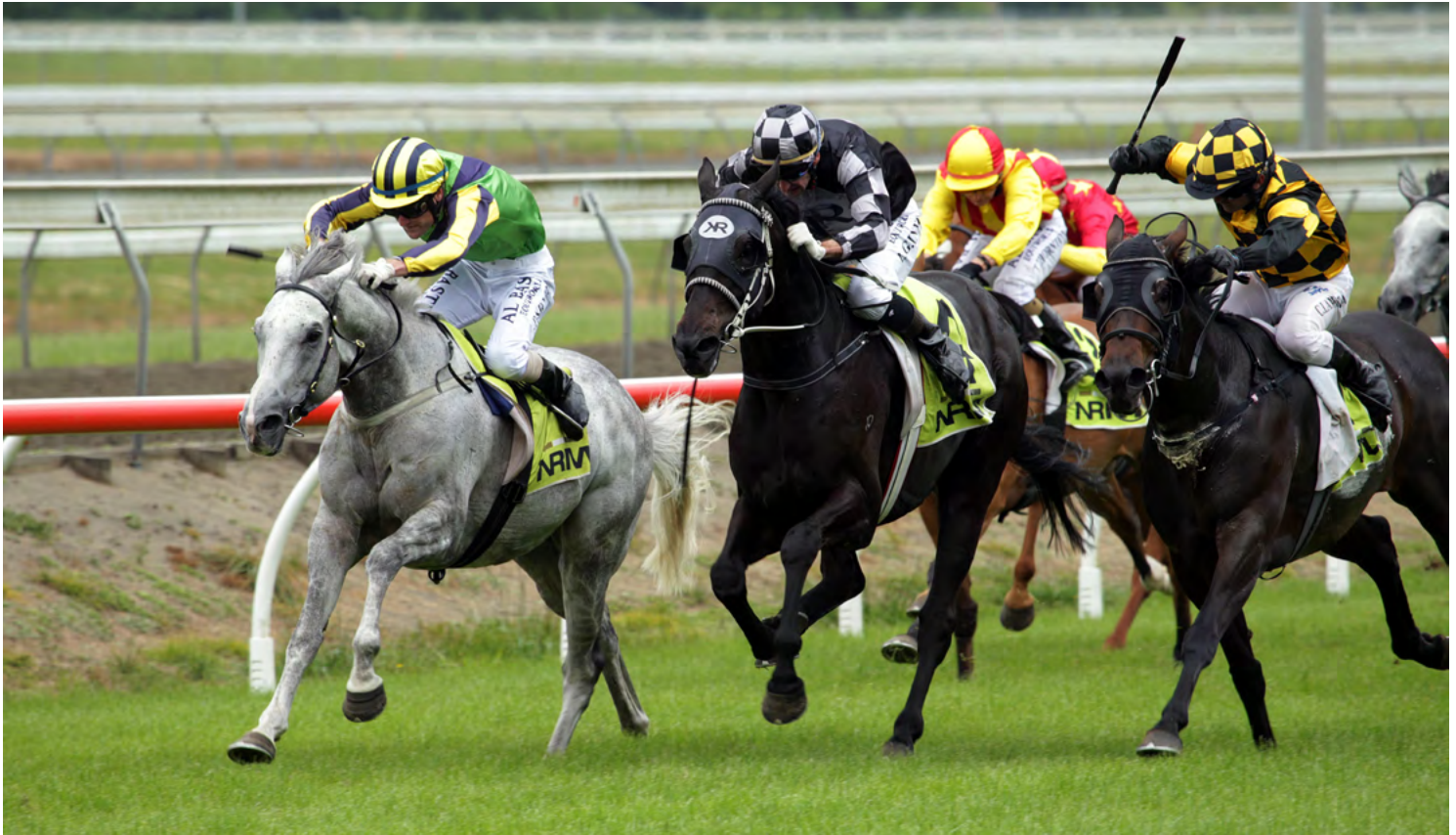
Maygrove looks ready to return to form in the Gr.3 SkyCity Hamilton Waikato Cup on Saturday