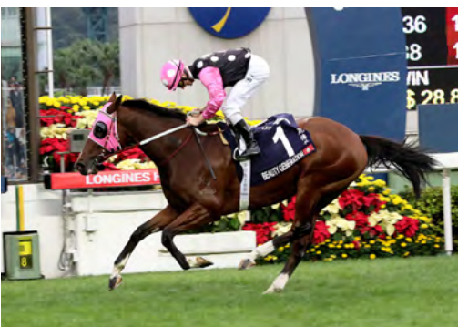
Beauty Generation (NZ) (Road To Rock)