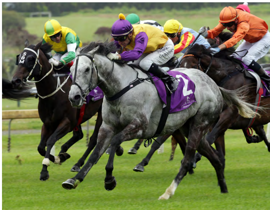
Stratocaster will be looking to continue in a winning vein at Te Rapa tomorrow