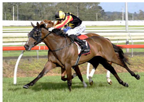
House Of Cartier (Alamosa)