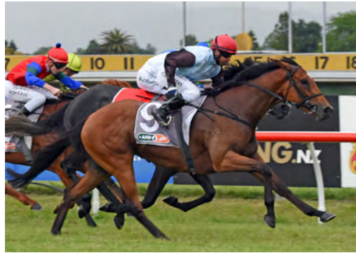
Pinmedown (NZ) (Pins)

"She's still got to learn a bit more to stay,