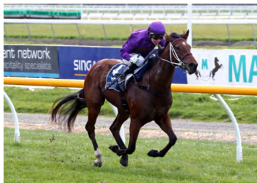
Secret Allure (NZ) (Zacinto)

"We have freshened her up. She's going 1600m up in Sydney. She looks fantastic, but she has the whole way through and she has continued to gallop well at home, so fingers-crossed she translates that onto the track."