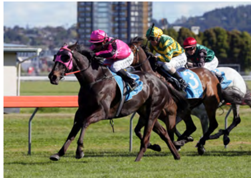
Livin' On A Prayer (NZ) (Redwood)

"She could be an Oaks filly," she said. "She can still get a bit hot and has to work it out mentally, but we'll just place her in some races for three-year-old fillies over Christmas and I think she can pick up something."