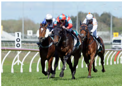
Demonetization (All Too Hard)

Demonetization (All Too Hard), one of last season's standout three-year-olds, has come through his gelding operation well