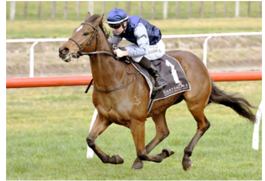
English Gambler (Casino Prince)

"Though they didn't win down there they all went pretty well." Full story here