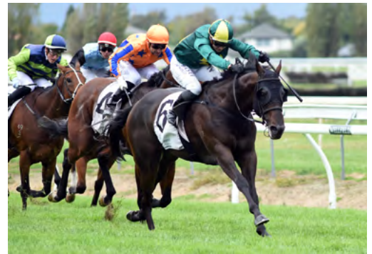
Magnum (NZ) (Per Incanto)