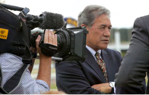
Deputy Prime Minister Winston Peters