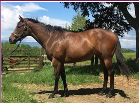
Unreserved Rip Van Winkle filly

Featuring 14 lots including two-year-olds, broodmares with foals at foot, unraced and raced horses.