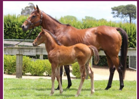
Mare with Jimmy Choux colt at foot

NEXT AUCTION DATES • Accepting listings from Tuesday 13 December • Listings close 7pm Monday 19 December • Catalogue published online 7pm Tuesday 20 December • Bidding from 7pm Tuesday 20 December to close of auction on Wednesday 28 December • Lots close in sequential order from 7pm on Wednesday 28 December.