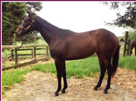
Broken-in He's Remarkable filly