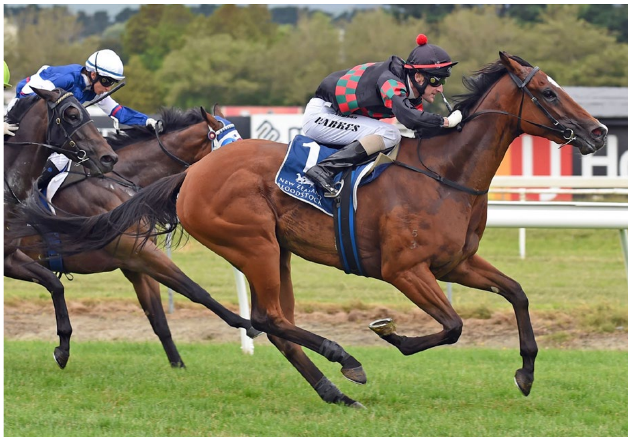
Volpe Veloce runs out a strong 1600 metres to win the Eulogy Stakes and add Group Three black type to her unbeaten record.