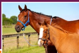
MARE IN FOAL TO TURN ME LOOSE & COLT FOAL