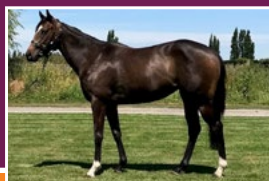
QUALITY ZACINTO FILLY READY TO GO