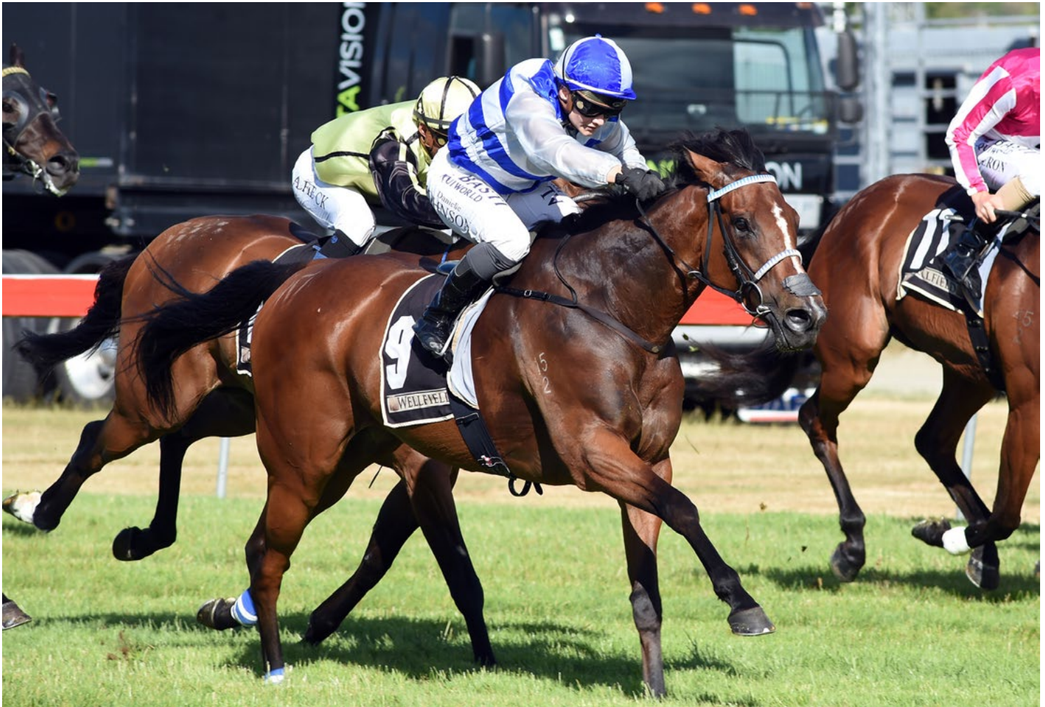
A bizarre pre-race incident didn't deter promising mare Seraphim who made it back-to-back victories on the weekend

Despite being one of the runners most affected by a barrier malfunction prior to the last race at Trentham on Saturday, royally bred northern visitor Seraphim (NZ) (Rip Van Winkle) shook off the pre-race drama to notch another highly impressive victory.