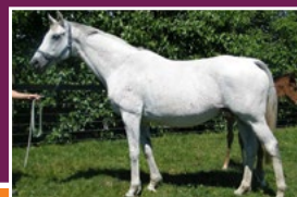
GROUP PLACED MARE & SHOWCASING FOAL