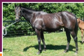
3-IN-1 LOT INCL GR.1 PRODUCER I/F TO IFFRAAJ