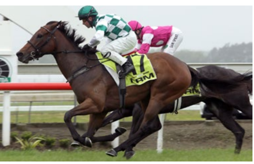
Lasarla (NZ) (Rip Van Winkle)

"She will probably be best when she gets to 1600 metres but the 1300 on Saturday should suit her at this stage of her campaign."