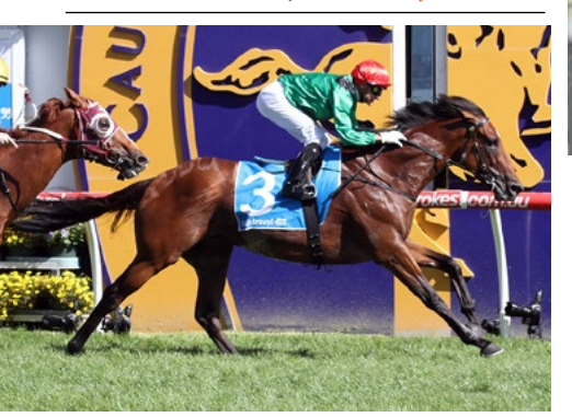
Turn Me Loose (NZ) (Iffraaj)

"At this stage, we're now looking at going up for the Marton Cup or the Trentham Stakes before the cup." Full story here.