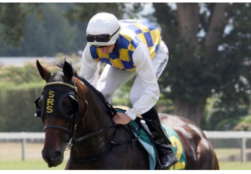
Fanatic (NZ) (Shocking)

Also in the field is Flame Hero (NZ) (Savabeel) who was a last start second in the HK-Gr.2 Longines Jockey Club Cup.