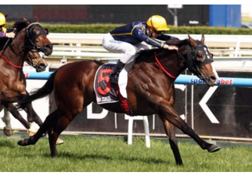
Bass Strait (NZ) (Holy Roman Emperor)

"Her leg just blew up - there was swelling and soreness - it was a pretty painful thing to happen to her. She lost a lot of weight, about 25 kilos." Full story here.