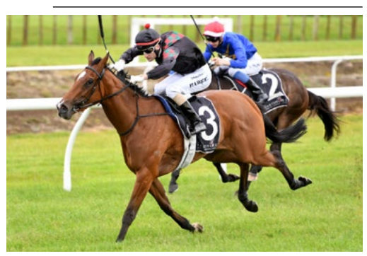
Volpe Veloce (Foxwedge)

She will be at much shorter odds when she steps up to her favourite distance in the Gr.3 Skycity Hamilton Waikato Cup at Te Rapa on Saturday. Full story here.