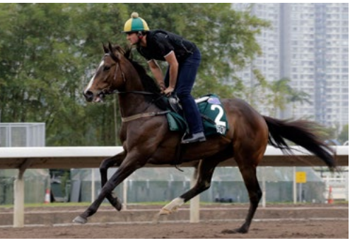
Benzini (Tale Of The Cat)

New Zealand bred gallopers Amazing Kids (NZ) (Falkirk) and Super Jockey (NZ) (Sandtrap) will also contest the Sprint, while Packing Pins (NZ) (Pins) will run in the HK-Gr.1 Hong Kong Mile.