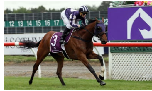
Bloodstream (NZ) (Duelled)

"We might back off a bit now and freshen him and look toward the Waikato and Avondale Guineas on the way through to the Derby."