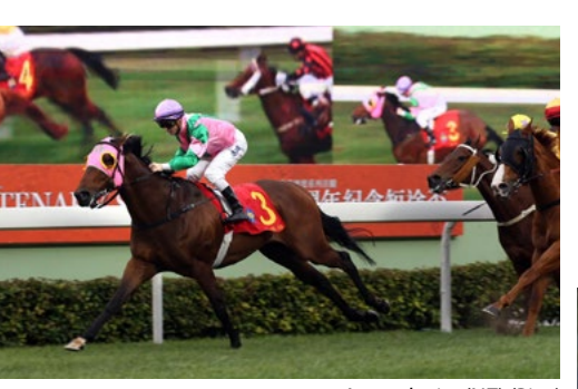
Aerovelocity (NZ) (Pins)