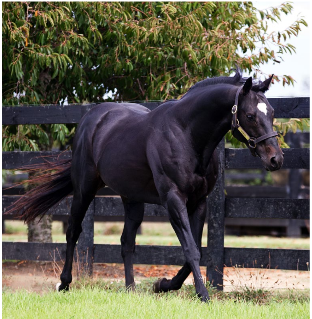
Westbury Stud resident stallion Redwood