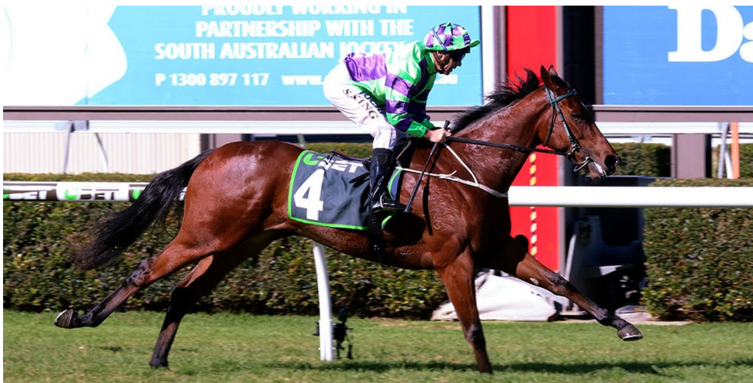
Smart filly I Am A Star in winning action

The $3 million Doncaster Mile is among the many big-race options for Group One-winning filly I Am A Star (NZ) (I Am Invincible) who is about to return to stable life.