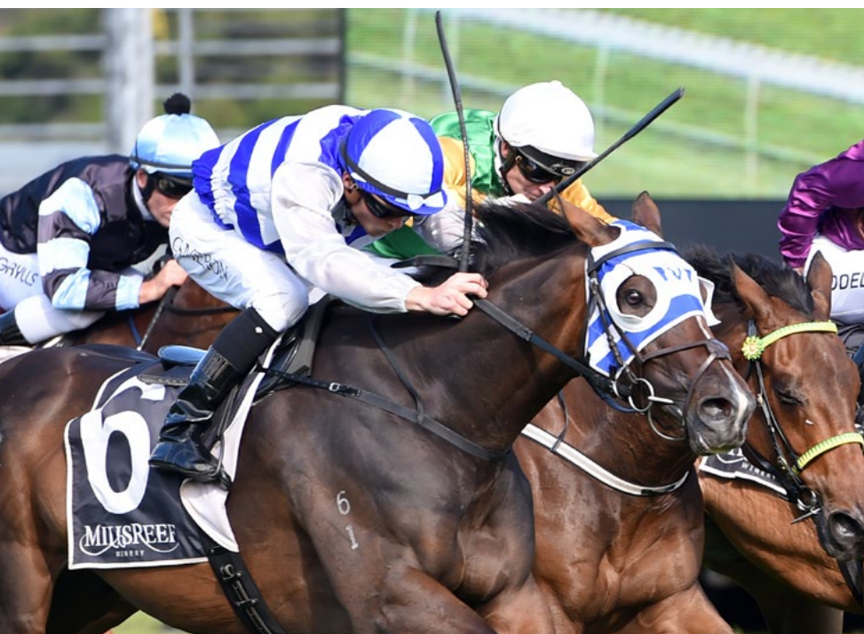
Blueblood mare Echezeaux scores in a driving finish at Trentham