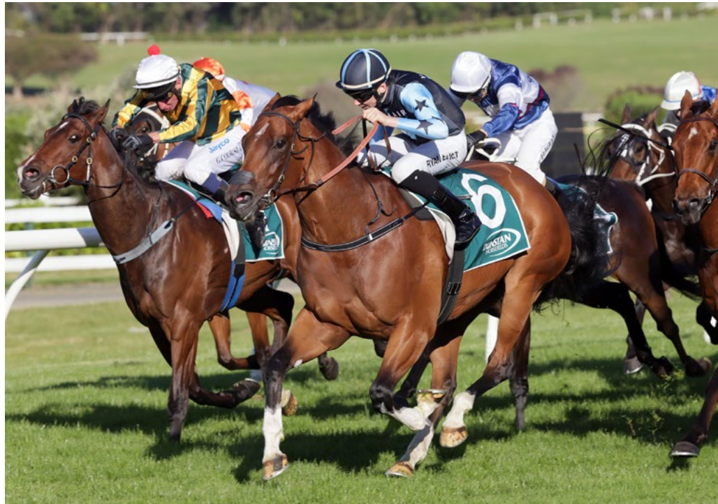
Progressive mare Volks Lightning could return to Ellerslie for the Gr. 1 Sistema Railway next month

That opportunity could come around on New Year's Day with the mare nominated for the Gr. 1 Sistema Railway although Rogerson acknowledged she would need to