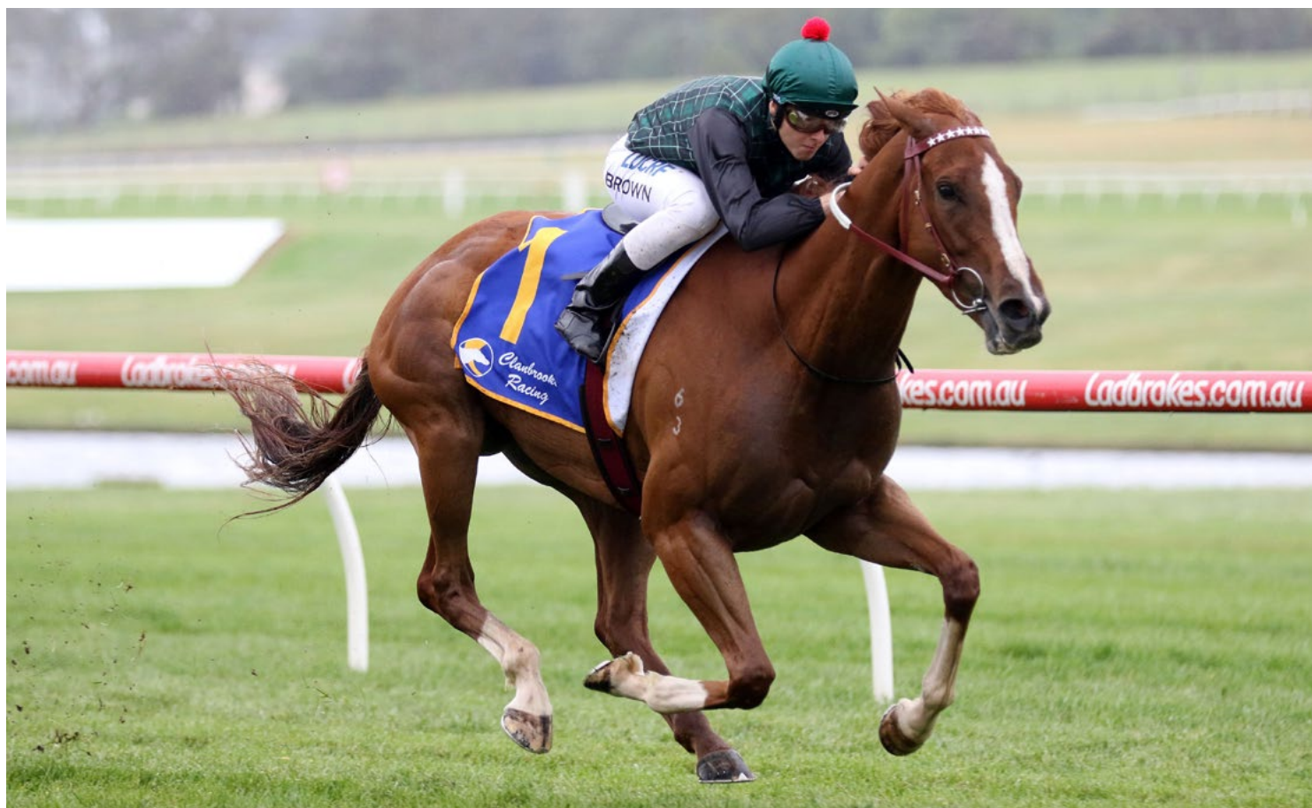
The solidly built mare Mrs Gardenia has no trouble carrying topweight to victory in the Benchmark 84 mile at yesterday's Sandown meeting.