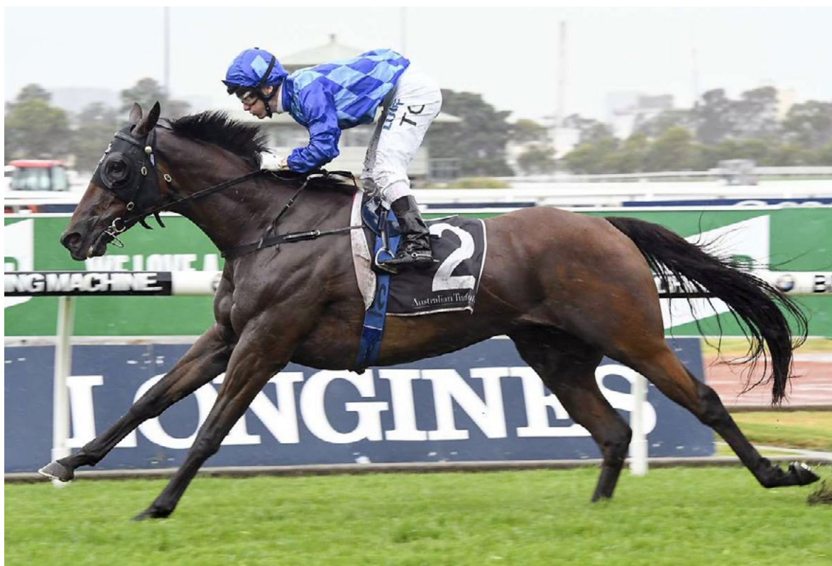
The opposition are well astern as Broadside cruises home in yesterday's ATC Cup at Rosehill.