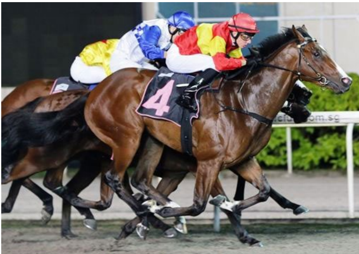
Be Bee takes his record to three wins from four starts with a fresh-up success at Kranji on Friday night.