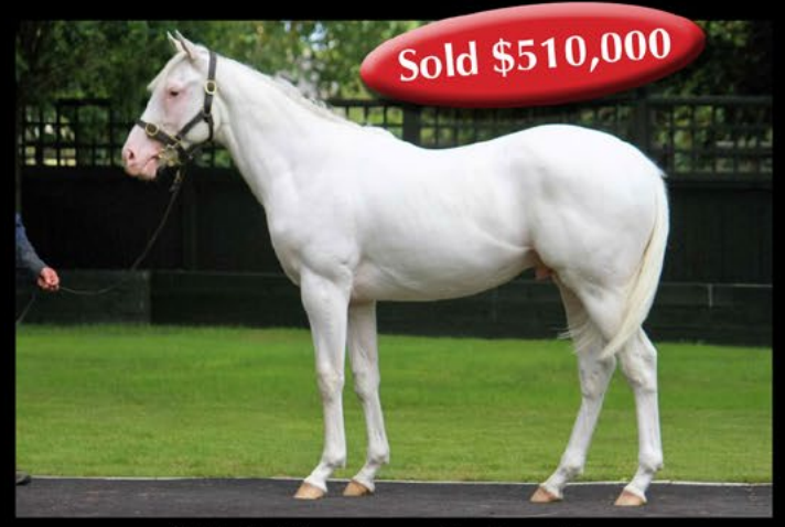
White Colt ShamExpress - The Opera House