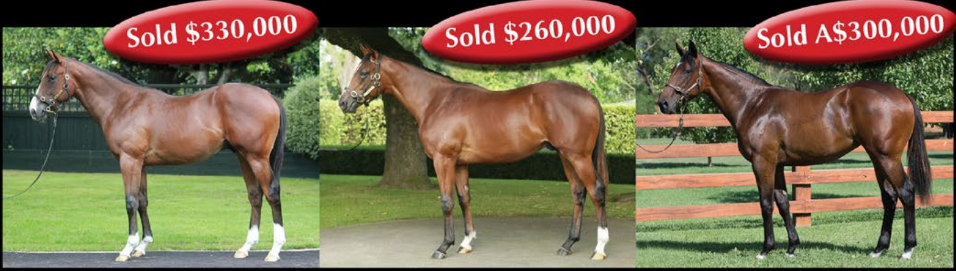
Bay Colt ShamExpress - Polish Princess