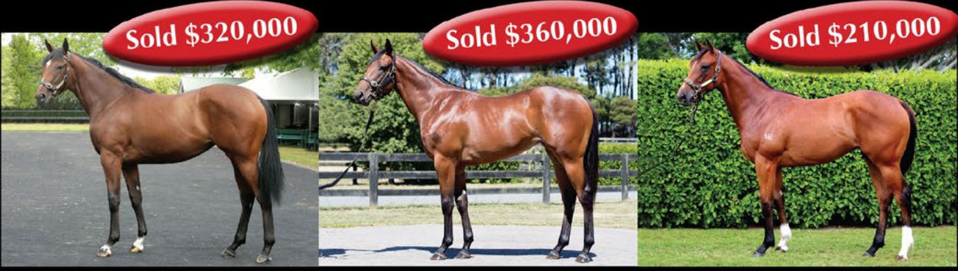
Bay Filly ShamExpress - Crystalthecowgirl