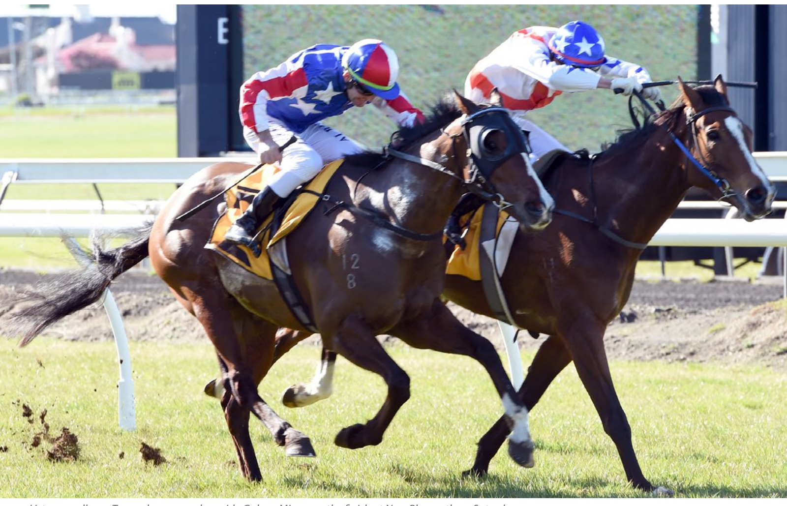
Veteran galloper Taurus looms up alongside Galaxy Miss near the finish at New Plymouth on Saturday

eteran galloper Taurus (NZ) (No Excuse Needed) showed there was still plenty of fight left in the old dog when he thrust his nose in front at just the right moment to snatch victory in the open sprint at New Plymouth on the weekend.