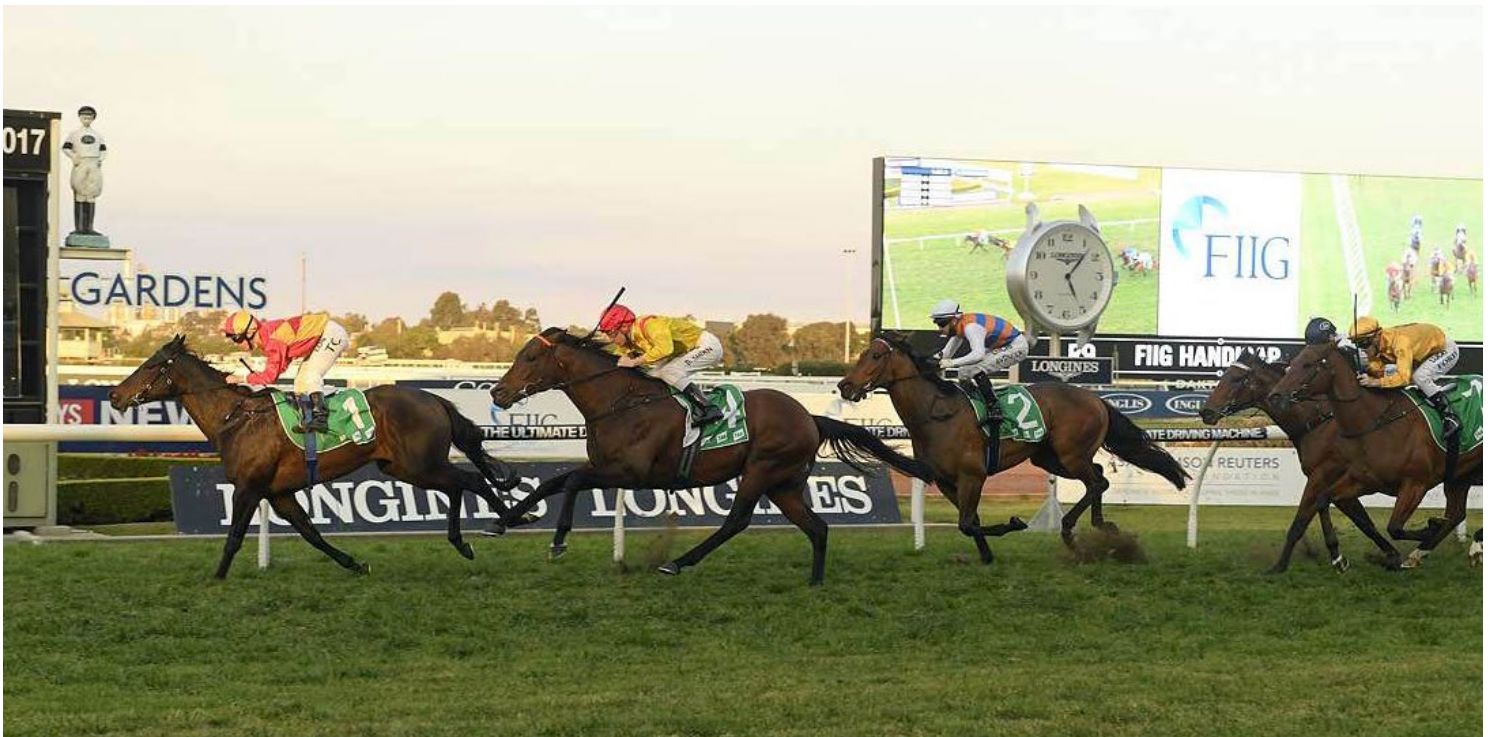
Despite being topweight and lacking recent racing, Bonny O'Reilly has no trouble beating the Benchmark 95 sprinters at Rosehill.