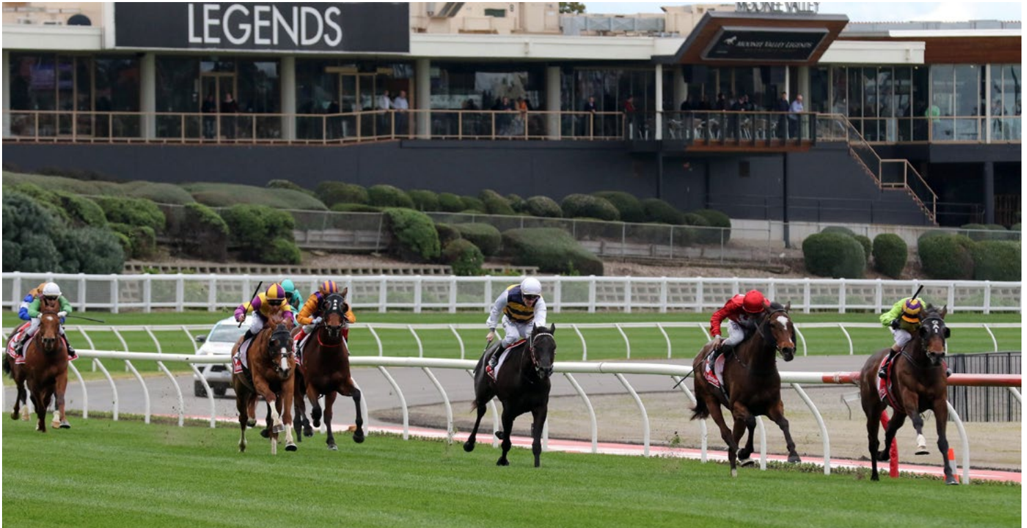
Cismontane has them strung out in the Moonee Valley home straight.