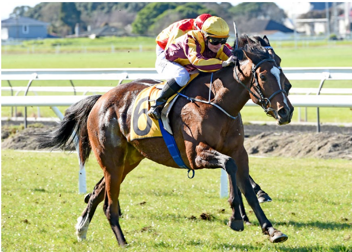
Carrying the King Country colours worn in his provincial matches by legendary All Black and racing identity the late Sir Colin Meads, Mangaroa Flo Jo races to a fitting win in yesterday's Interprovincial Challenge at New Plymouth.

"She always goes well fresh but she'll be better in her