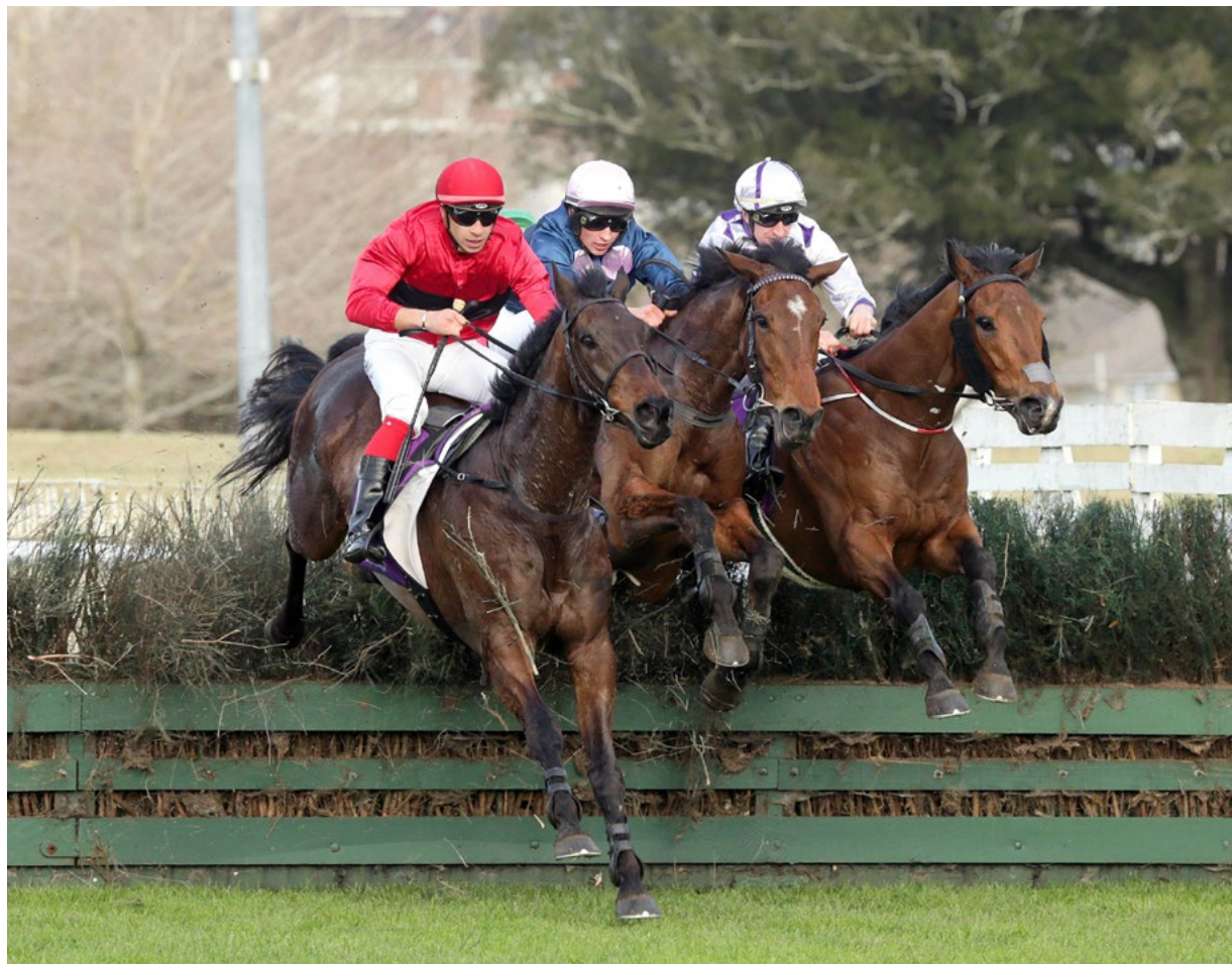
At the last fence in yesterday’s Pakuranga Hunt Cup . . . Amanood Lad lands marginally in front of Tizza Secret (centre) and Ngatira Gold with Wise Men Say obscured behind them.

However, last month’s Wellington Steeplechase winner revelled in his