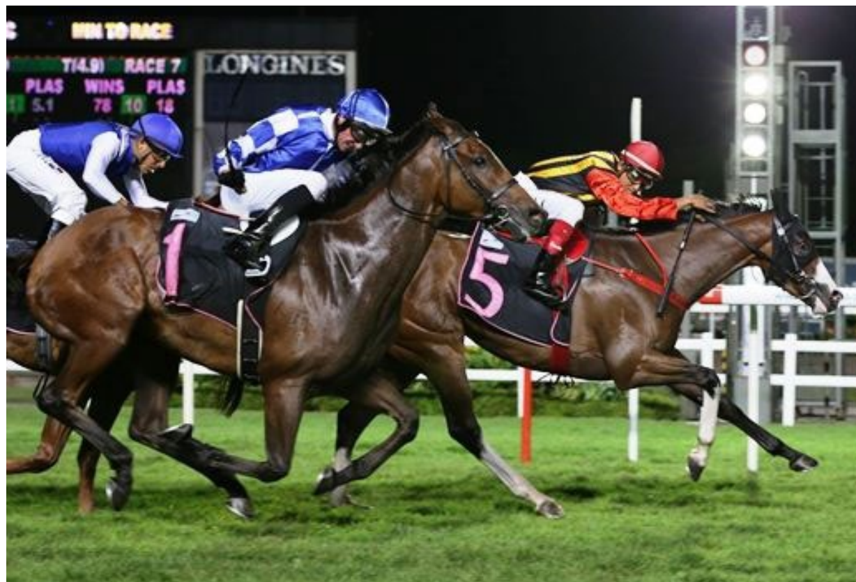
Eclipse Splash (#5) has enough in hand to hold out the late charge of favourite Chopin's Fantaisie.