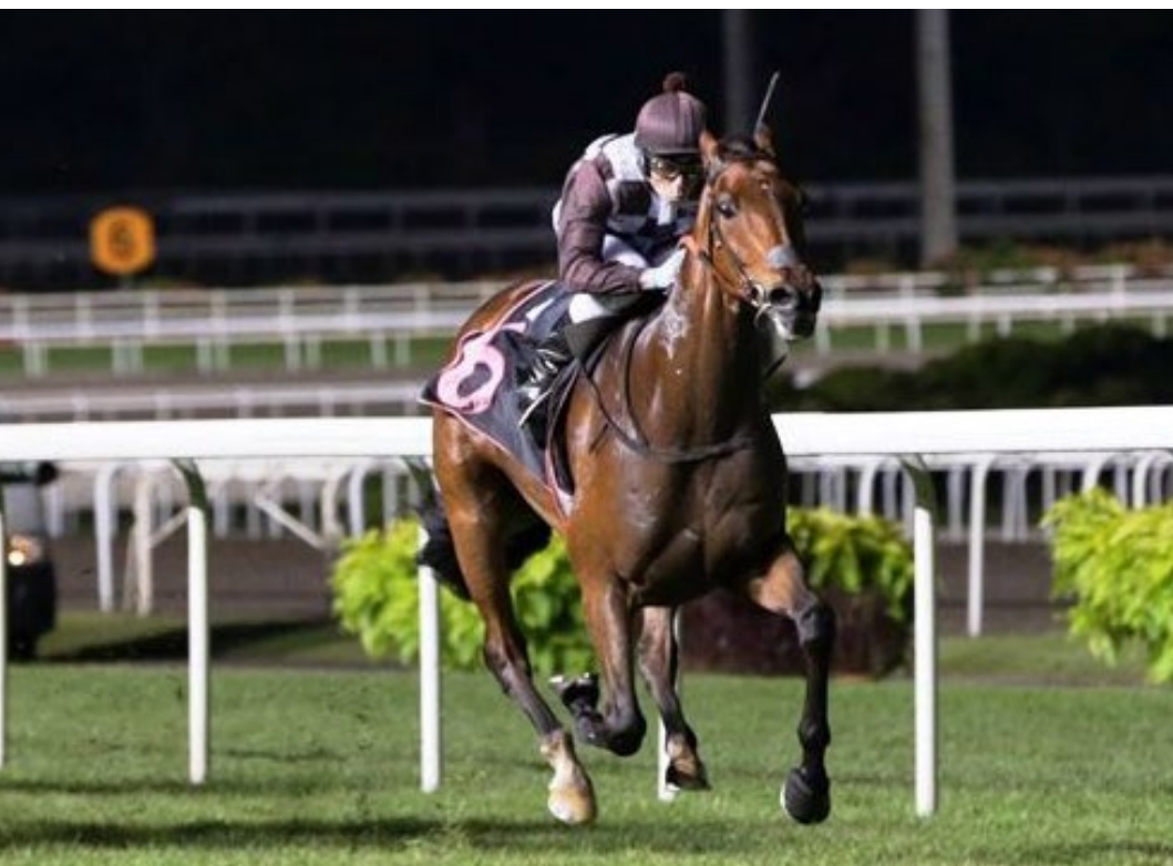
Mr Fatkid in no danger at Kranji on Friday night.