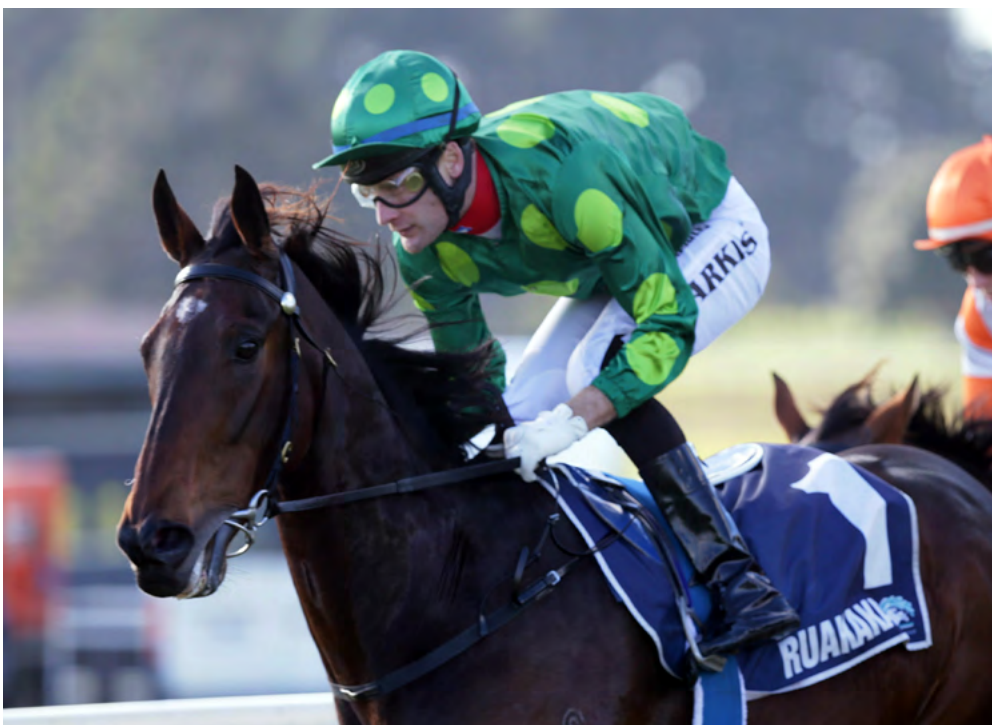
Hiflyer is on target for this weekend's first Group One of the season, the Tarzino Trophy at Hastings