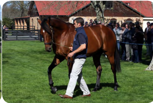
Turn Me Loose