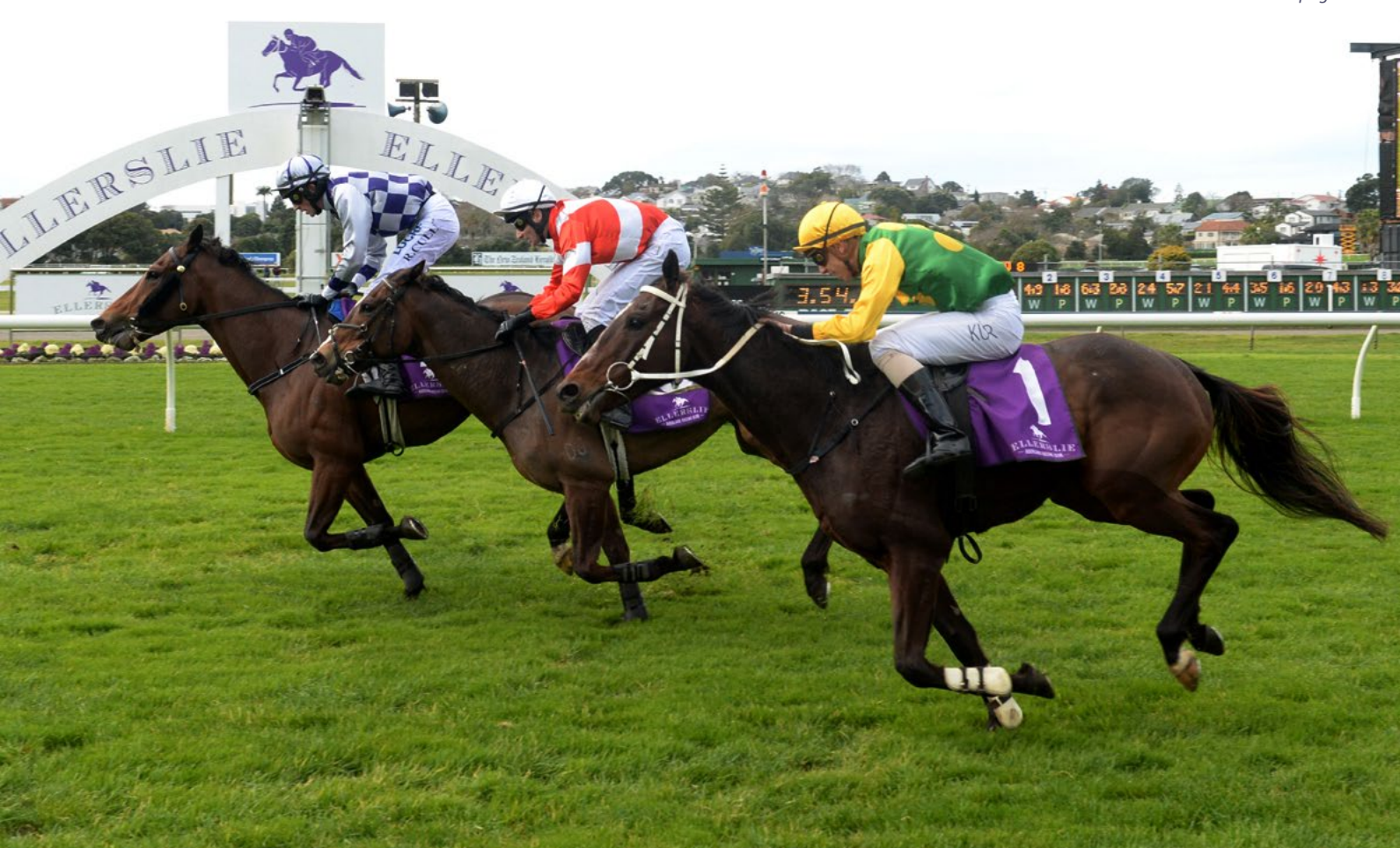
Ngatira Gold gets to the line first but has come well wide of the rails position he'd held on straightening and generally maintained to the final flight. There were no surprises when the placings were altered, with Nancho Lass (centre) and Just Got Home (#1) both being promoted.