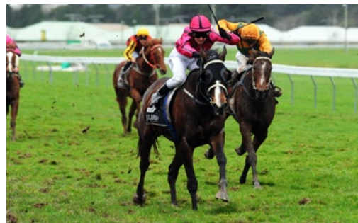
Matost (NZ) (Keeper)