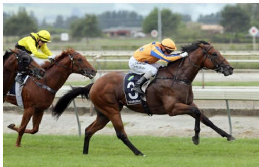
Heroic Valour (Fastnet Rock)

(NZ) and Ugo Foscolo (NZ), with the latter favourite for the Gr.1 Sothys New Zealand 2000 Guineas.