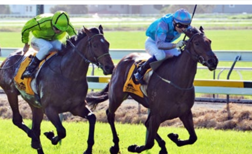
Hello M'Lady (NZ) (Shocking)