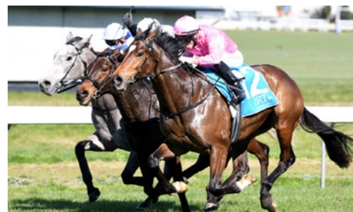
Highlad (High Chaparral)

Iffraaj's other leading performers include New Zealand's Champion Sprinter and Champion Middle Distance galloper Turn Me Loose (NZ).