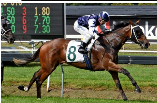
Humidor (NZ) (Teofilo)

"He won't race again before the Northern and he'll be doing a lot of work at the beach."