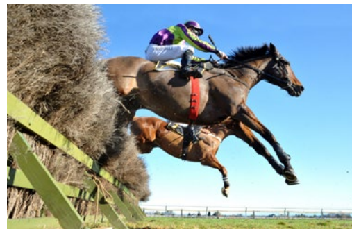
Infantry (NZ) (Tavistock)