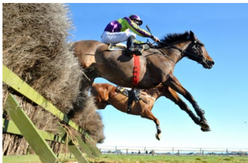
Mr Mor (NZ) (Corrupt)

The Wanganui jumper has arrived home from his latest trip to Christchurch in such good order that his trainers have now confirmed a second tilt at the Meadow Fresh Great Northern Steeplechase on September 3.