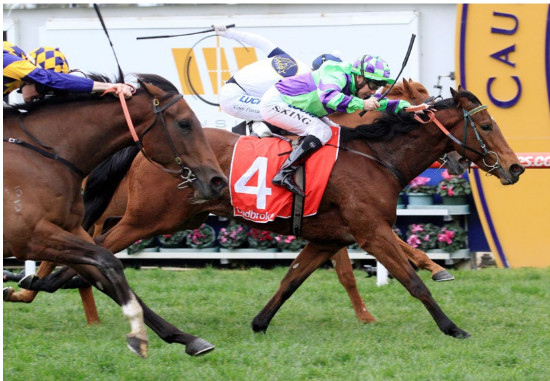
I Am A Star (#4) dashes through late to snatch a Group Three win against her fellow three-year-old fillies in Caulfield's Quezette Stakes.