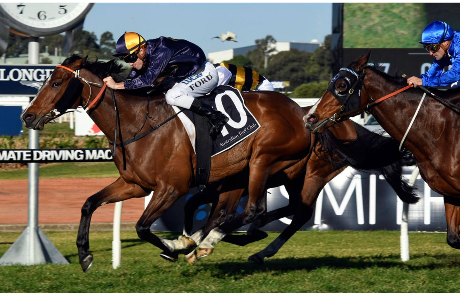
Kingsguard, wearing the familiar Windsor Park Stud colours, scores at Rosehill

Former kiwi galloper Kingsguard (NZ) (Rip Van Winkle) upset the applecart when he scored over 1400 metres at Rosehill on Saturday.