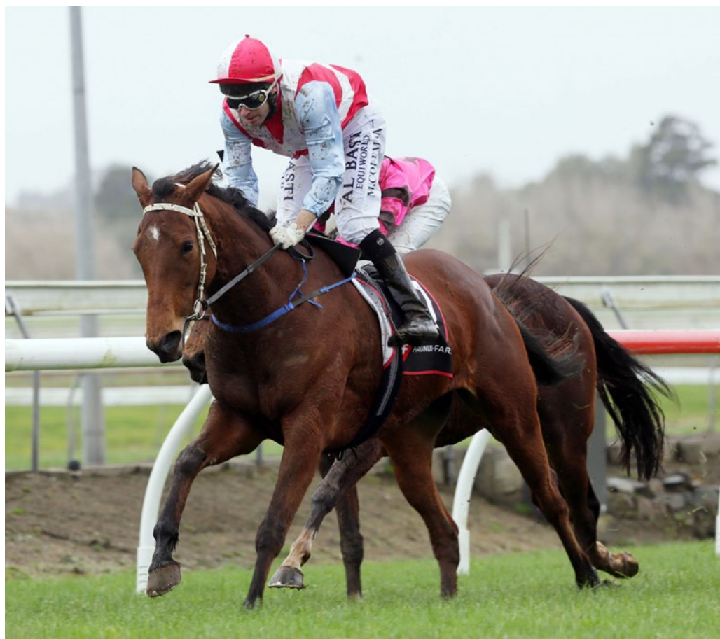
Rugged mare Catarina made it back-to-back victories in fine style on the weekend