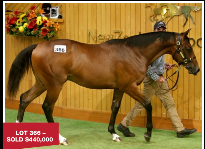
LOT 366 – SOLD $440,000