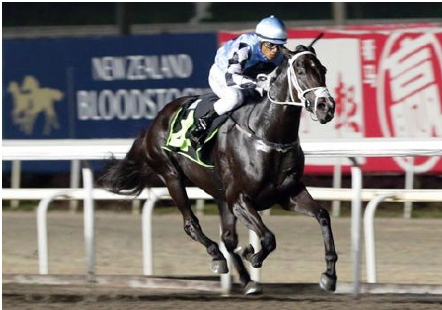
Mighty Conqueror flies in.

A mentally and physically stronger Mighty Conqueror (NZ) (Patapan) was seen in full flight when winning the $580,000 Class 3 over 1000 metres at Kranji on Friday.