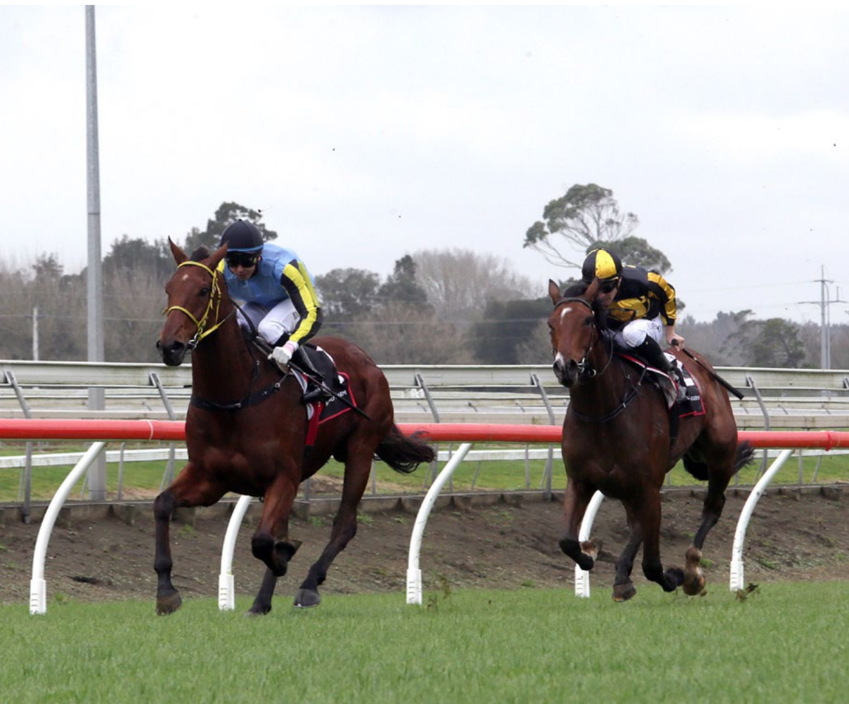
On a murky day at Pukekohe, Admiral completes his all-the-way win over Bowie in the Rating 85 1600.

Admiral will now be set for the defence of his Listed Karaka Classic title at Pukekohe on September 24.