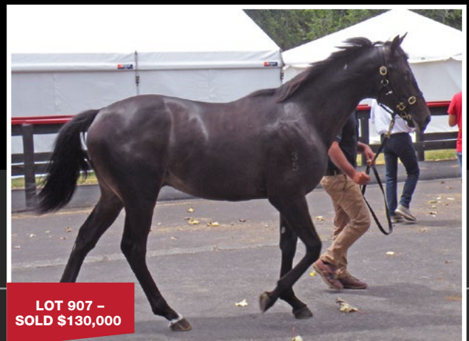
LOT 907 – SOLD $130,000