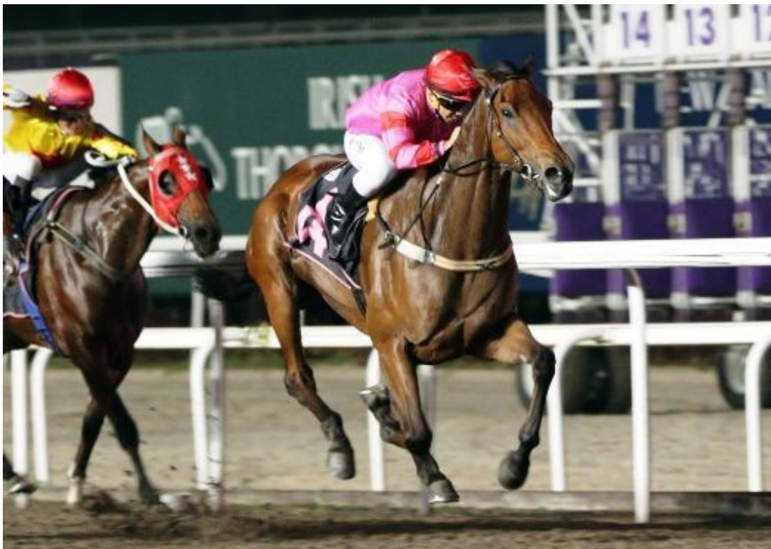
The classy Predator in the clear at Kranji.

"He had a light weight plus Poon's two kilos that shaved it