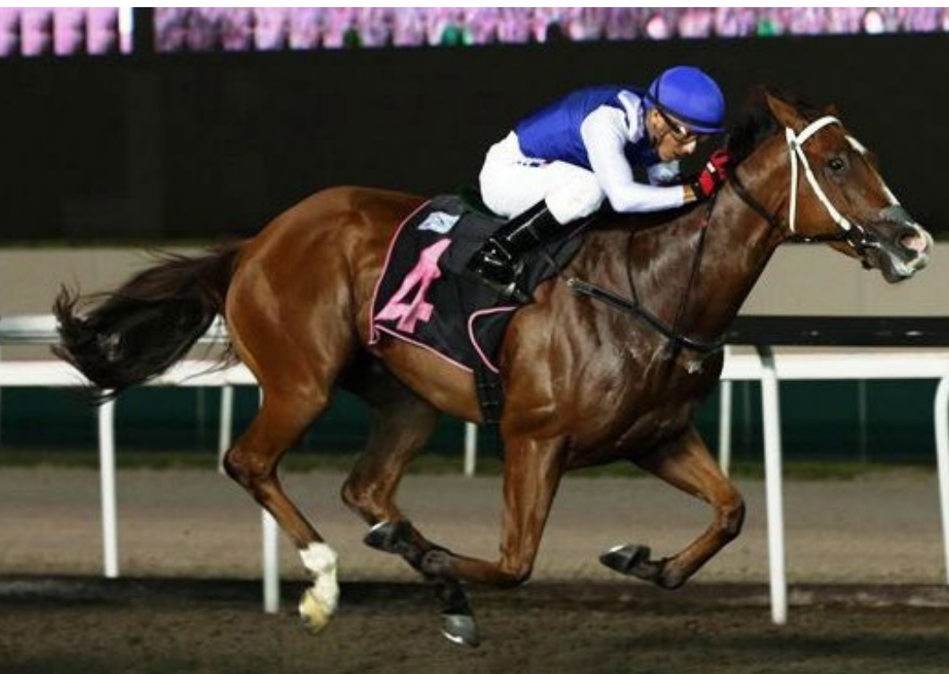
Ettijah close to home and in no danger.