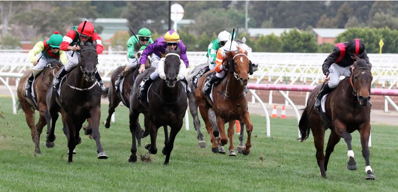
Swampland (black and red colours) strides away from the opposition in the mares 1400 at Flemington.