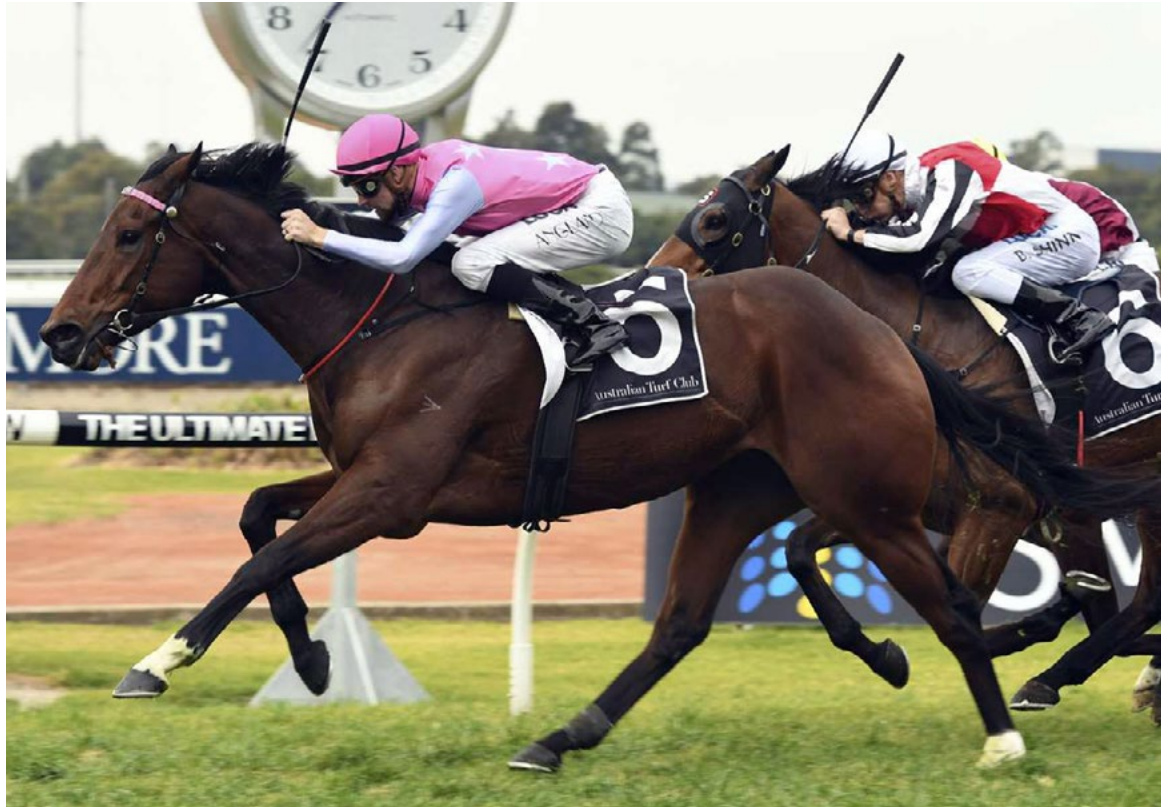
King Viv powers home at Rosehill.

“It was a good win. The tempo was comfortable and it allowed him to be on the bridle,” he said. “They didn’t dash home and just rolled through the gears nice. He was strong