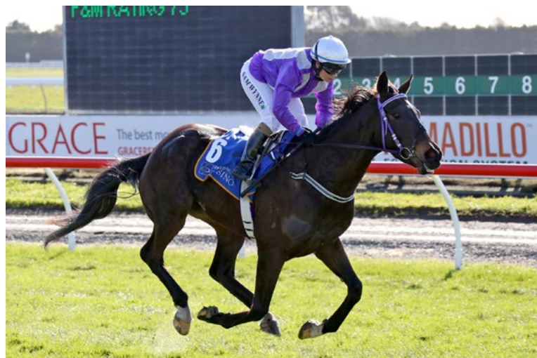
Miss Three Stars... bowed out at Riccarton.

"She deserves a good retirement and the owners are doing the right thing by her," she said.