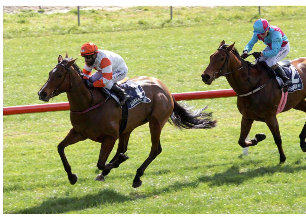
Hello It's Me kicks off a new campaign with a win at Ruakaka