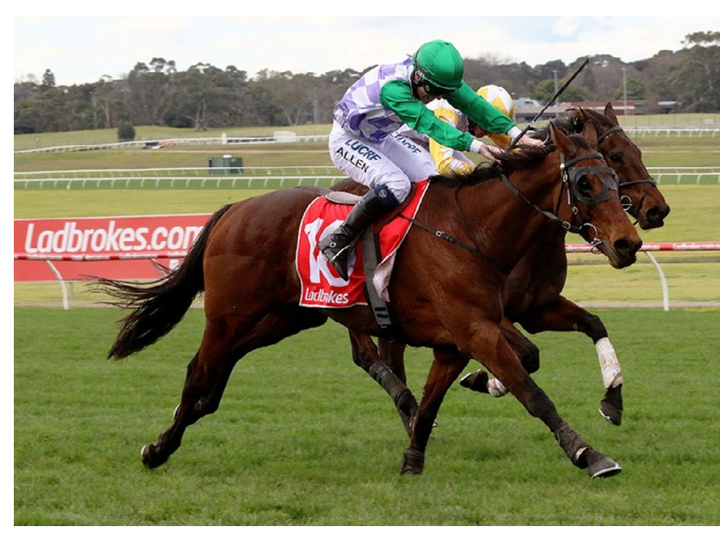
I'll'ava'alf (outer) gains the upper hand as he wins an action packed Crisp Steeplechase at Sandown

was touch and go whether the gelding lined up on Sunday.