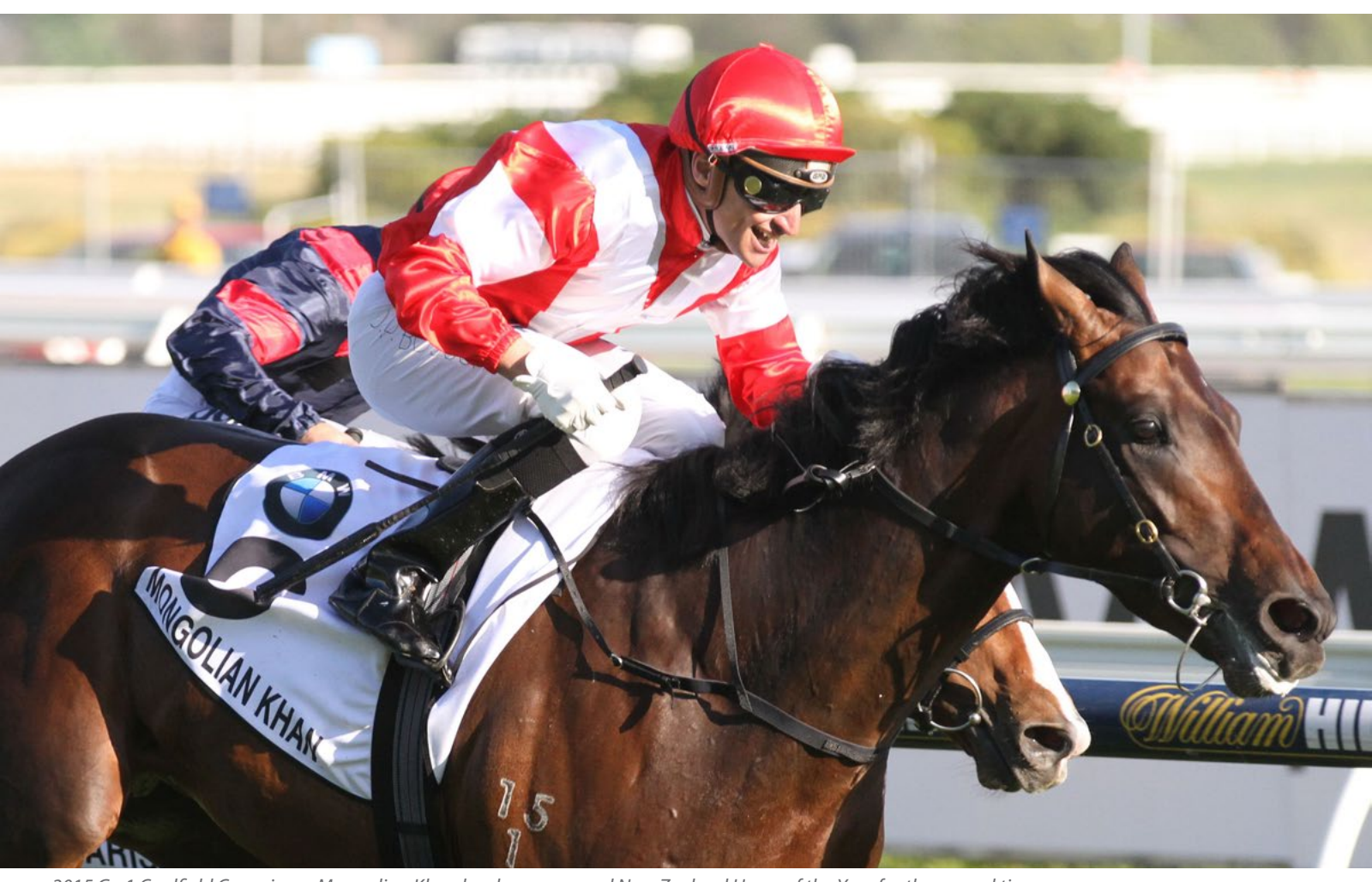
2015 Gr. 1 Caulfield Cup winner Mongolian Khan has been crowned New Zealand Horse of the Year for the second time

further accolade has been bestowed on Mongolian Khan (Holy Roman Emperor) as the multiple Group One winner prepares for the second stage of his career.