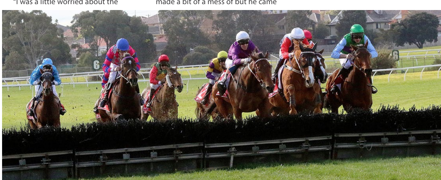
Zanteco (purple colours) is about to botch the last fence but is still too strong on the way to winning the Grand National Hurdle at Sandown