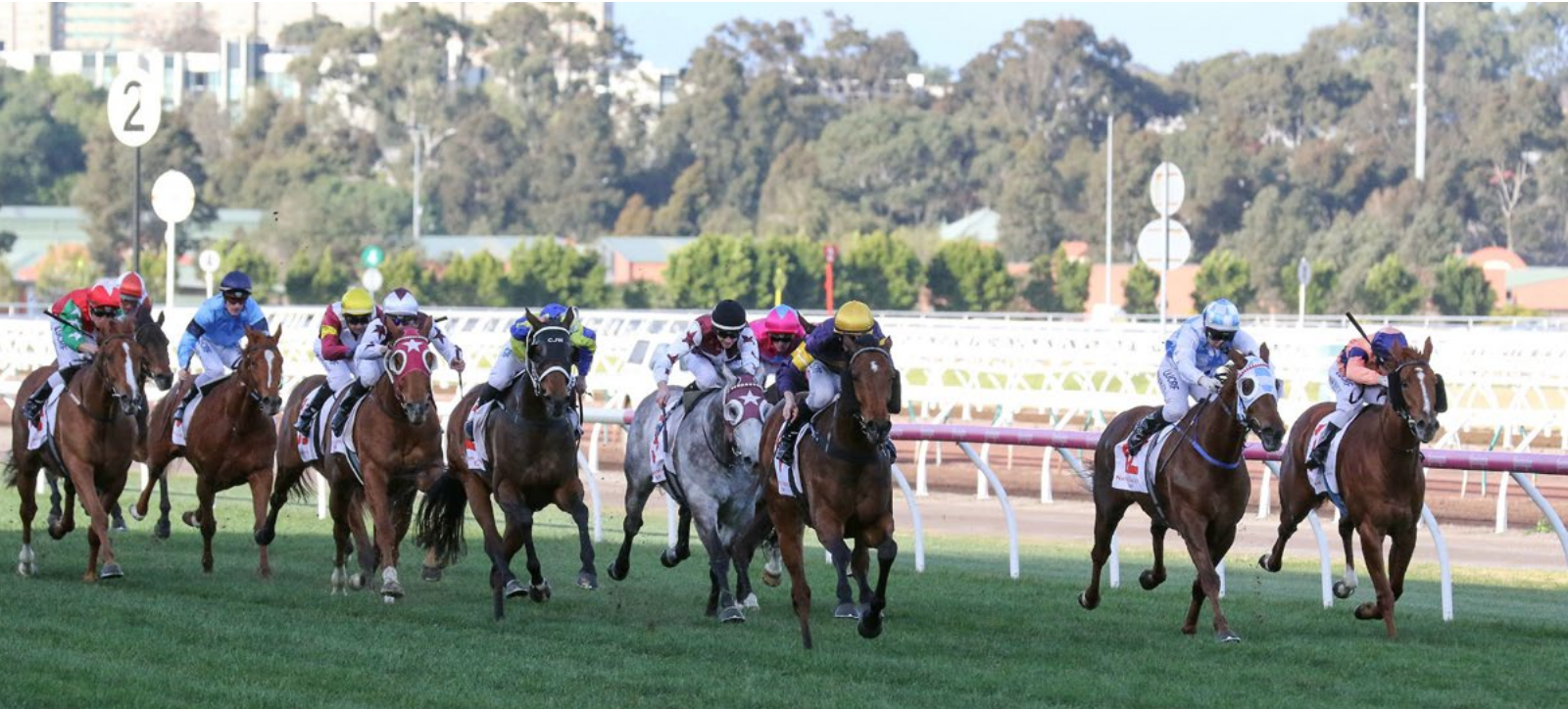
Rhythm To Spare (gold cap) has burst clear of his opposition at Flemington and races away to a 2½ length victory.