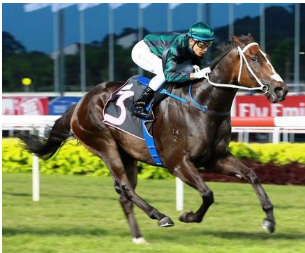
Ancient Warrior is first past the post at Kranji on Friday night... with advocacy to come.

that, which means it did not really take his momentum, and my horse was always hitting the line strongly."