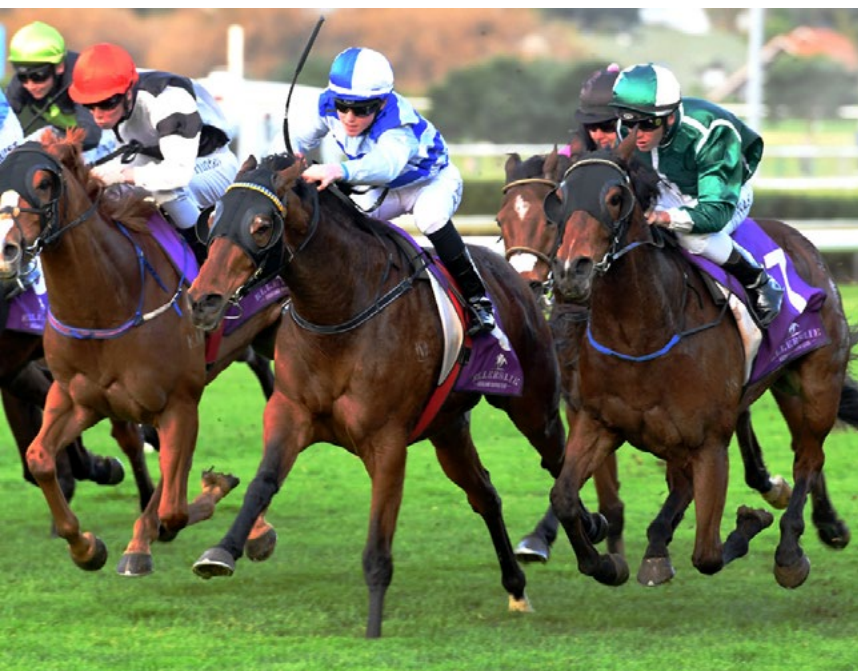
Persuasive and Secret Spirit form the quinella at Ellerslie