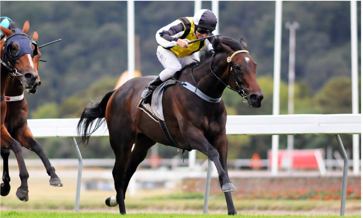
Savaria winning the Gr. 1 New Zealand Oaks