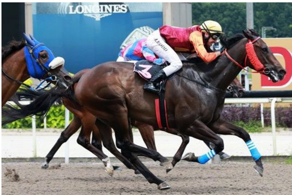
The ever reliable Bring Money Home scores at Kranji