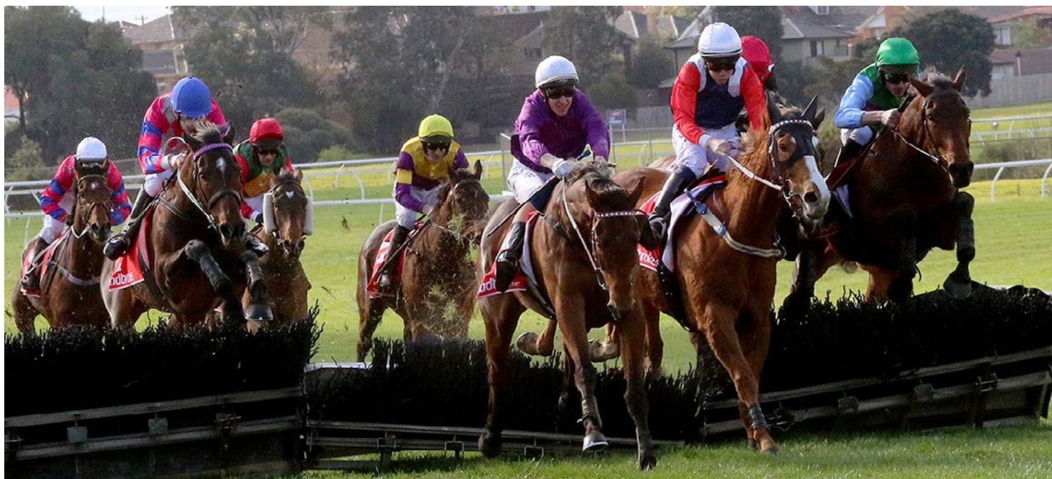
Zanteco captured the Grand National Hurdle before his latest triumph