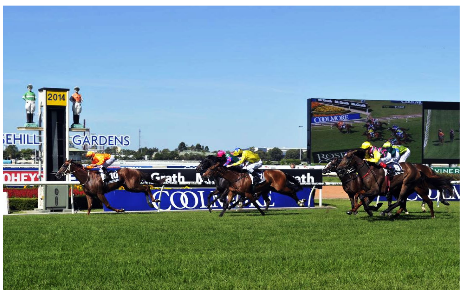
Entirely Platinum will try to snare an elusive Group One win during the upcoming Melbourne spring carnival

he highly talented Entirely Platinum (NZ) (Pentire) is gearing up for another spring carnival in the hope he can snare an elusive Group One win.