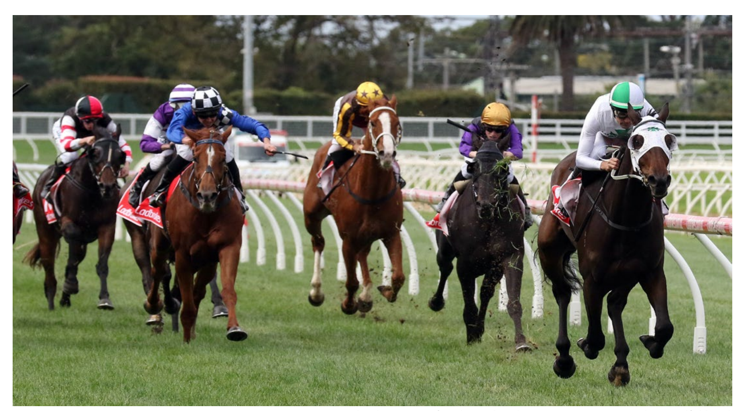
He Ekscels runs away from his rivals in the opening event on yesterday's Caulfield card.