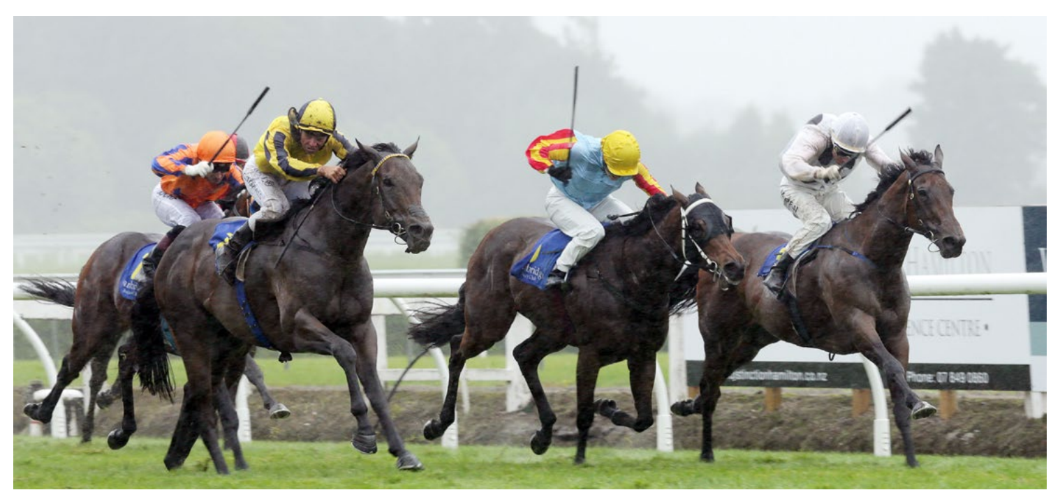
Sweet Leader (yellow and black colours) outfinishes Honey Rider (rails). Between them, O'Rachael fights on into fourth.

uestion marks over the well-being of Sweet Leader (NZ) (O'Reilly) following surgery and a rain-affected track were yesterday answered in emphatic fashion.