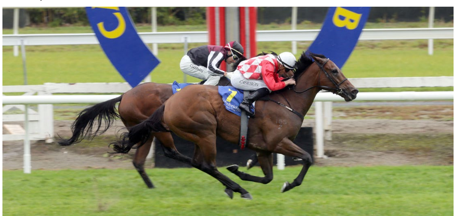
Killarney's late surge takes him past Thatsforsure in the rating 85 sprint at Te Rapa.