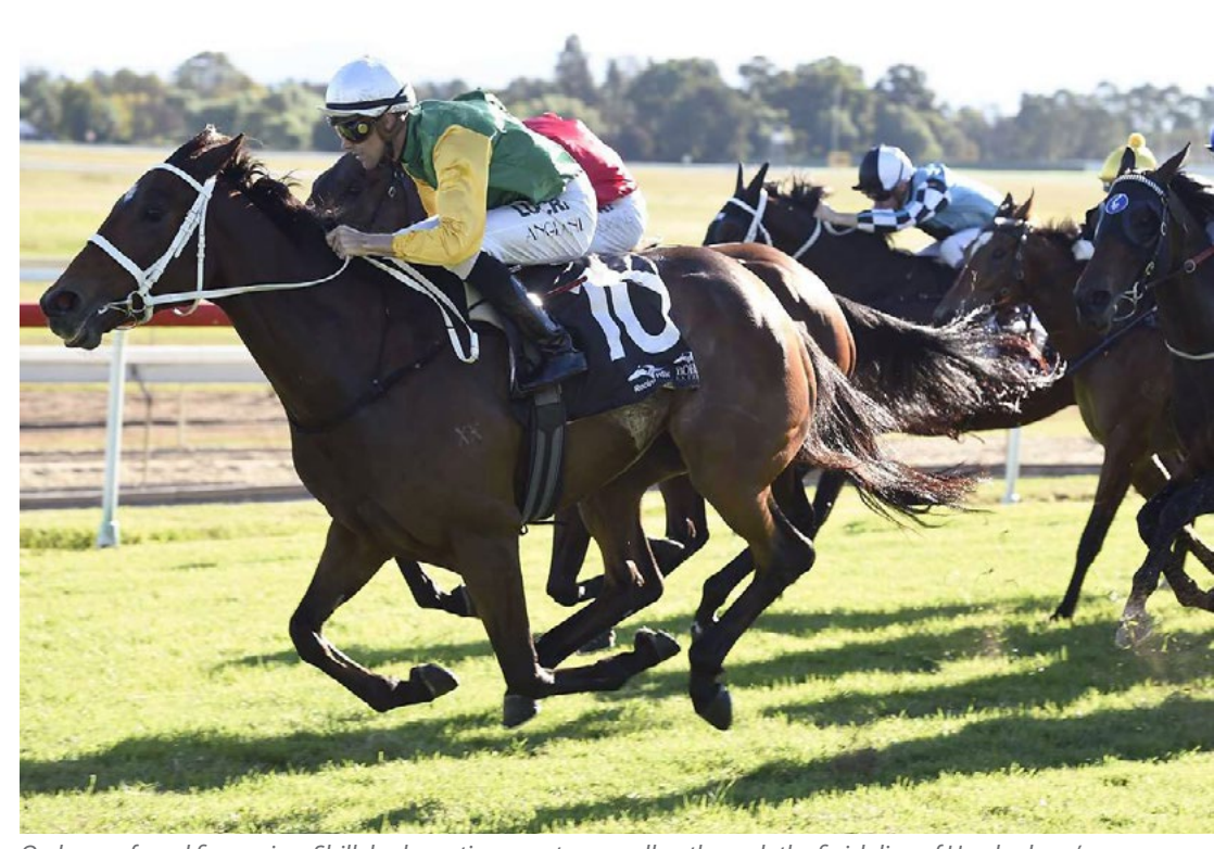
On her preferred firm going, Shillelagh continues a strong gallop through the finish line of Hawkesbury's Godolphin Crown.

Well supported to firm from an opening $16 quote to $11, Shillelagh defeated the heavily backed $2.70 favourite Daysee Doom (Domesday) by three-quarters of a length with another 11/4 lengths back to the Godolphin runner Kinshachi