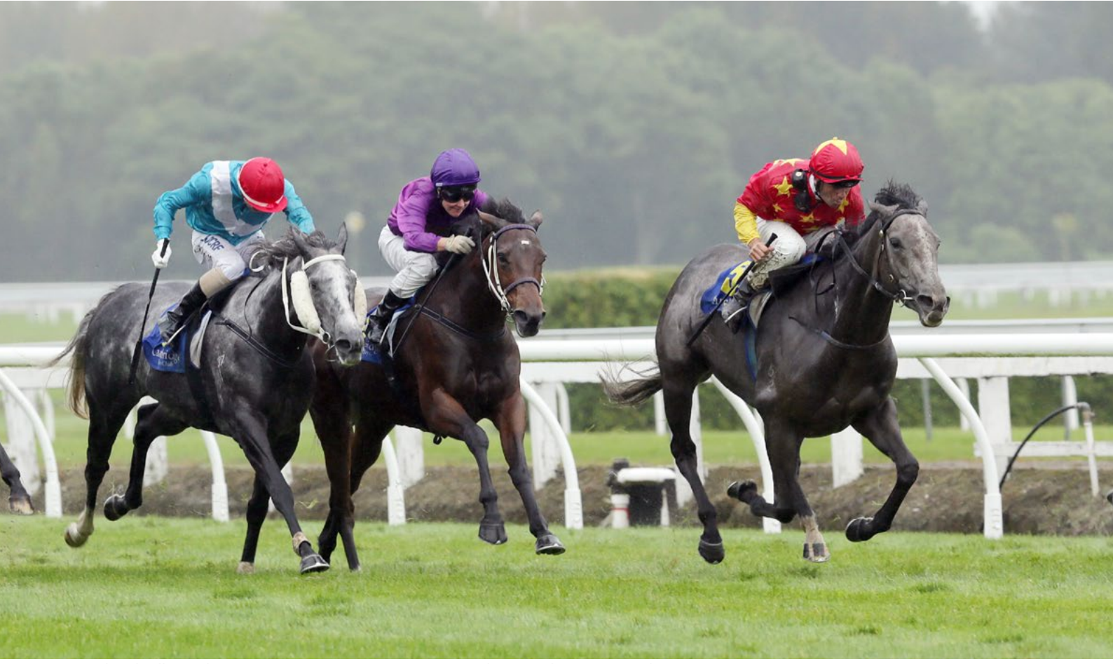
Mime (red and yellow colours) runs out a strong 2000 metres to take yesterday's Travis Stakes at Te Rapa.

uality mare Mime (NZ) (Mastercraftsman) yesterday staked her claim for a trip to Queensland next month in her quest for a first victory at the highest level.