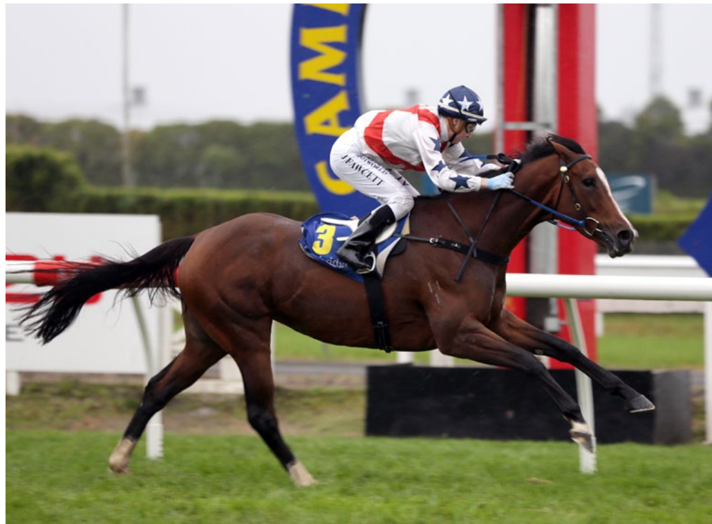
Galaxy Miss returns to form on her favourite track at Te Rapa