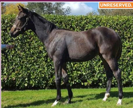
WEANLING FILLY BY POWER.