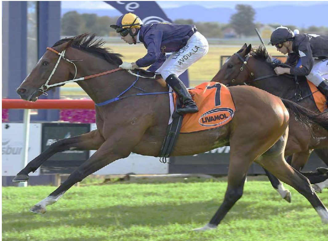
Kingsguard wins the Gr.3 Hawkesbury Gold Cup

Schick admitted there was plenty of confidence in the Hawkes camp that the horse could turn an indifferent form line around in Saturday's contest.