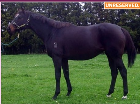
DAUGHTER OF FLYING SPUR.