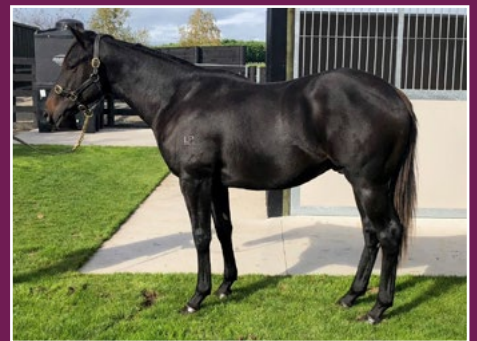
COLT BY HE'S REMARKABLE OUT OF A STAKES PERFORMER.