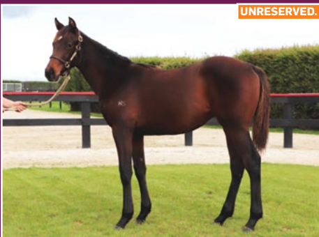
WEANLING FILLY BY SHOCKING, SIRE OF GR.1 FILLY FANATIC.

Featuring 60 Lots including weanlings, yearlings, tried and untried racing stock, broodmares and a Reliable Man share.