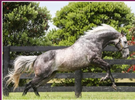
SHARE IN RELIABLE MAN.