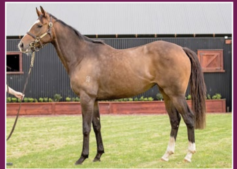
STAYING BRED FILLY BY REDWOOD OUT OF A ZABEEL MARE.