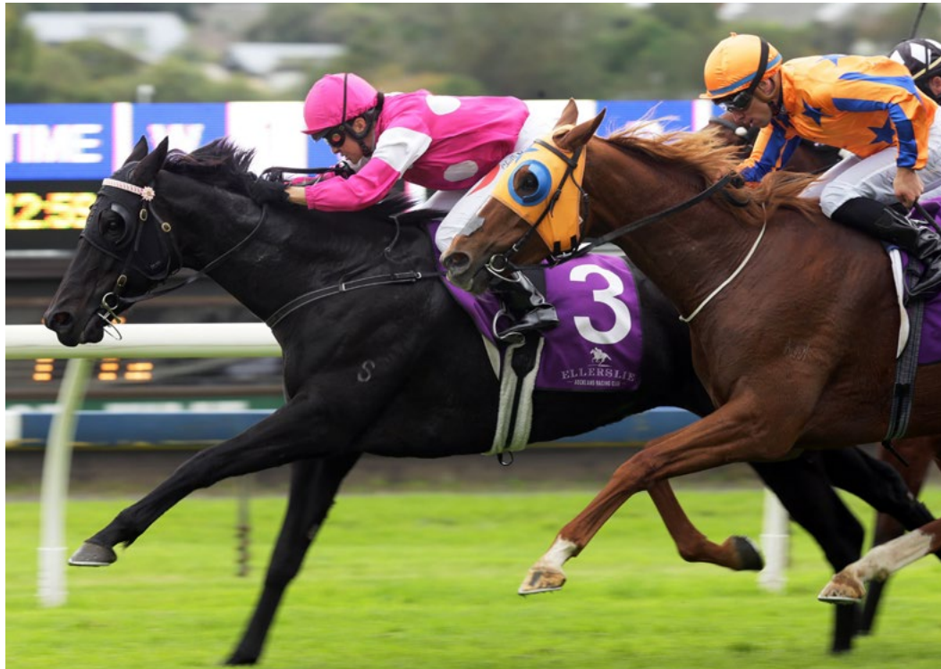
Somethingvain holds all challenges at bay to wrap up her current campaign with a victory

Rogers was referring to the Gr. 1 New Zealand Thoroughbred Breeders' Stakes which was raced at Te Rapa