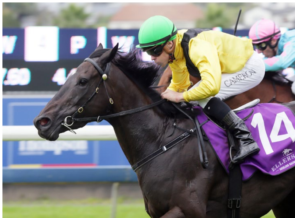
Exciting filly Deals In Heels produced one of the runs of the day at Ellerslie