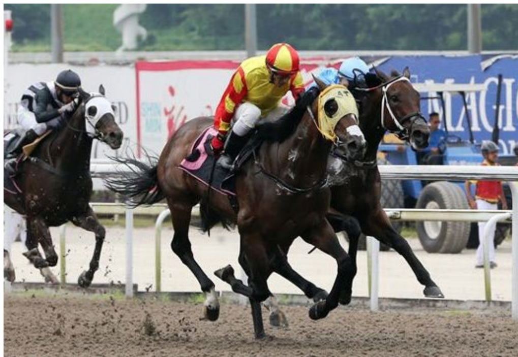
Casing Royal returns to winning form at Kranji

"I will see how he pulls up first before deciding which legs he will go for as he's a horse who needs some rest to be at his best.