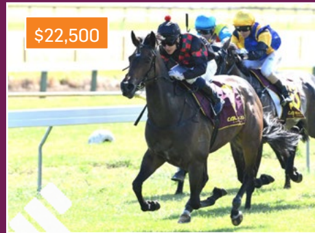
SOLD on gavelhouse.com