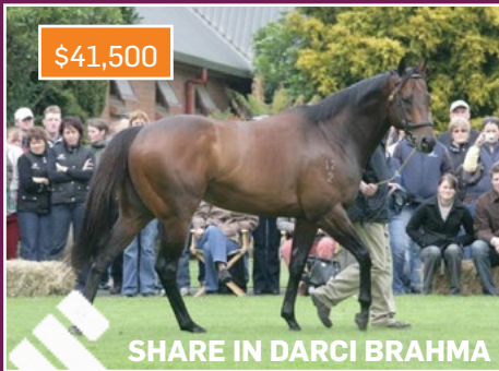
SHARE IN DARCI BRAHMA

Final day to enter our next New Zealand auction - register online now to list.