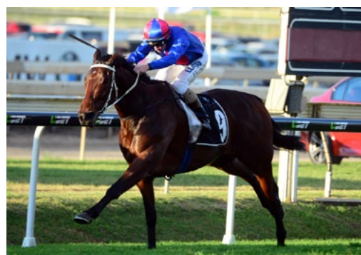
Chocante (NZ) (Shocking)