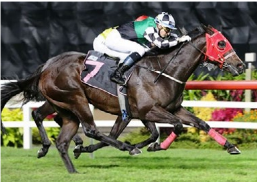
Lord O'Reilly (NZ) (O'Reilly)