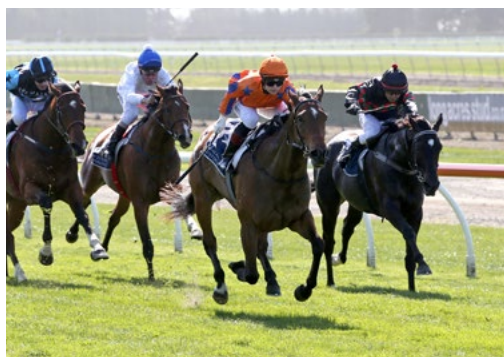
Special Memories (Fastnet Rock)