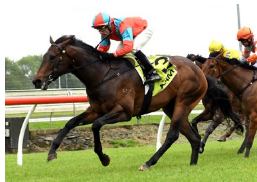
Demonetization (All Too Hard)

"Gift Of Power just had a runny nose and a cough so she's taking a break too."