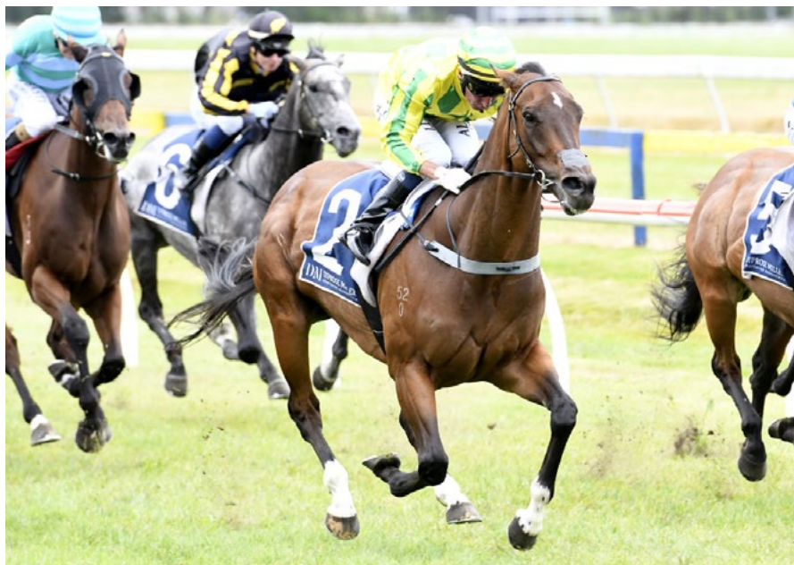
Seventh Up will attempt to take out his second Gr. 2 Manco Easter Handicap this weekend

Seventh Up won fresh-up over 1400m at Rotorua last month then backed up a week later and finished a creditable fifth behind Ocean Emperor (NZ) (Zabeel) in the Gr.2 Windsor Park Stud Japan – NZ International Trophy (1600m) at Matamata