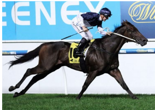
Bassett (NZ) (Savabeel)

"We're going to do a few things different with him and ride him a bit quieter to finish off and if he can do that then we'll step him up to the mile after that."