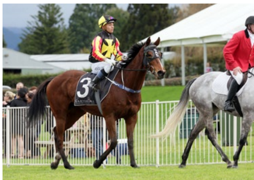
Art Deco (NZ) (Road To Rock)

The Matamata trainer has his sights set on a Singapore feature after receiving confirmation that Ocean Emperor (NZ) (Zabeel) has gained a spot in the Kranji Mile