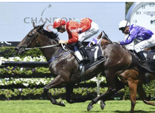
Seabrook (NZ) (Hinchinbrook)