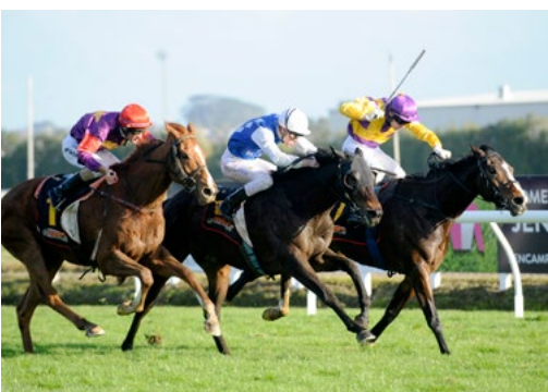
Wanabefamous (NZ) (Star Way)

Hennessy has a proven overseas track record having prepared Ocean Park for Group One wins in the Cox Plate (2040m), Caulfield Stakes (2000m) and the Underwood Stakes (1800m). Full story here