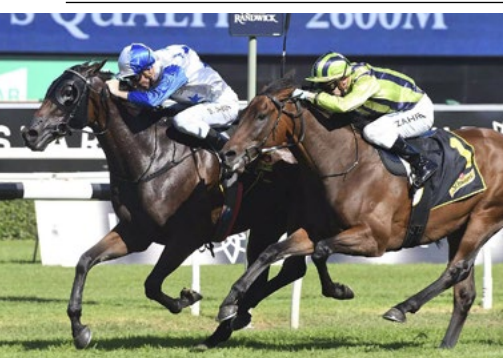
(Sir) Charles Road (Myboycharlie)