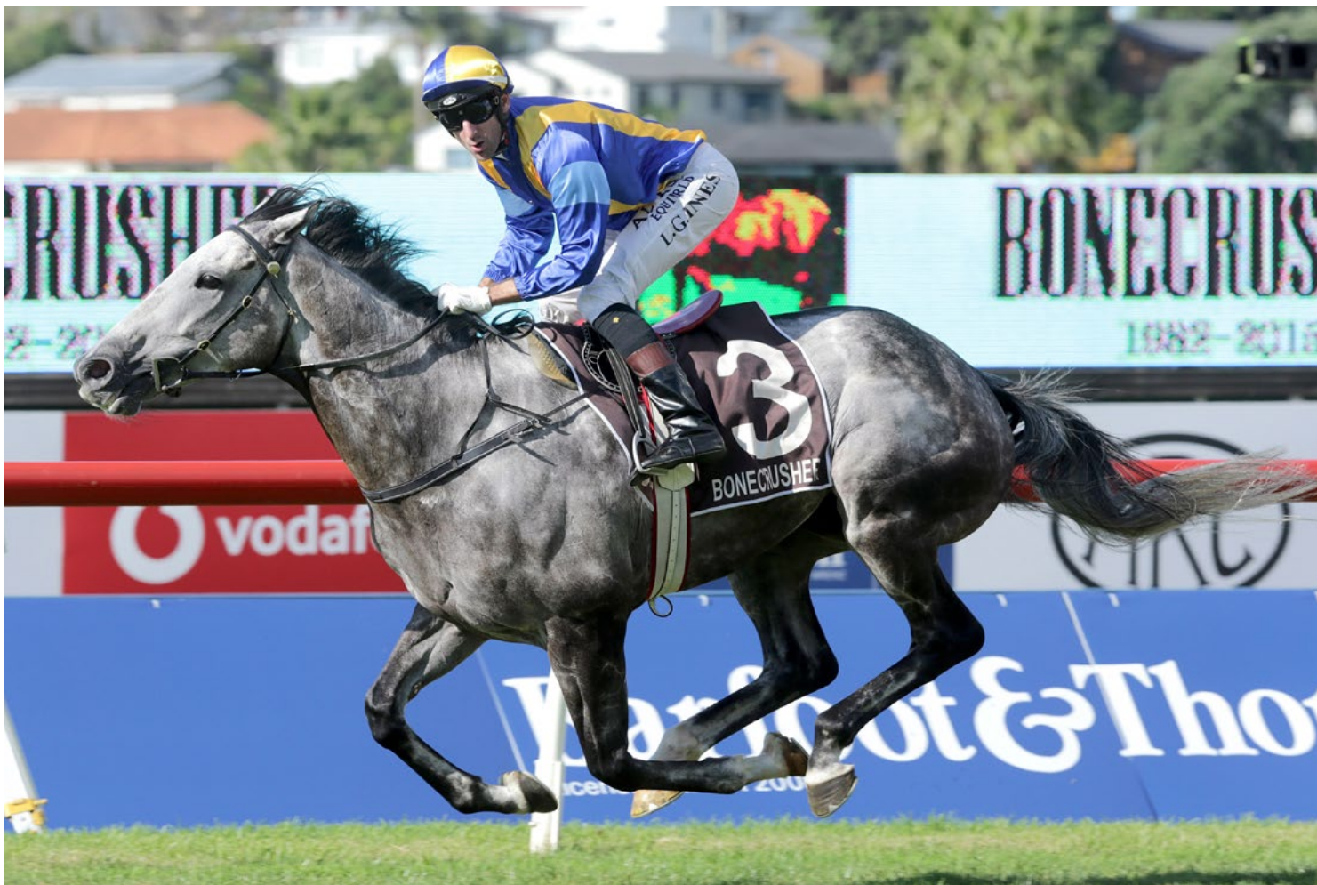
Saint Emilion will trek south to Riccarton on Saturday to contest the Gr.3 Coca-Cola Canterbury Gold Cup