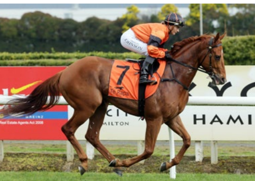
Simply Optimistic (Encosta de Lago)