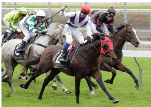
Ocean Emperor (NZ) (Zabeel)

Showcasing stood at Haunui Farm last season at $12,000 + GST and will be represented by three further racing crops in the Southern Hemisphere.