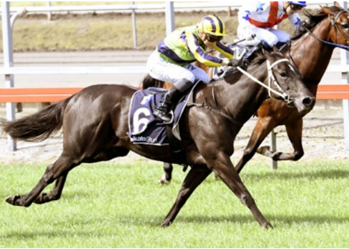
Santa Catarina (NZ) (Savabeel)

produced Santa Catarina (NZ) (Savabeel), a two-year-old filly, who could maintain the trend on May 5.