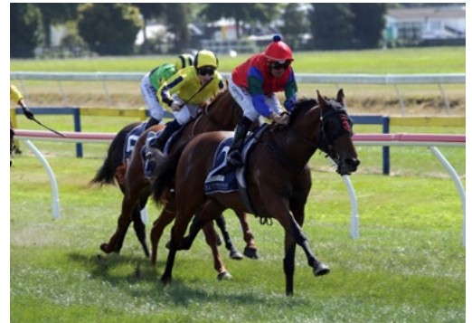
More Wonder (NZ) (Mossman)

More Wonder (NZ) (Mossman) will chase stakes success at Pukekohe on Saturday despite the persistence of Hong Kong