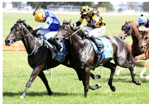
The Ice Knight (NZ) (Iffraaj)