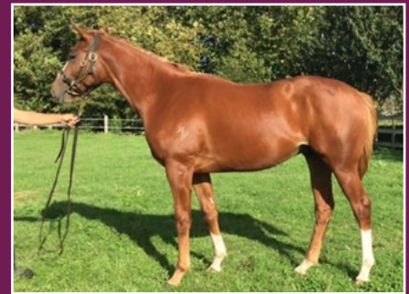
YEARLING COLT BY OCEAN PARK & FROM A STAKES WINNER