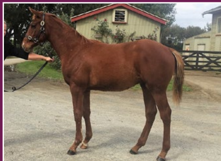
WELL-RELATED WEANLING COLT BY SUPER EASY