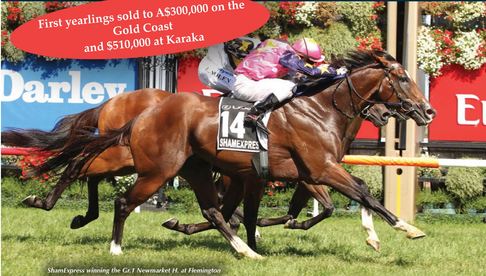
ShamExpress winning the Gr.1 Newmarket H. at Flemington

First yearlings sold to A$300,000 on the Gold Coast and $510,000 at Karaka