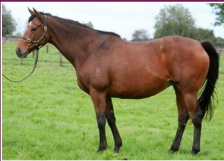
HIGH CHAPARRAL MARE IN FOAL TO ATLANTE