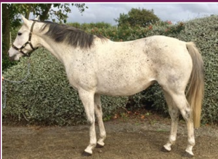
IMPORTED MARE IN FOAL TO FIRST SEASON SIRE VESPA