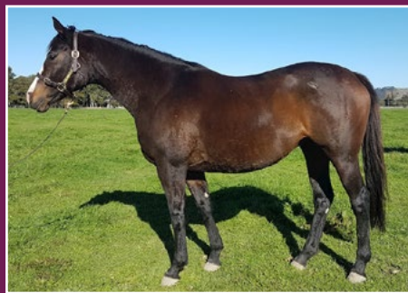
STRAVINSKY HALF-SISTER TO GROUP ONE WINNER NASHVILLE