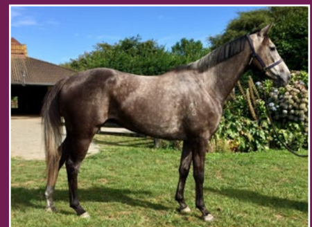
PEARL SERIES ELIGIBLE MASTERCRAFTSMAN FILLY

Bidding closes from 7pm (NZ) time tonight.