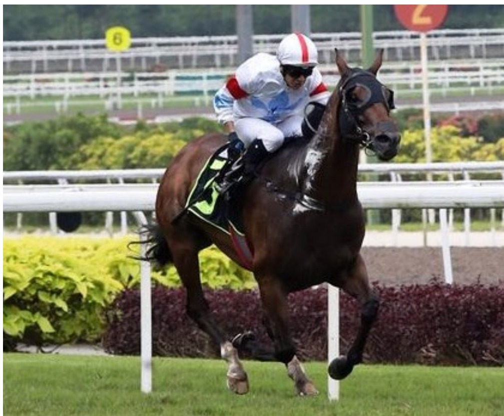
Poseidon cruises home at Kranji

“Seriously, Poseidon is a lovely horse and he’s going very well at the moment. He’s a genuine performer and he deserved today’s win.