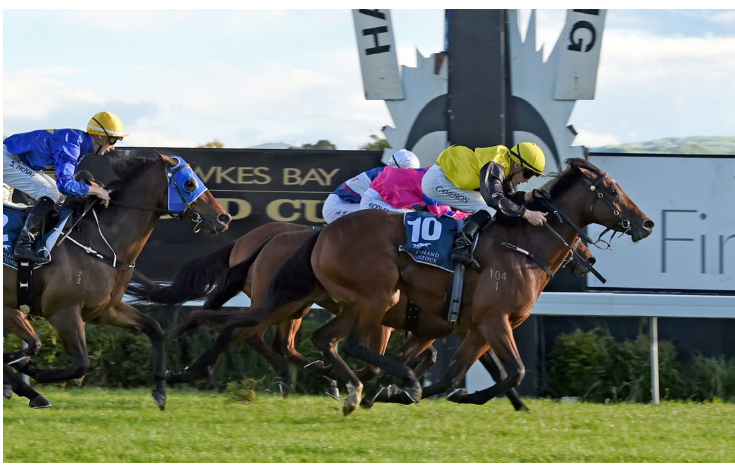
Bonniegirl justifies her favouritism with a storming finish to grab another fresh-up win in the open sprint at Hastings.