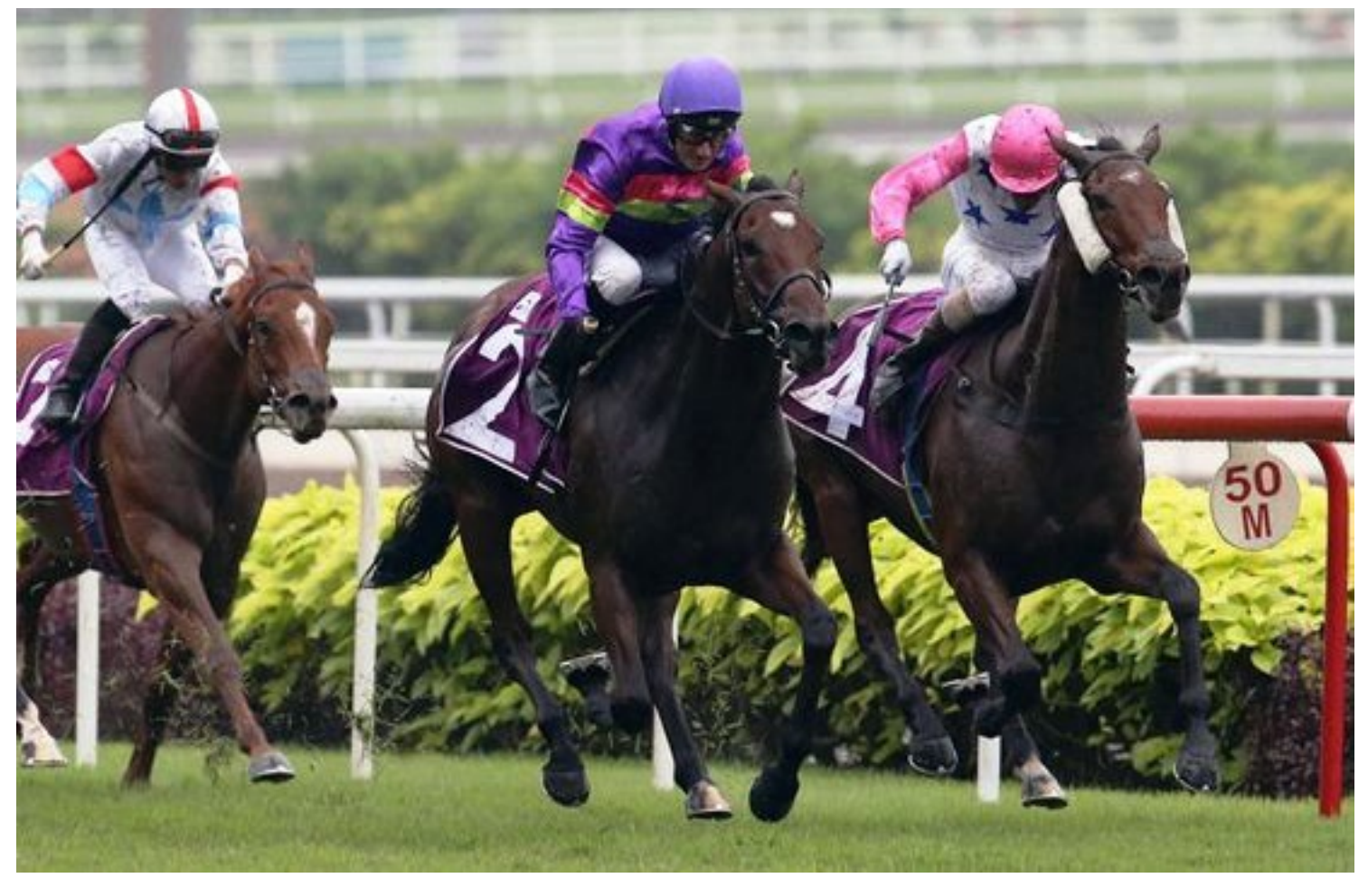
Countofmontecristo continues his winning streak in the Singapore Three-Year-Old Classic on Friday night.

Rising star Countofmontecristo (NZ) (Echoes Of Heaven) kept his unblemished record intact when he brought up his fifth win from as many starts in the $S350,000 Singapore Three-Year-Old Classic, over 1400 metres, at Kranji on Friday night, incidentally picking up a bonus of $S50,000 for winning two legs of the series after capturing the Three-Year-Old Sprint at his previous start.