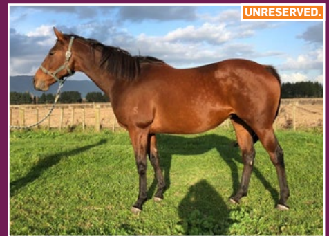
WINNING THORN PARK MARE IN FOAL TO RELIABLE MAN.