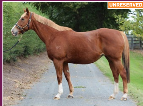
GR.3 WINNER IN AUSTRALIA BY PINS & IN FOAL TO OCEAN PARK.