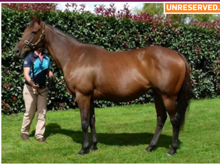
3 IN 1 - WINNER. SHOCKING FOAL AT FOOT & IN FOAL TO SHOCKING

Featuring 59 Lots including weanlings, yearlings, tried and untried racing stock and broodmares.