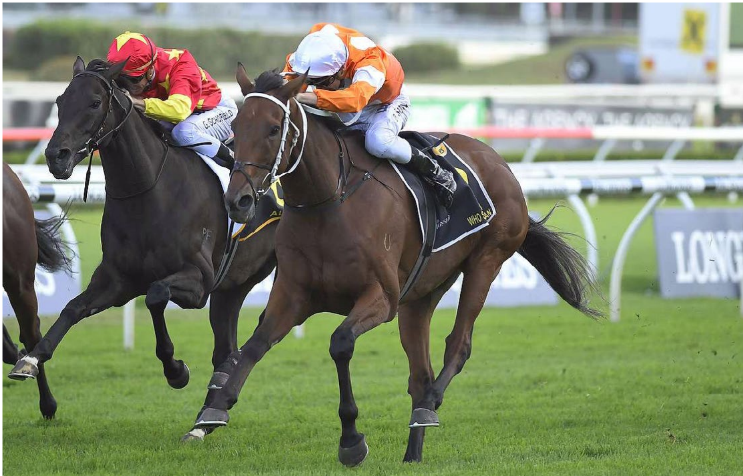
Who Shot Thebarman drives home to score his first win in Sydney in the A$2m Sydney Cup