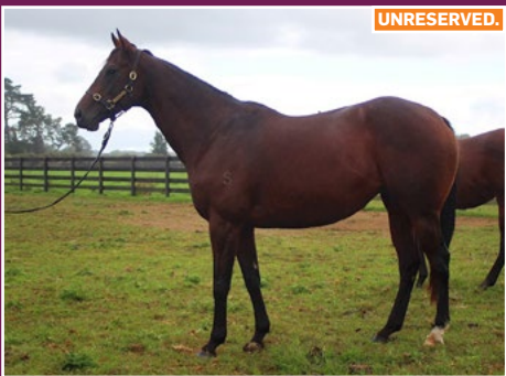
HALF TO A GROUP ONE WINNER IN FOAL TO MONGOLIAN KHAN.