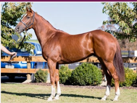
WELL-RELATED, LIGHTLY TRIED MAKFI GELDING.