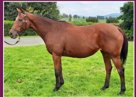
WELL-RELATED ZABEEL MARE IN FOAL TO VADAMOS.