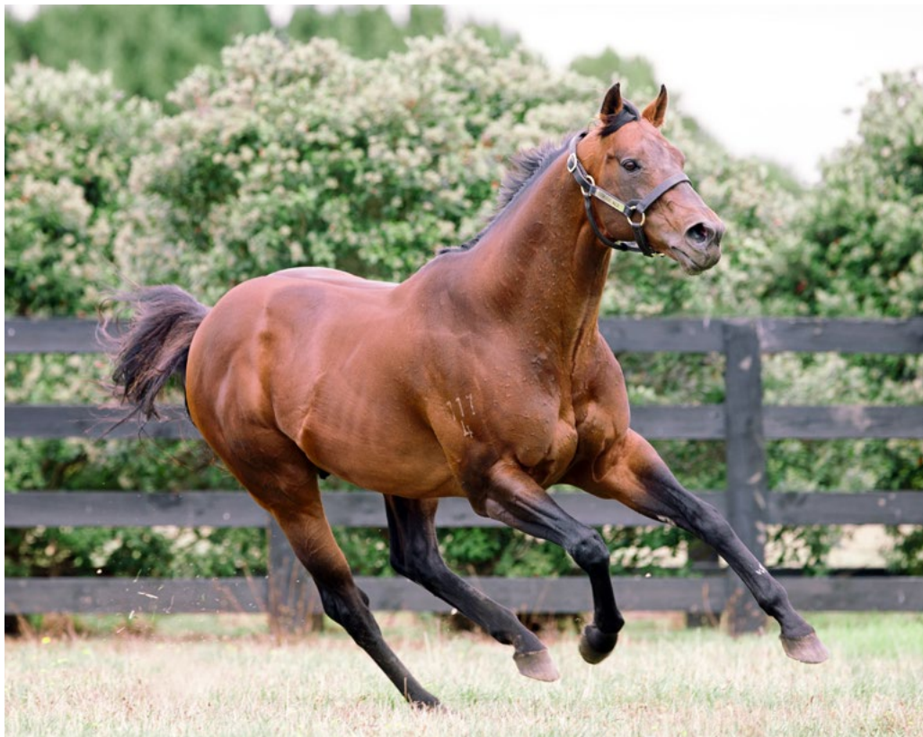
Westbury Stud stallion Swiss Ace, the sire of promising Singapore galloper Zac Ace