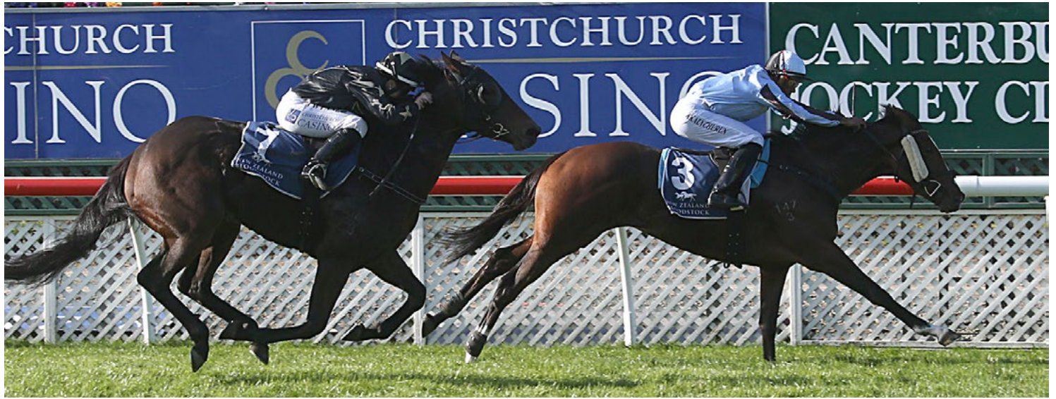
Showemup and Kevin Kalychurun take advantage of an inside run to hold out the northern filly Grand Soleil in Riccarton's New Zealand Bloodstock Airfreight Stakes.