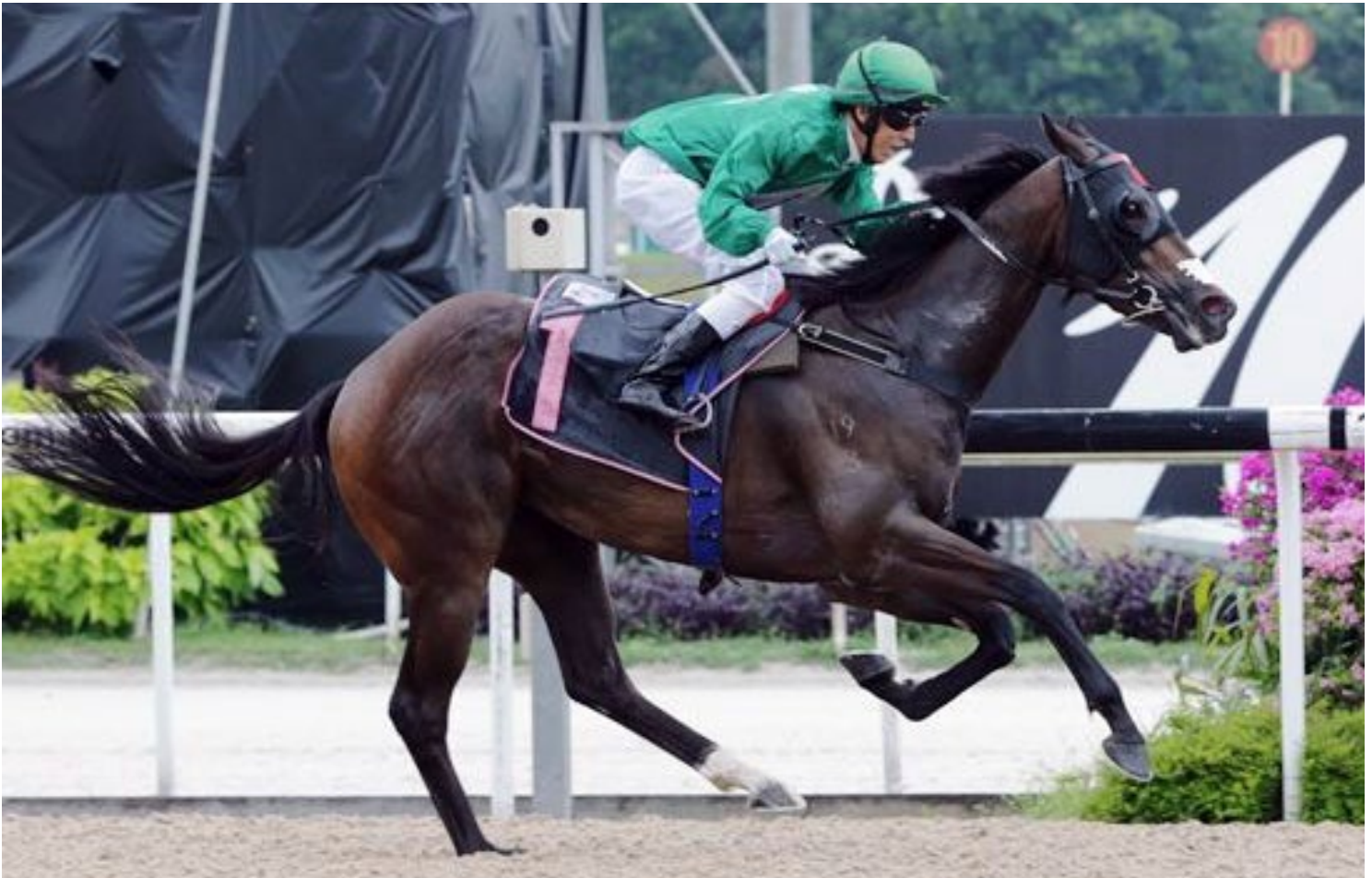
Webster is all class as he clears out at Kranji