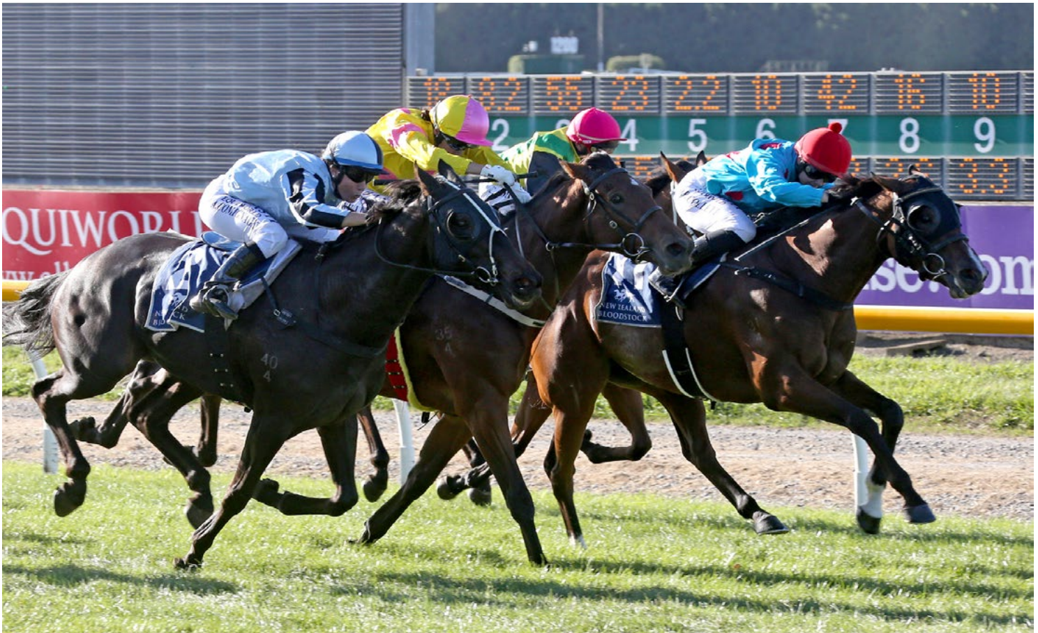
Respin (red cap) holds on for her first stakes victory in a driving finish at Riccarton