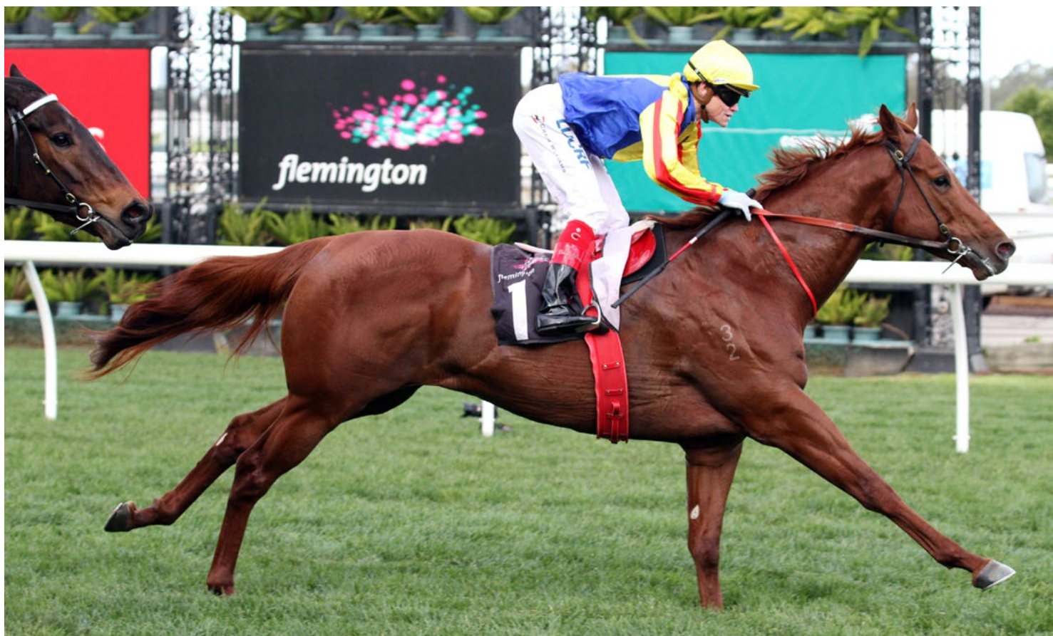
Spieth in winning action at Flemington