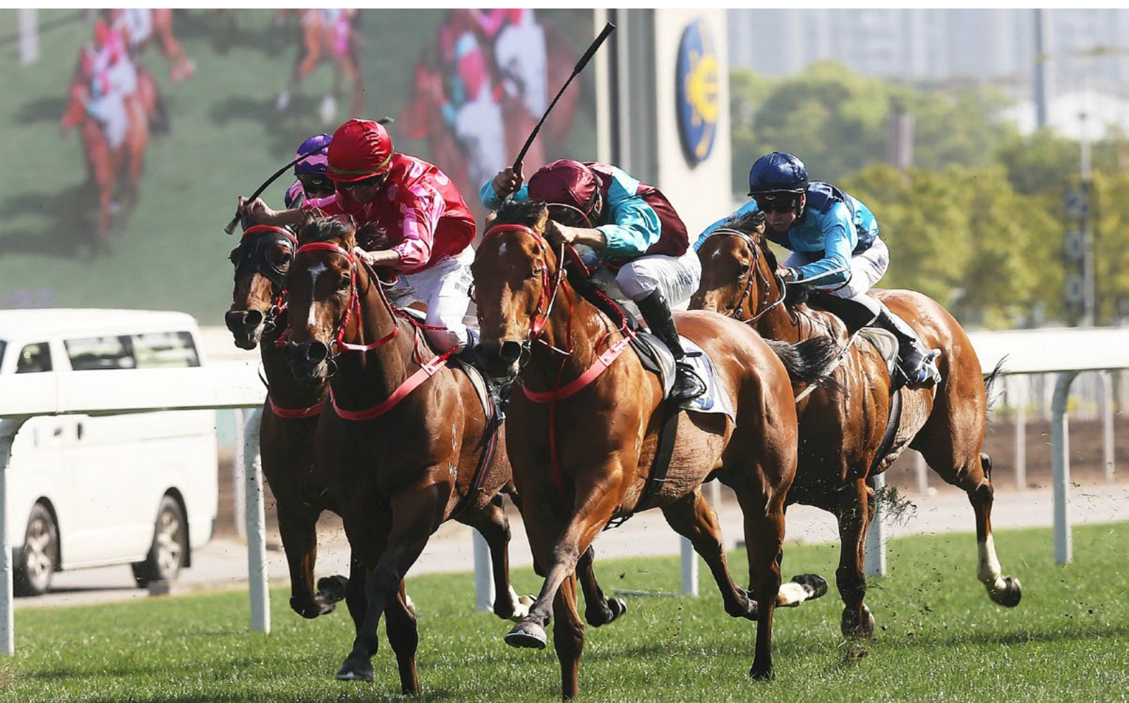
Beat The Clock (outer) storms home to snatch victory in the Gr.2 Sprint Cup at Sha Tin

Jockey Joao Moreira declared that Beat The Clock (Hinchinbrook) was potentially “the best sprinter” in Hong Kong after the galloper scored his first Group victory with a strong last-to-first win in the Gr.2 Sprint Cup (1200m) at Sha Tin 0on Sunday.