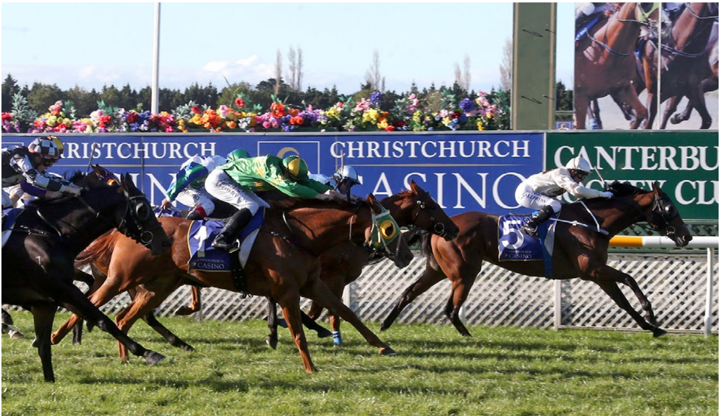
La Fille En Jeu bags another stakes win at Riccarton