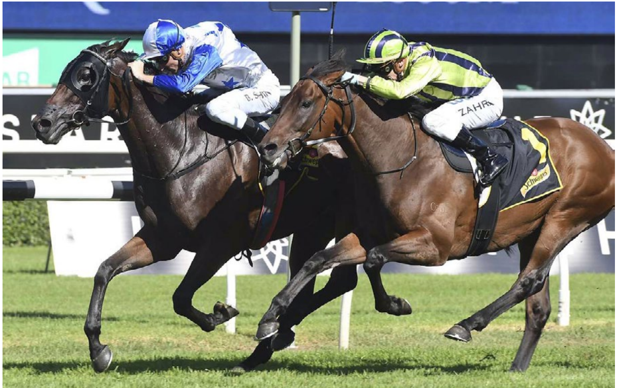
Sir Charles Road wins his Australian debut in the Gr.2 Chairman's Quality at Randwick