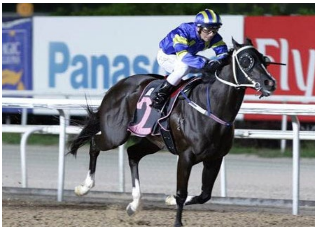
Uncle Lucky successful at the Singapore Turf Club on Friday night (STC)