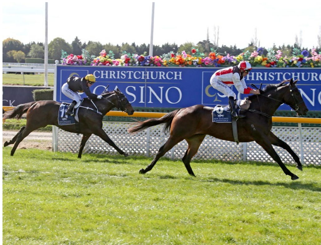
Queensland carnival on Upperhand’s radar after Riccarton win