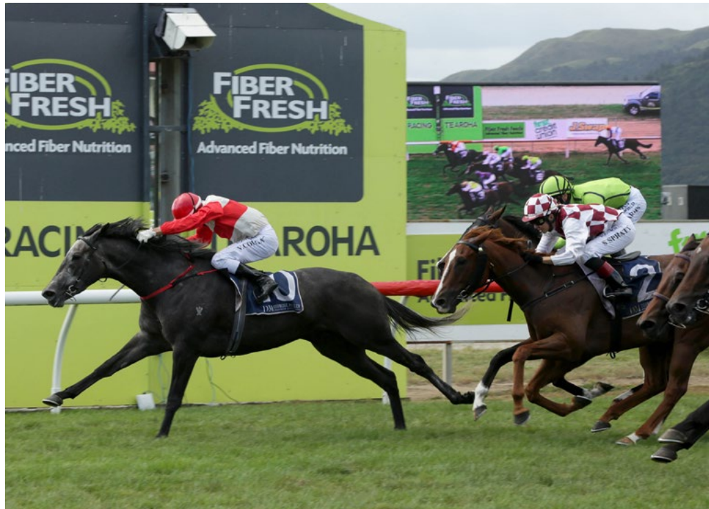
Gifted filly Le Castile in winning form at Te Aroha