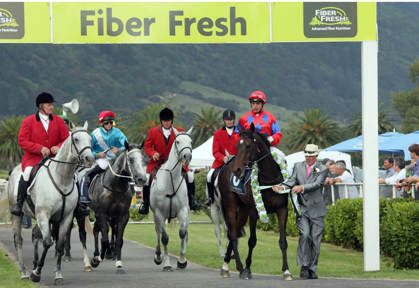
Miss Wilson returns to scale after winning the Group One feature at Te Aroha