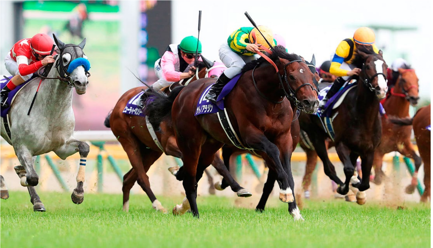
Satono Aladdin winning the Gr.1 Tokyo Yasuda Kinen

A successful long-standing international partnership will again join forces in 2018 with Rich Hill Stud to stand the Group One-winning Japanese miler Satono Aladdin , a son of Shadai Stallion Station's sire sensation Deep Impact.