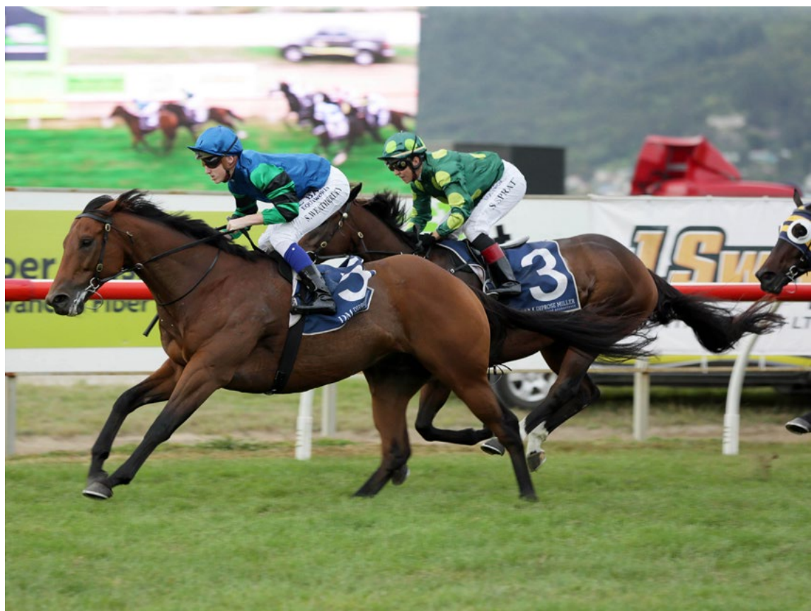
Sultan Of Swing returned an outstanding Gr.2 Easter Handicap (1600m) trial with his Te Aroha success