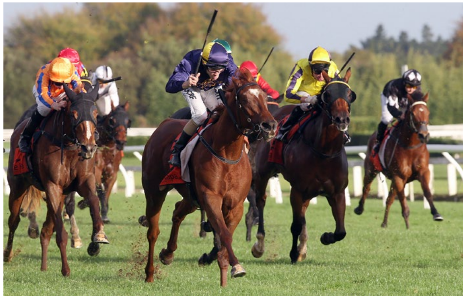
Impressive filly Let Me Roar makes it four from four as she dashes clear on the weekend

“They did get close to her but even when they were pulling up nothing could get past her so she is a filly with plenty of ticker.